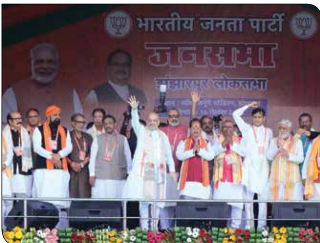
Union Home & Cooperation Minister Shri Amit Shah taking the greetings of people in a public meeting at Jhanjharpur, Bihar on 16 September, 2023