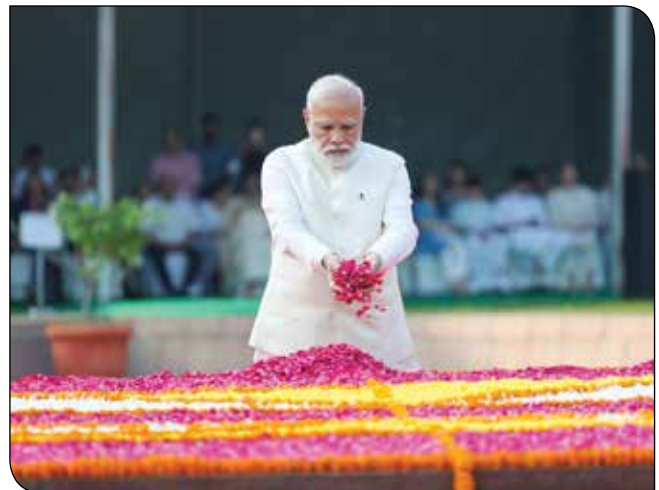
PM Shri Narendra Modi paying floral tributes at the Samadhi of former Prime Minister Shri Lal Bahadur Shastri on his Jayanti at Vijay Ghat in Delhi on October 02, 2023