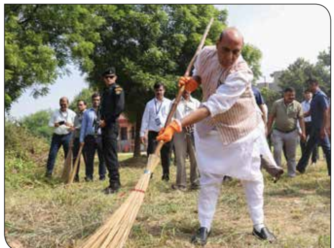
Defence Minister Shri Rajnath Singh participating in the 'Swachhata Hi Seva' campaign in New Delhi on 01 October, 2023