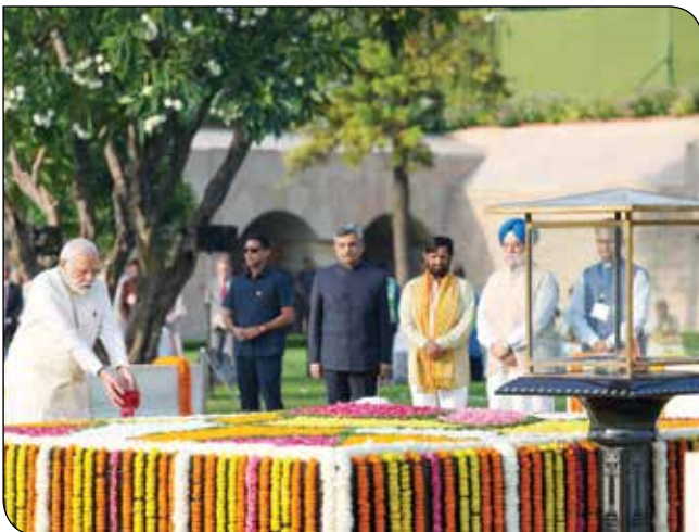
PM Shri Narendra Modi paying floral tributes at the Samadhi of Mahatma Gandhi on the occasion of Gandhi Jayanti at Rajghat in New Delhi on October 02, 2023