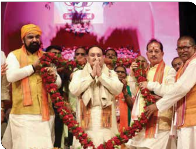
Bihar BJP welcomes BJP National President Shri JP Nadda at Kailashpati Mishraji's Janm Shatabdi Samaroh in Patna on 05 October, 2023