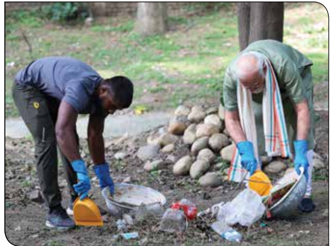
PM Shri Narendra Modi participating in 'Swachhta hi Seva' campaign in the remembrance of Father of the Nation Mahatma Gandhi in New Delhi on October 01, 2023