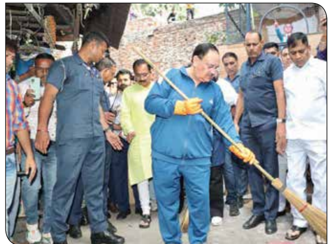
BJP President Shri JP Nadda participated in 'Swachhata Hi Seva' campaign in New Delhi on 01 October, 2023