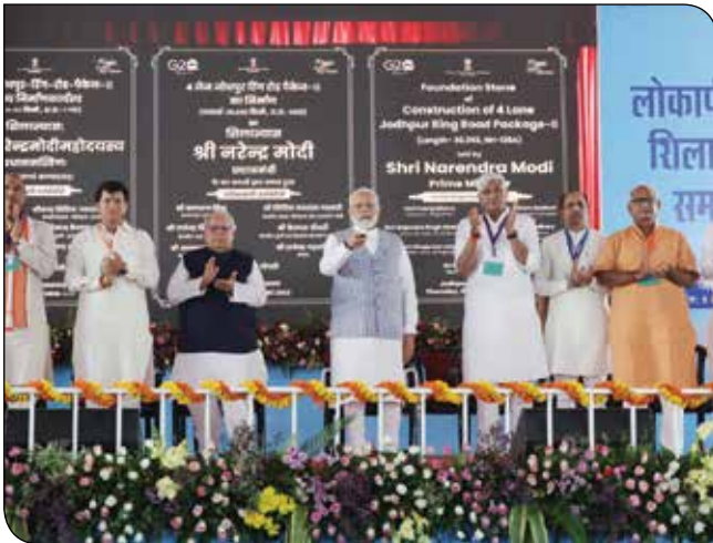
PM Shri Narendra Modi lays foundation stone and dedicates to nation various development projects at Jodhpur in Rajasthan on October 05, 2023