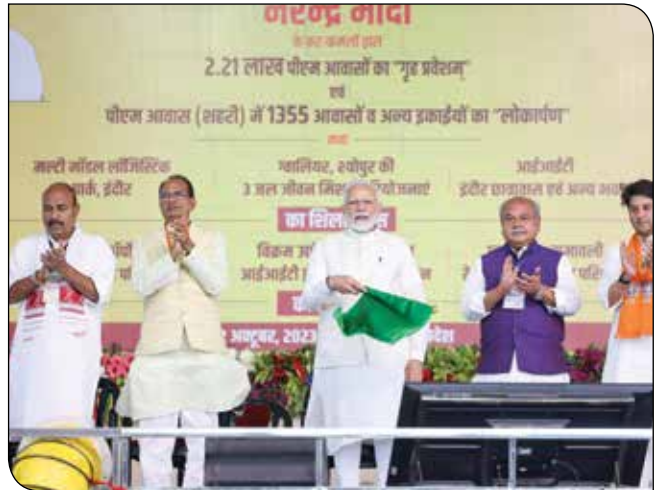
PM Shri Narendra Modi dedicates various projects and flags off train between Gwalior and Sumaoli in Madhya Pradesh on October 02, 2023