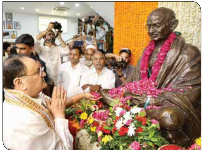
BJP National President Shri JP Nadda paying floral tributes at Khadi Store and purchased Khadi clothes on the occasion of Gandhi Jayanti at Connaught Place, New Delhi on 02 October, 2023