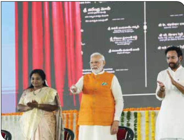
PM Shri Narendra Modi lays foundation stone and dedicates to nation various developmental projects at Mahbubnagar in Telangana on October 01, 2023