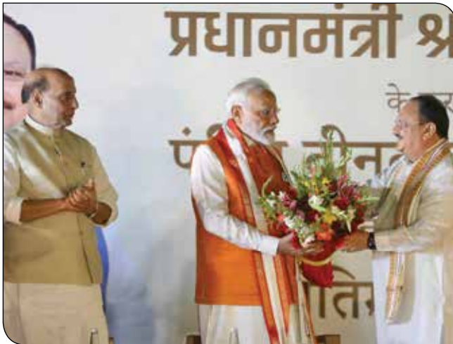
BJP National President Shri JP Nadda and Defence Minister Shri Rajnath Singh welcome PM Shri Narendra Modi before unveiling the statue of Pandit Deendayal Upadhyay in New Delhi on 25 September, 2023