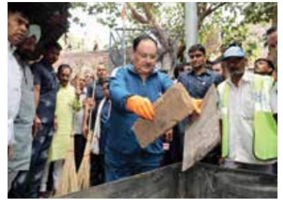
BJP KARYAKARTAS ARE MAKING THE CLEANLINESS CAMPAIGN A MASS MOVEMENT