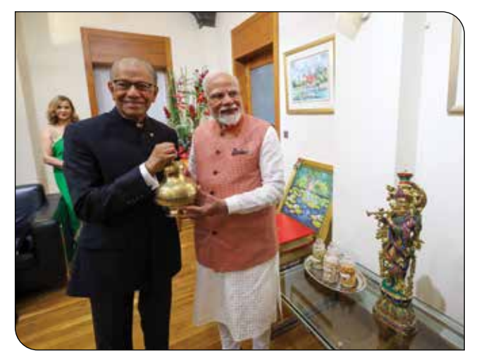
PM Shri Narendra Modi meets the Prime Minister of Mauritius, Dr Navinchandra Ramgoolam at Port Louis in Mauritius on March 11, 2025