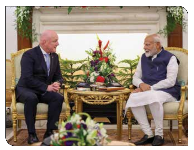
PM Shri Narendra Modi meets the Prime Minister of New Zealand, Mr. Christopher Luxon at Hyderabad House in New Delhi on March 17, 2025