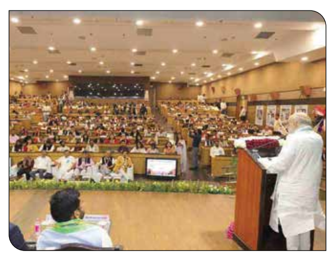
Union Home & Cooperation Minister Shri Amit Shah addressing at the North-East Students' & Youth Parliament in New Delhi on 11 March 2025