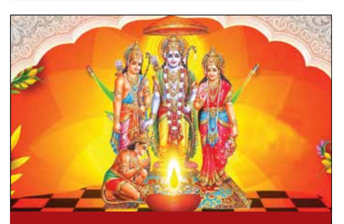
KAMAL SANDESH PARIVAR wishes a very happy SHRI RAM NAVAMI (06 APRIL) to all of its readers