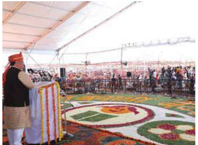
BJP National President Shri JP Nadda addressing a massive Pragati Rally in Sirsa, Haryana