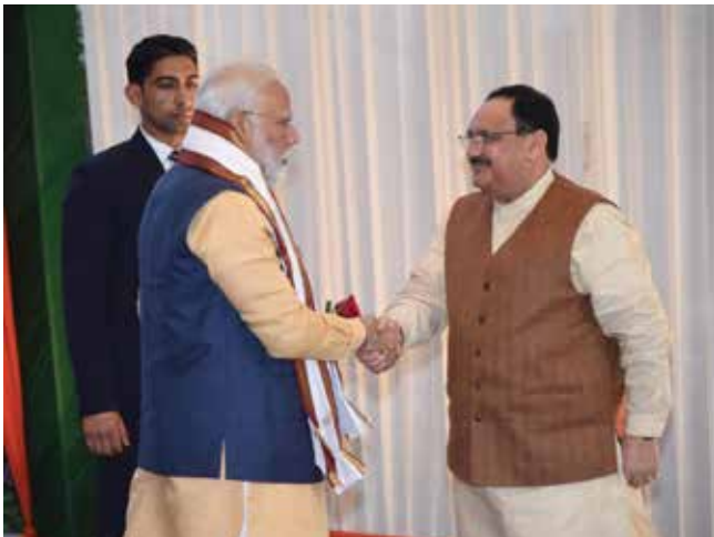
BJP National President Shri JP Nadda welcoming PM Shri Narendra Modi at BJP Head Quarters in New Delhi for Central Election Committee Meeting