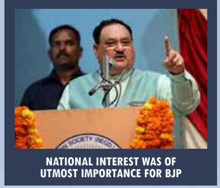
NATIONAL INTEREST WAS OF UTMOST IMPORTANCE FOR BJP