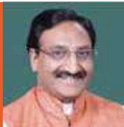
RAMESH POKHRIYAL NISHANK

"Daughters are not a burden but the pride of the whole family. We realise the power of our daughters when we see a woman fighter pilot. The country feels proud whenever our daughters bag gold medals, or for that matter any medal, in the Olympics."