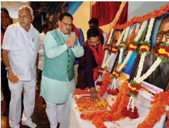
BJP National President Shri JP Nadda flanked by Karnataka CM Shri B.S. Yediyurappa paying floral tributes before the commencement of Intellectuals meet in Bengaluru, Karnataka