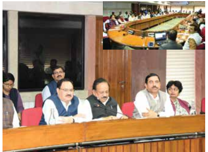
BJP National President Shri JP Nadda attended the meeting of all Doctor MPs on COVID-19 in New Delhi