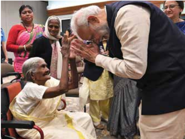
Prime Minister Shri Narendra Modi interacting with a Nari Shakti Awardee and taking her blessings in New Delhi