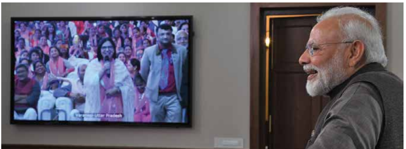
PM Shri Narendra Modi interacts with beneficiaries of Pradhan Mantri Bhartiya Janaushadhi Pariyojana in New Delhi