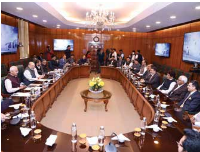
Union Home Minister Shri Amit Shah meeting with a delegation from J&K's newly formed Apni Party led by Shri Altaf Bukhari in New Delhi