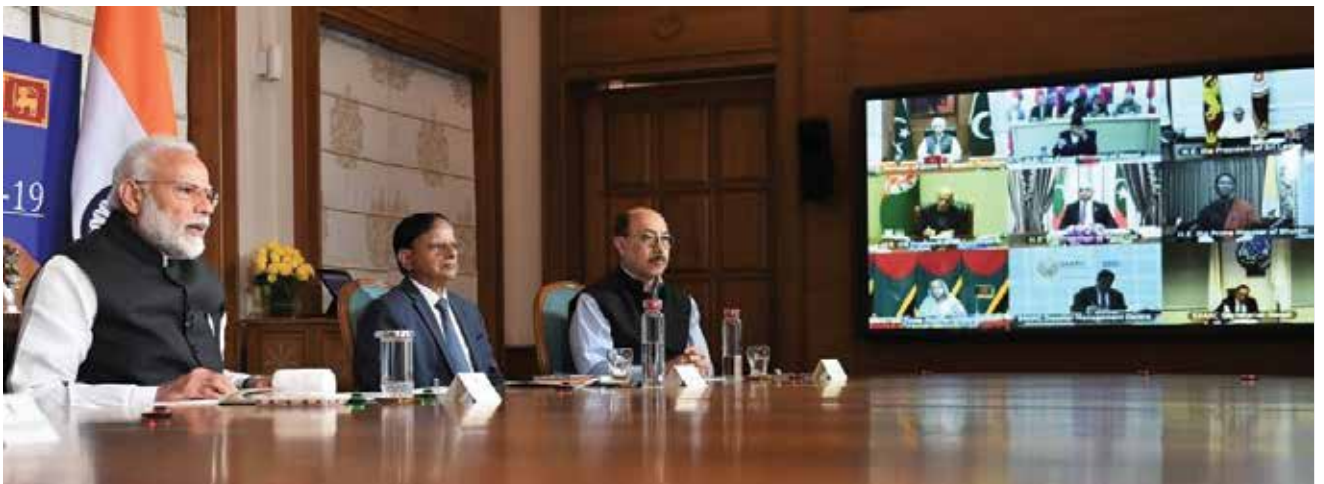
PM Shri Narendra Modi interacts in Video Conferencing with leaders of SAARC to combat COVID-19 in the region