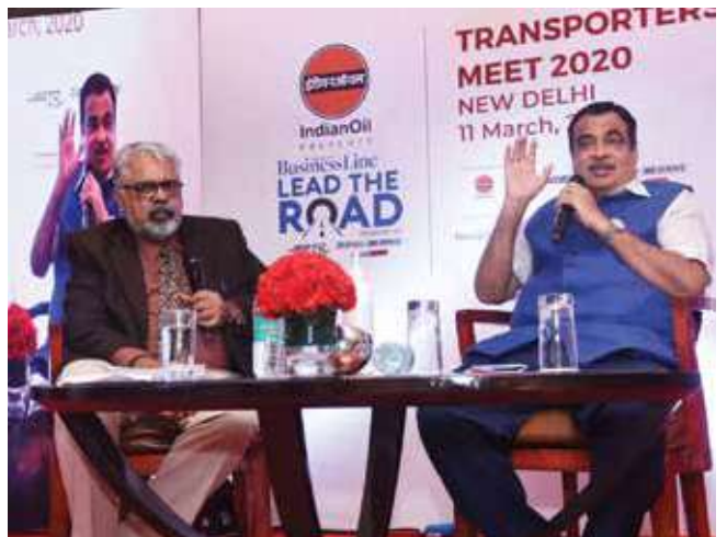
Union Minister Shri Nitin Gadkari addressing the Transporters Meet 2020 in New Delhi