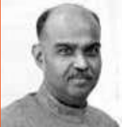
DR. SYAMA PRASAD MOOKERJEE

Dr. Syama Prasad Mookerjee in his presidential address at the first Convention of All India Bharatiya Jana Sangh held in Delhi on 21st October, 1951 elaborated on main reasons behind the formation of Bharatiya Janasangh. We are publishing the full text of his speech for our esteemed readers :