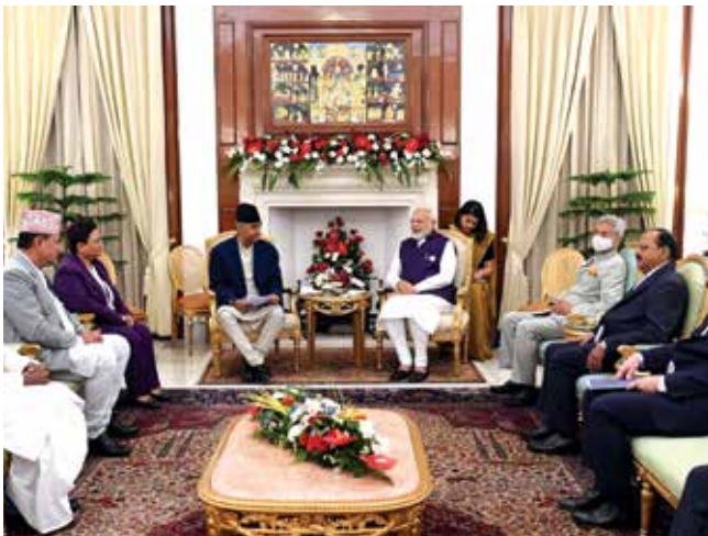
PM Shri Narendra Modi meeting the Prime Minister of Nepal Mr. Sher Bahadur Deuba at Hyderabad House in New Delhi