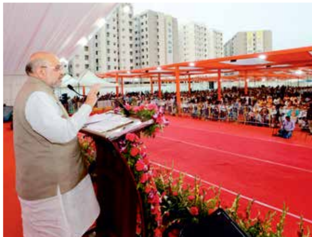
Union Home Minister Shri Amit Shah addressing the gathering after Inauguration of various development works in Ahmedabad, Gujarat