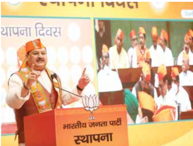
BJP National President Shri JP Nadda addressing karyakartas on the occasion of BJP's 42nd Sthapna Diwas in New Delhi