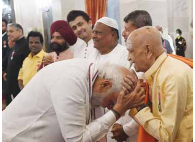
PM Shri Narendra Modi at the Civil Investiture Ceremony - II at Rashtrapati Bhavan in New Delhi