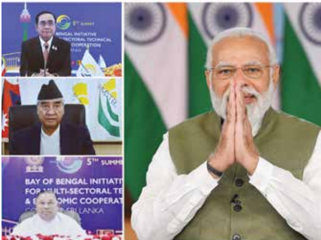
PM Shri Narendra Modi at the 5th BIMSTEC (Bay of Bengal Initiative for Multi-Sectoral Technical and Economic Cooperation) Summit in New Delhi