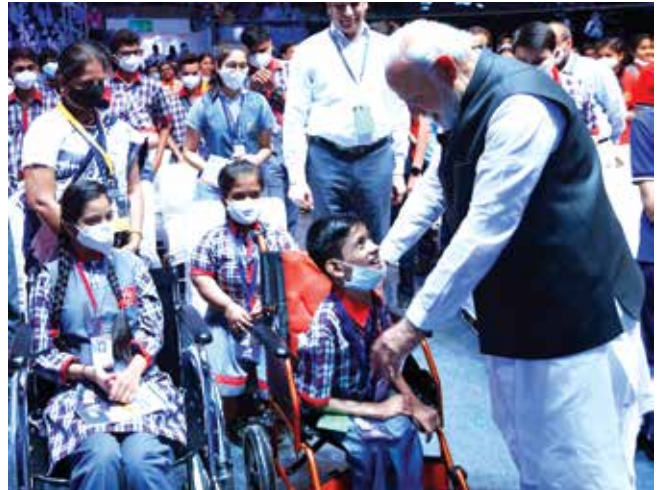
PM Shri Narendra Modi interacting with the students, during the 5th edition of 'Pariksha Pe Charcha 2022', at Talkatora Stadium in New Delhi