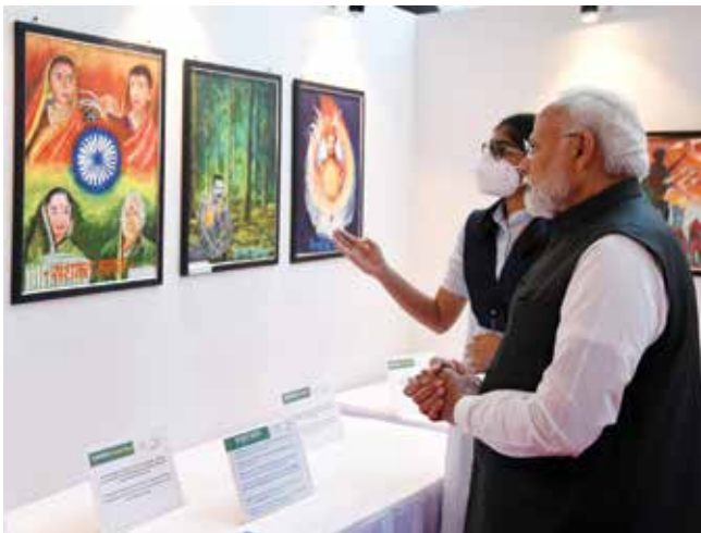
PM Shri Narendra Modi inspecting the exhibits of the students, during the 5th edition of 'Pariksha Pe Charcha 2022' at Talkatora Stadium, in New Delhi