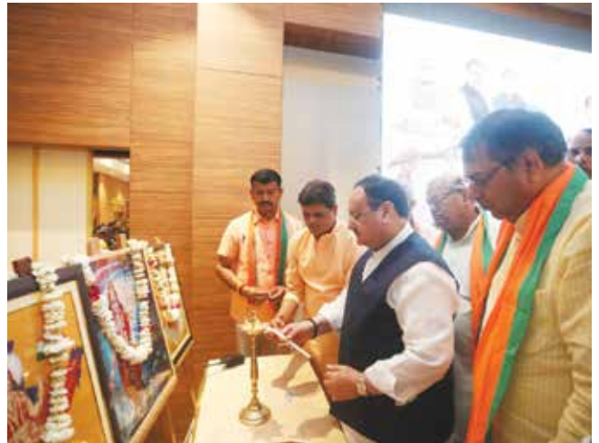
BJP National President Shri JP Nadda lighting the lamp to inaugurate ST Sammelan in Sawai Madhopur, Rajasthan