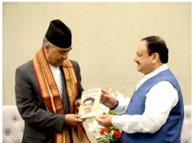
BJP National President Shri JP Nadda welcomes Prime Minister of Nepal Shri Sher Bahadur Deuba at BJP HQ 6A DDU Marg, New Delhi