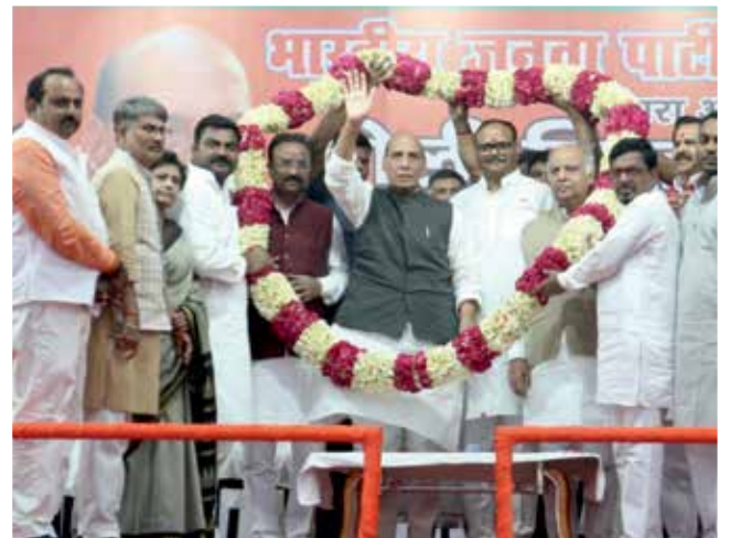
Defence Minister Shri Rajnath Singh participating in a thanks giving programme for landslide victory of BJP with citizens of Lucknow in Uttar Pradesh