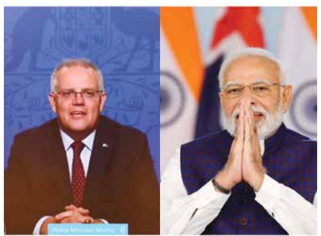
PM Shri Narendra Modi at the virtual signing ceremony of the India-Australia Economic Cooperation and Trade Agreement ('IndAus ECTA') in New Delhi