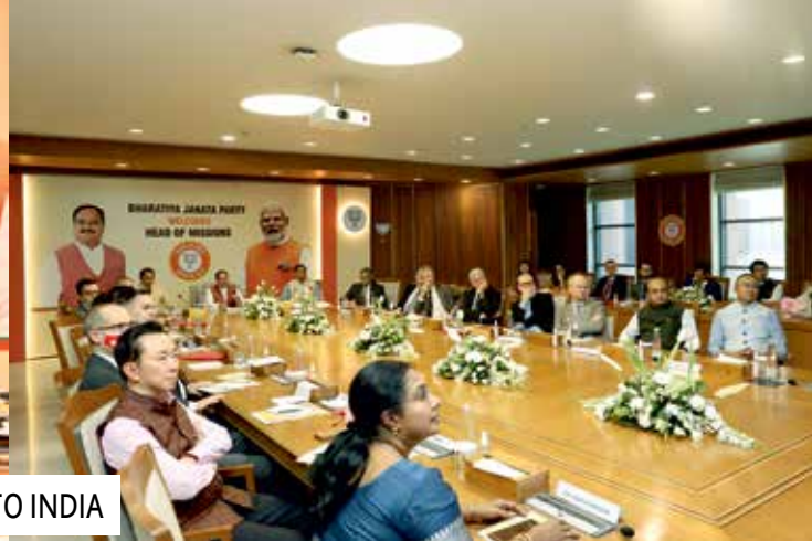
BJP PRESIDENT'S INTERACTION WITH HEAD OF MISSIONS TO INDIA