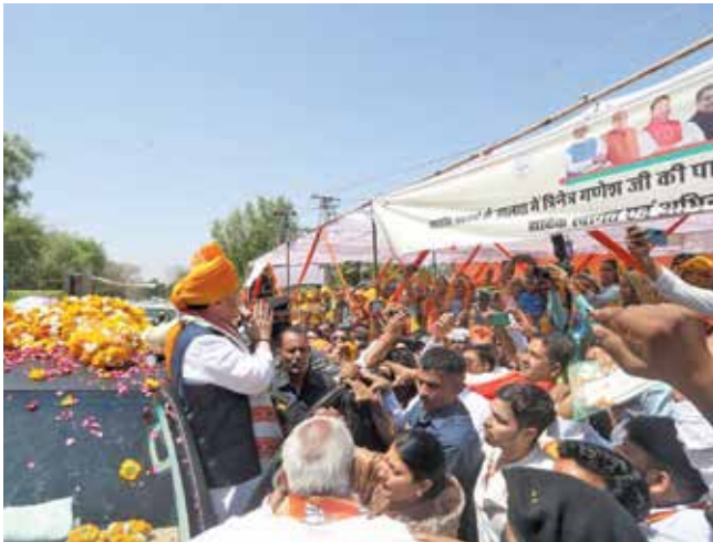
Warm welcome by Rajasthan BJP to Party National President Shri JP Nadda on his arrival at Sawai Madhopur