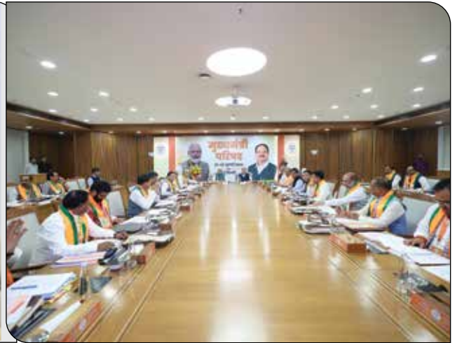
Glimpses of the Chief Minister's Council meeting in the esteemed presence of PM Shri Narendra Modi and BJP National President & Union Minister Shri JP Nadda with Chief Ministers and Deputy Chief Ministers of all BJP-ruled states at the BJP Headquarter in New Delhi on 27 July, 2024