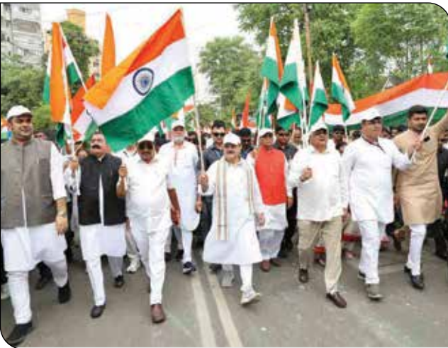
BJP National President Shri JP Nadda and other senior BJP leaders of Gujarat on the occasion of "Tiranga Yatra" in Rajkot, Gujarat on 10 August 2024