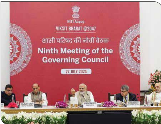
PM Shri Narendra Modi along with the senior colleagues of his cabinet addressing the 9th Governing Council Meeting of NITI Aayog in New Delhi on July 27, 2024