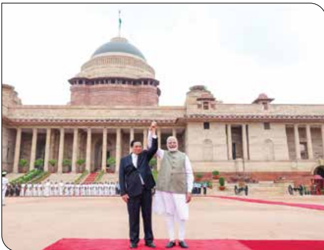
PM Shri Narendra Modi attends the Ceremonial Reception of the Prime Minister of the Socialist Republic of Vietnam, Mr. Pham Minh Chinh at Rashtrapati Bhavan, in New Delhi on August 01, 2024