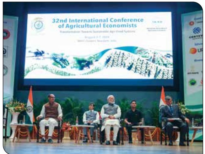
PM Shri Narendra Modi at the inauguration of the 32nd International Conference of Agricultural Economists at National Agricultural Science Centre in New Delhi on August 03, 2024