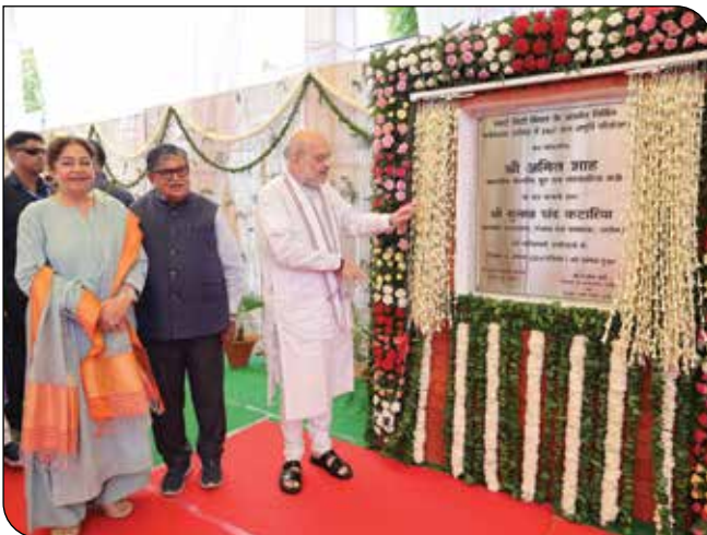
Union Home and Cooperative Minister Shri Amit Shah inaugurating the 24x7 water supply project under the 'Smart City Mission' in Chandigarh on 04 August 2024