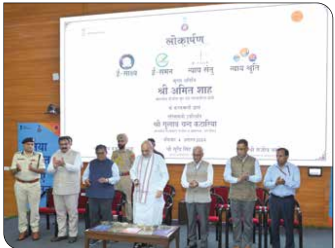
Union Home and Cooperative Minister Shri Amit Shah inaugurating the 'e-sakshya' and 'Nyaya Setu'; cutting-edge technologies to power our criminal justice system in Chandigarh on 04 August 2024