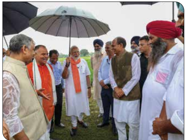
PM Shri Narendra Modi interacts with the farmers and scientists at the Agricultural Research Institute in New Delhi on August 11, 2024