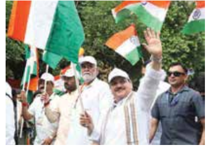
'TIRANGA YATRA IS TO AWAKEN THE SPIRIT OF PATRIOTISM AMONG THE CITIZENS'