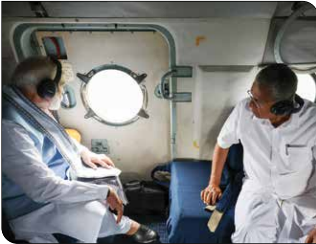
PM Shri Narendra Modi conducts aerial survey of landslide affected areas at Wayanad in Kerala on August 10, 2024