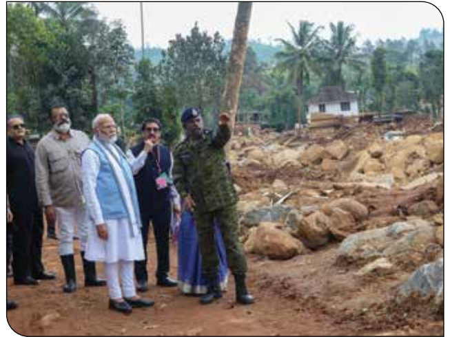
PM Shri Narendra Modi visits the landslide affected areas at Kalpetta, Wayanad in Kerala on August 10, 2024