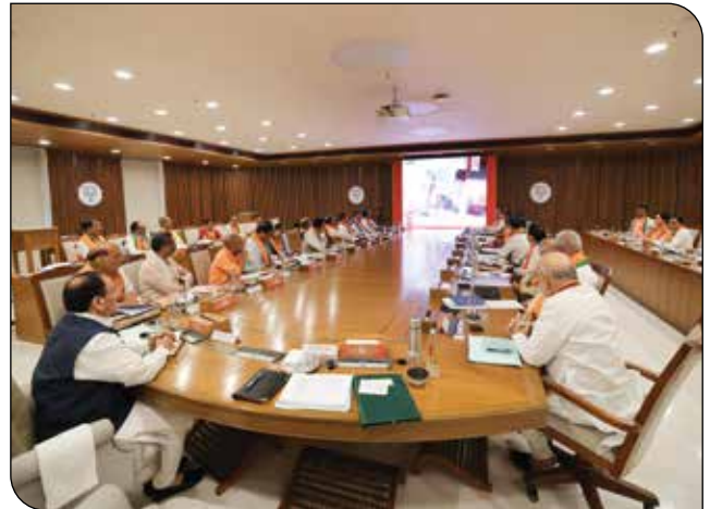
BJP National President & Union Minister Shri JP Nadda listening to 112th episode of Prime Minister Shri Narendra Modi's "Mann ki Baat" with party's senior leaders & BJP Chief Ministers & Deputy Chief Ministers at BJP HQ, New Delhi on 28 July 2024