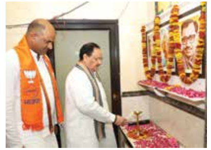
'BJP WILL SWEEP RAJASTHAN ASSEMBLY ELECTION'