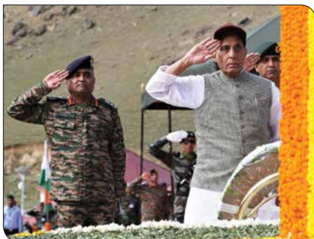
Union Minister Shri Rajnath Singh paying tributes to India's bravehearts on 'Kargil Vijay Diwas' at Kargil War Memorial in Dras on 26 July, 2023