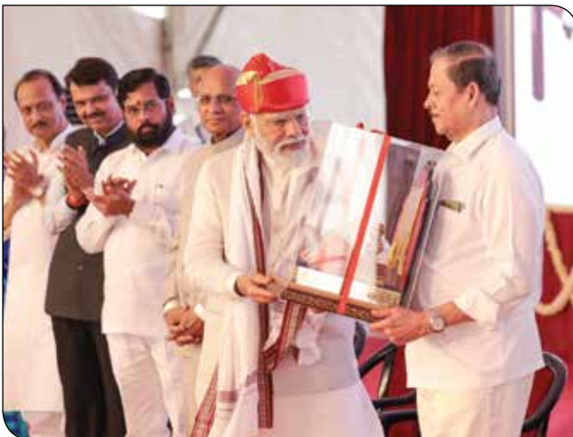
PM Shri Narendra Modi conferred with the Lokmanya Tilak National Award at Pune in Maharashtra on August 01, 2023.