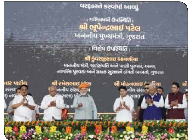
PM Shri Narendra Modi inaugurates multiple development projects at Rajkot in Gujarat on July 27, 2023.