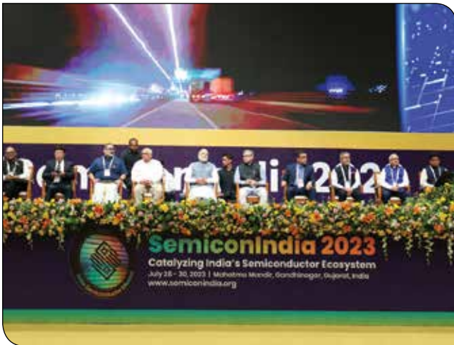
PM Shri Narendra Modi attends the inauguration of Semicon India 2023 at Gandhinagar in Gujarat on July 28, 2023.