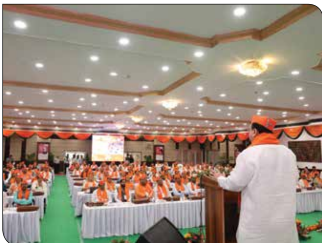
BJP National President Shri JP Nadda addressing the participants in the inaugural session of 'Regional Panchayati Raj Council' held at Surajkund, Haryana on 7 August, 2023