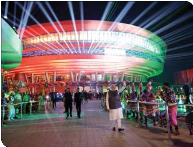
PM Shri Narendra Modi attends the inauguration of International Exhibition-cum-Convention Centre (IECC) Complex 'Bharat Mandapam' at Pragati Maidan, New Delhi on July 26, 2023.