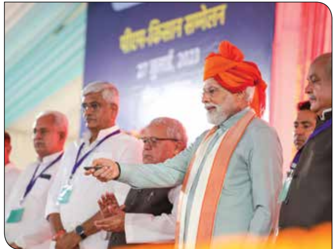
PM Shri Narendra Modi lays foundation stone and dedicates to nation various development projects at Sikar in Rajasthan on July 27, 2023.