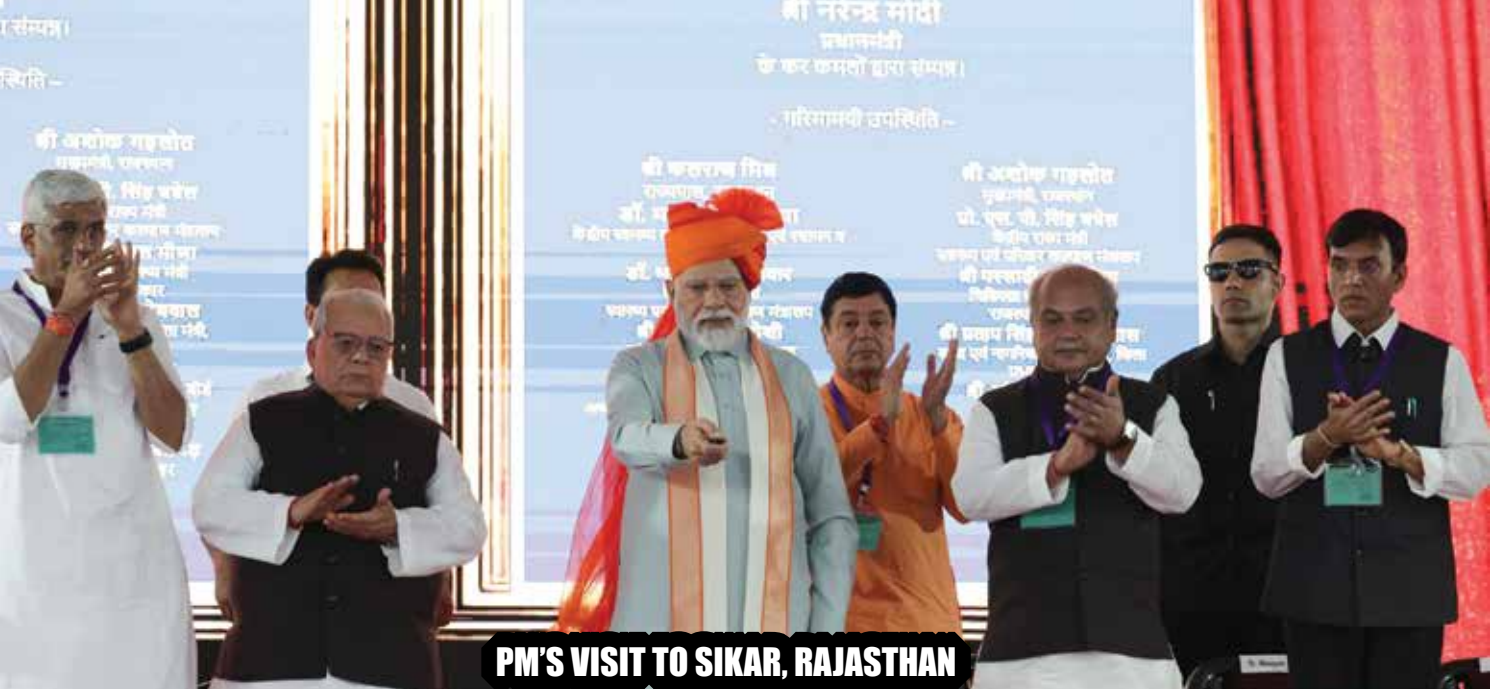
PM'S VISIT TO SIKAR, RAJASTHAN