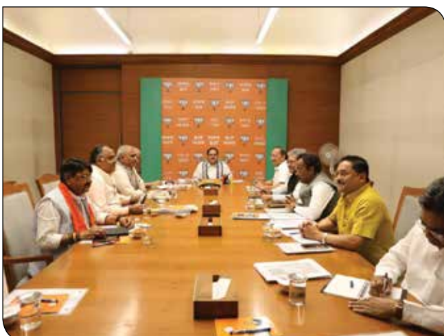
BJP National President Shri JP Nadda chairs the BJP National General Secretaries Meeting at BJP HQ, New Delhi on 28 July, 2023