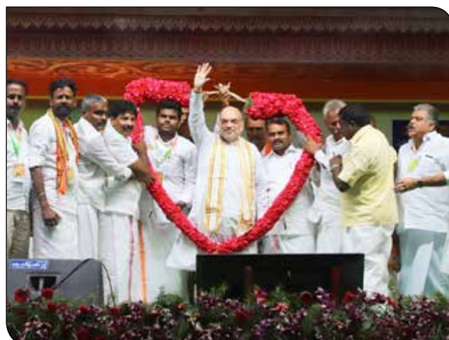
Tamil Nadu BJP welcomes Union Home & Cooperation Minister Shri Amit Shah during the inauguration of "En Mann En Makkal" Yatra in Ramanathapuram on 28 July, 2023