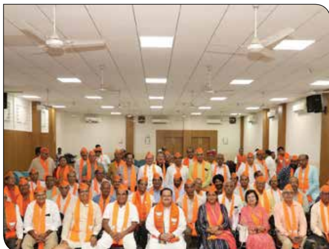
BJP National President Shri JP Nadda interacting with State Senior Karyakartas in Jaipur, Rajasthan on 29 July, 2023