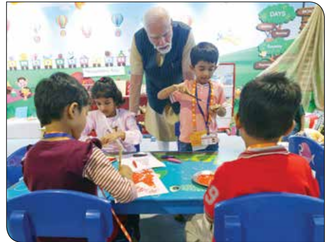
PM Shri Narendra Modi interacting with children at Akhil Bhartiya Shiksha Samagam, Bharat Mandapam in New Delhi on July 29, 2023.