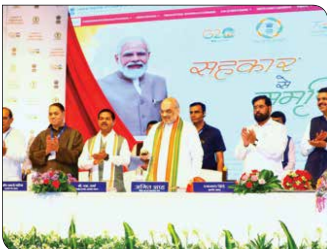
Union Home & Cooperation Minister Shri Amit Shah launching the digital portal to simplify the operations of cooperative societies in Pune on 6 August, 2023