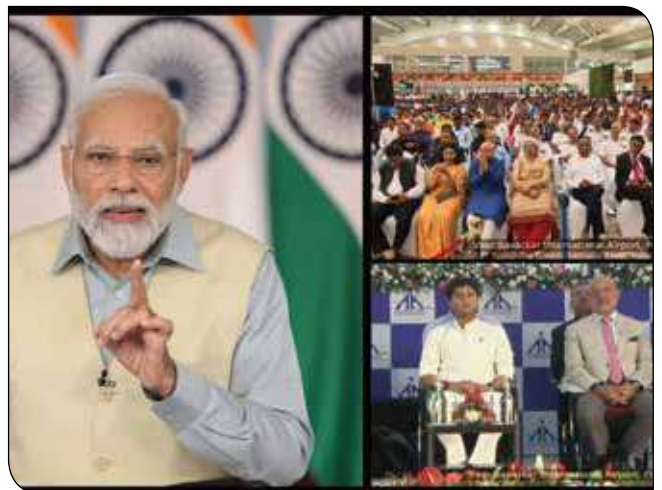
PM Shri Narendra Modi addressing the inauguration of new Integrated Terminal Building of Veer Savarkar International Airport in Port Blair on July 18, 2023.