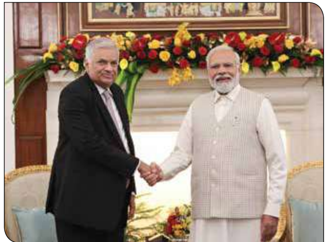
PM Shri Narendra Modi meets with the President of Sri Lanka, Sri Ranil Wickremesinghe in New Delhi on July 21, 2023