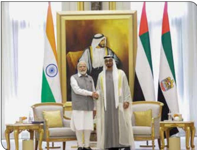
PM Shri Narendra Modi meets with the President of the United Arab Emirates, Sheikh Mohamed bin Zayed Al Nahyan at Qasr Al-Watan (Presidential Palace) in Abu Dhabi, UAE on July 15, 2023