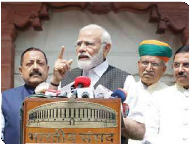
PM Shri Narendra Modi briefing the media ahead of the start of Monsoon Session 2023 of Parliament in New Delhi on July 20, 2023