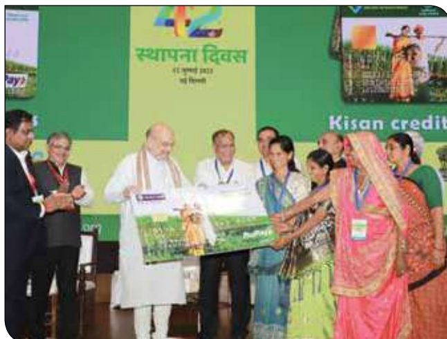
Union Home and Cooperation Minister Shri Amit Shah distributing micro ATMs and 'RuPay Kisan Credit Card' at the 42nd Foundation Day of NABARD in New Delhi on 19 July, 2023