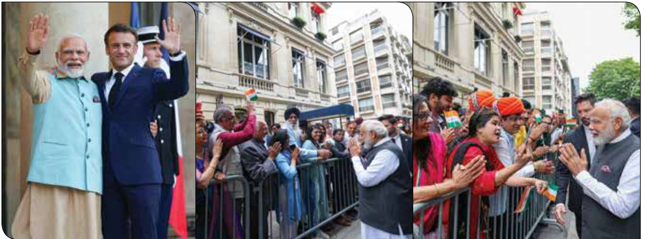
PM Shri Narendra Modi being welcomed by the President of France, Mr. Emmanuel Macron and the Indian community in Paris, France on July 13, 2023