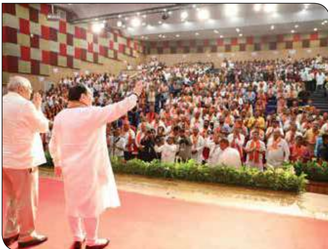
BJP National President Shri JP Nadda along with Gujarat CM Shri Bhupendra Patel receiving the greetings at 'Karyakarta Samwad' programme in Vadodara, Gujarat on 10 July, 2023