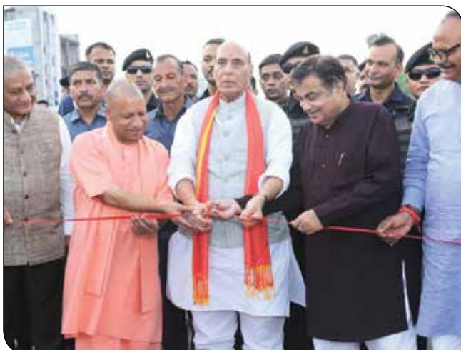
Union Ministers Shri Rajnath Singh, Shri Nitin Gadkari and UP CM Shri Yogi Adityanath inaugurating various development projects in Lucknow, UP on 17 July, 2023