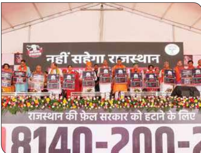
BJP National President Shri JP Nadda while launching 'Nahi Sahega Rajasthan' in Jaipur, Rajasthan on 16 July, 2023