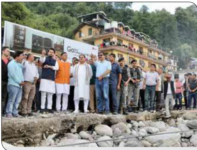
BJP National President Shri JP Nadda and other BJP leaders visiting the flood affected areas in Himachal Pradesh on 14 July, 2023