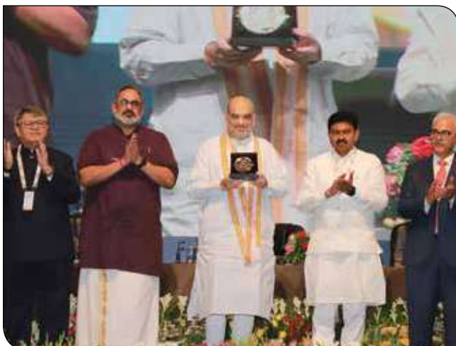
Union Home and Cooperation Minister Shri Amit Shah at the 'G20 Conference on Crime and Security in the Age of NFTs, AI & Metaverse' held in Gurugram on 13 July, 2023