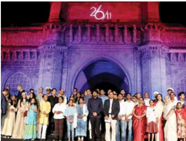
Union Ministers Shri Rajnath Singh & Shri Nitin Gadkari join the family members of martyrs of 26/11 terrorist attack to pay their tributes at Gateway of India in Mumbai