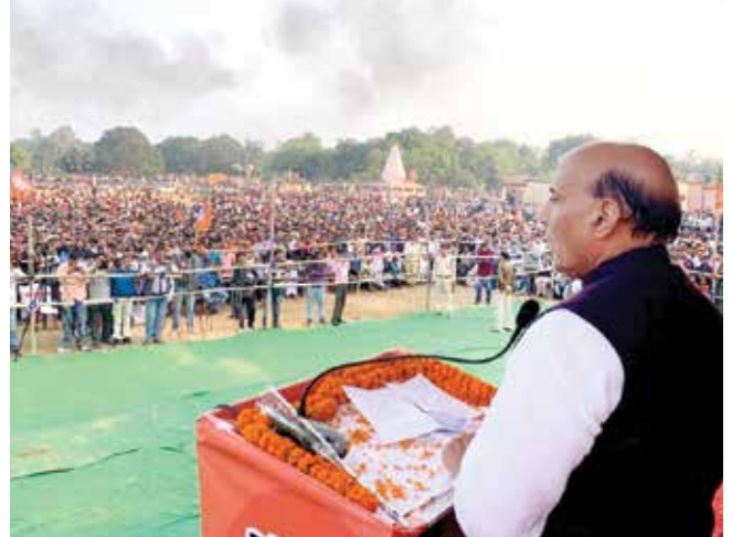
Union Minister Shri Rajnath Singh addressing a huge election rally in Madhupur, Jharkhand