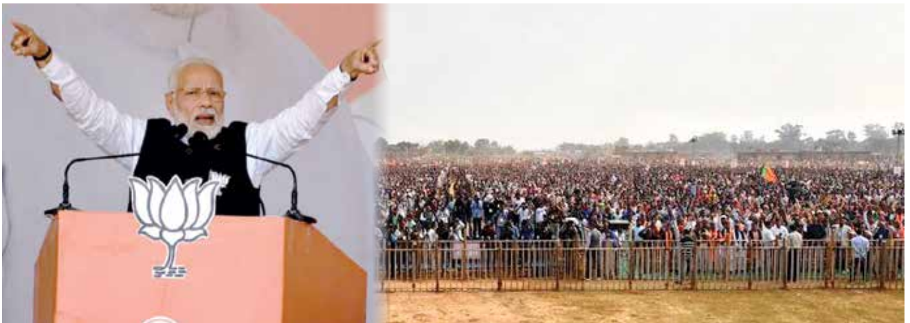
Prime Minister Shri Narendra Modi addressing a massive public rally in Bokaro, Jharkhand