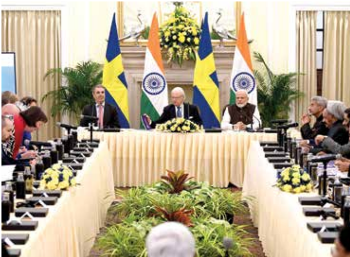
PM Shri Narendra Modi & his Majesty King Carl XVI Gustaf of Sweden participating in the India-Sweden High-Level Policy Dialogue on Innovation Policy in New Delhi