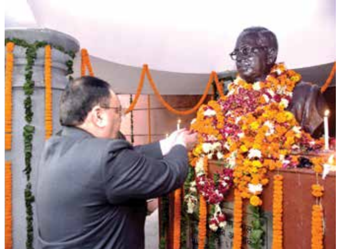
BJP National Working President Shri JP Nadda paying tributes to Babasaheb Bhimrao Ambedkar on his Mahaparinirvan Diwas at B.R. Ambedkar Memorial, Alipur, New Delhi