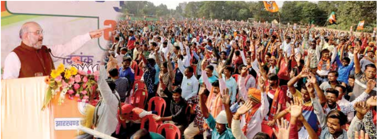
BJP National President & Union Minister Shri Amit Shah addressing a massive election rally in Garhwa, Jharkhand