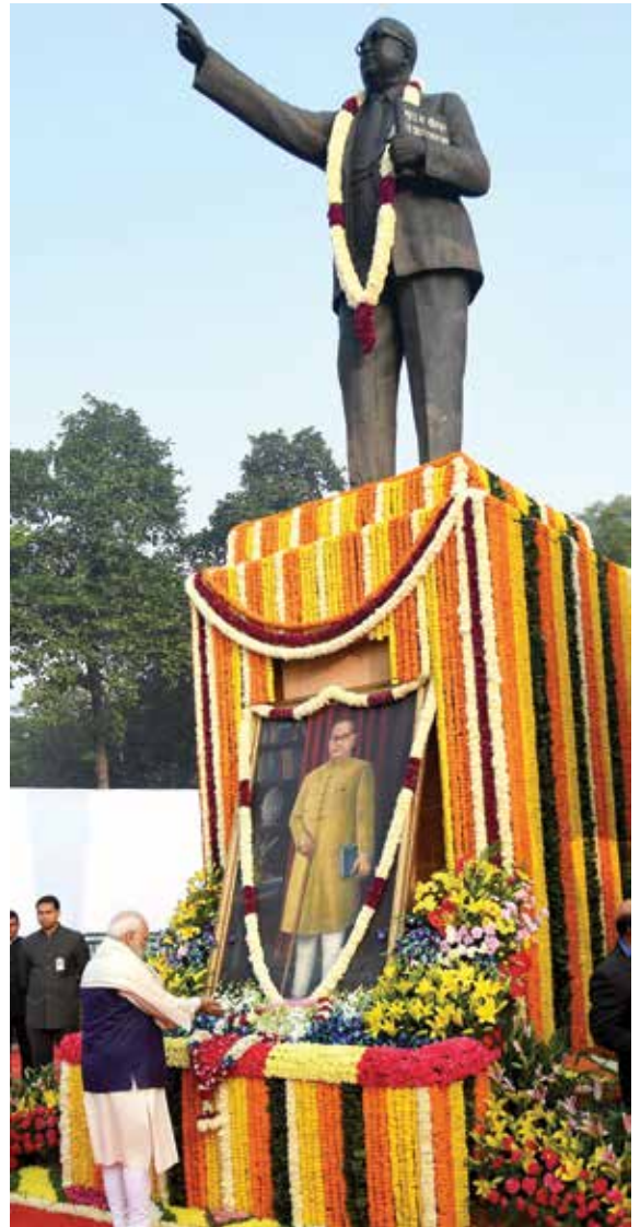
PM Shri Narendra Modi paying floral tributes to Babasaheb Dr. B.R. Ambedkar on his 64th Mahaparinirvan Diwas at Parliament House Complex, New Delhi