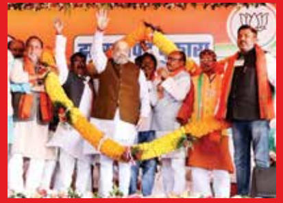
'VAJPAYEE GOVT. CREATED JHARKHAND, PM MODI TAKING IT FORWARD'