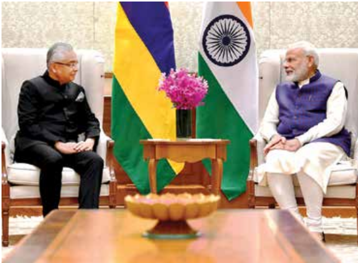
PM Shri Narendra Modi meets Mauritius PM Mr. P.K. Jugnauth in New Delhi