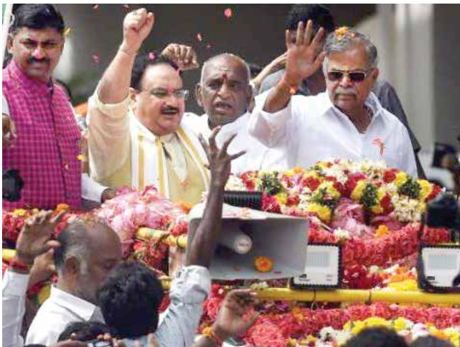
Tamilnadu BJP welcomes BJP National Working President Shri JP Nadda on his arrival in Chennai. BJP National General Secretary & Tamilnadu Prabhari Shri Muralidhar Rao also seen in the picture.