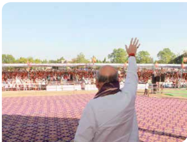
Union Home and Cooperation Minister Shri Amit Shah addressing a massive 'Vijay Sankalp Rally' in Gujarat on 20 November, 2022