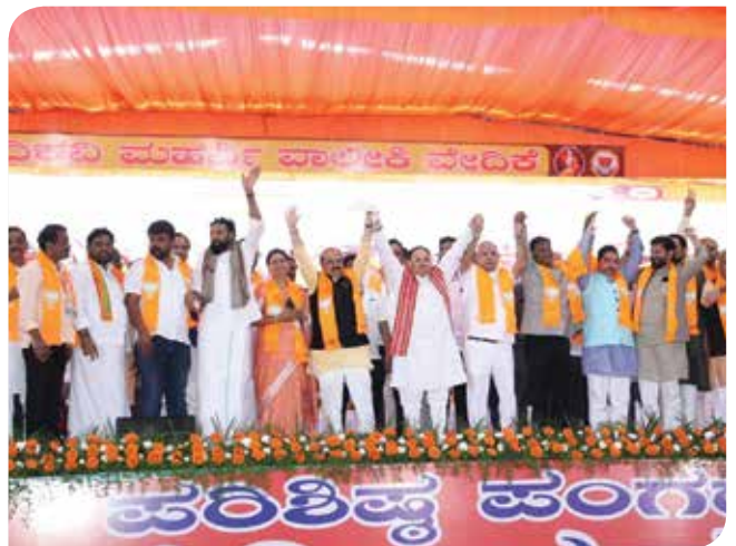
BJP National President Shri JP Nadda while addressing the "Navashakti Samavesh" in Bellary, Karnataka on 20 November, 2022