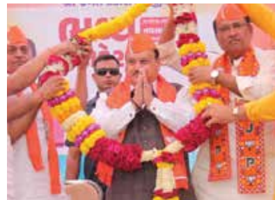
'BJP WILL BREAK ALL RECORDS IN GUJARAT AND FORM THE GOVERNMENT AGAIN'