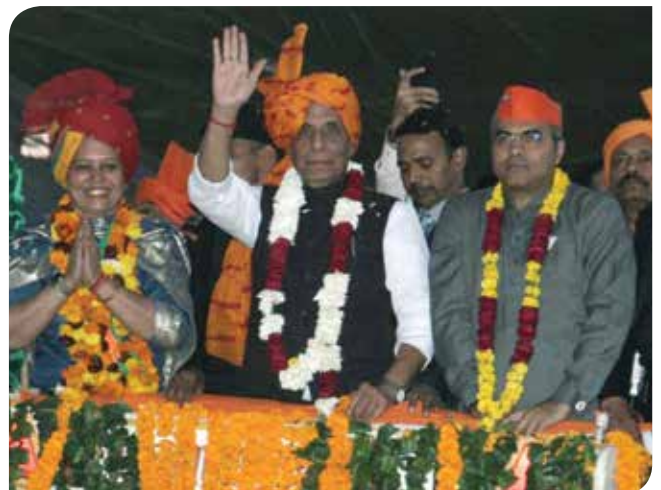
Defence Minister Shri Rajnath Singh in a 'Vijay Sankalp Roadshow' at Uttam Nagar in New Delhi on 20 November, 2022