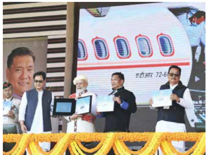
PM Shri Narendra Modi inaugurates first greenfield airport of Arunachal Pradesh 'Donyi Polo' in Itanagar on November 19, 2022