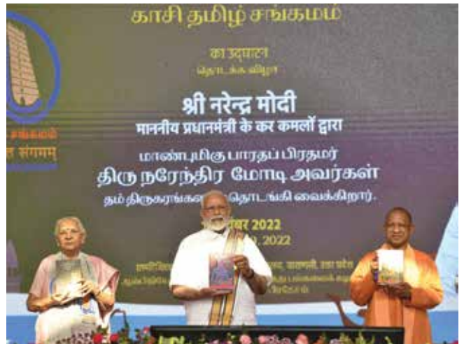
PM Shri Narendra Modi alongwith UP Governor Smt. Anandiben Patel, CM Yogi Adityanath inaugurating the Kashi-Tamil Sangamam, in Varanasi on November 19, 2022