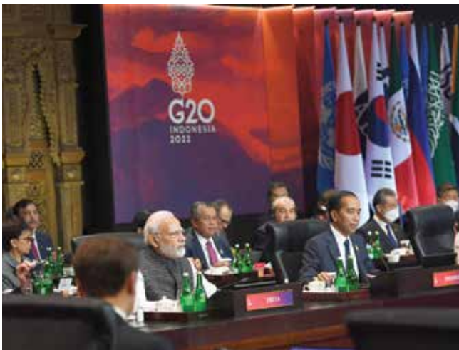
President of Indonesia, Mr. Joko Widodo symbolically handing over the G20 Presidency to PM Shri Narendra Modi at G20 summit, in Bali, Indonesia on November 16, 2022.