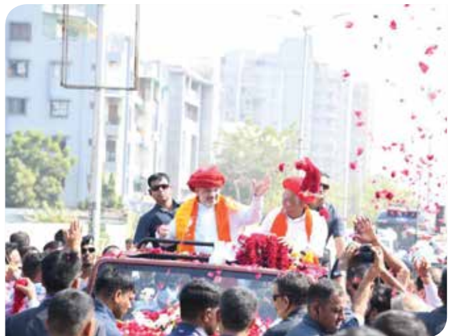
Massive Road show during filing of nomination of Gujarat CM Shri Bhupendrabhai Patel in presence of Union Home and Cooperation Minister Shri Amit Shah in Ahmedabad on 16 November, 2022