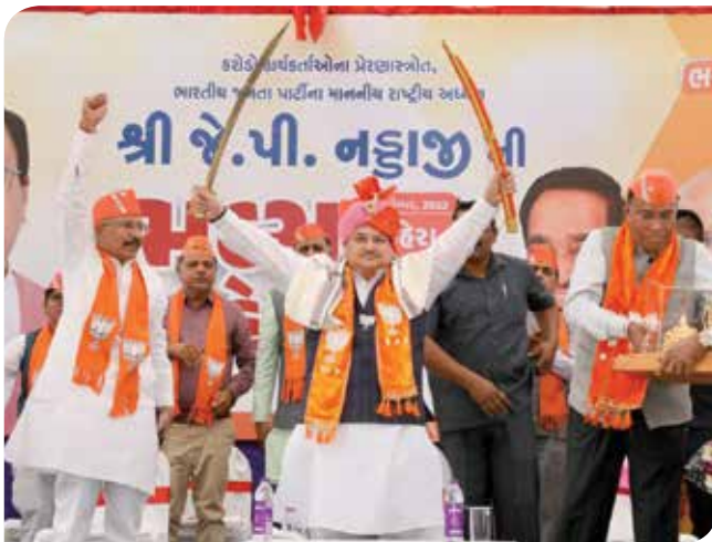
Gujarat BJP welcomes party National President Shri JP Nadda during a massive 'Vijay Sankalp Rally' at Shahera on 22 November, 2022