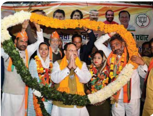
Delhi BJP welcomes party National President Shri JP Nadda after the completion of a road show in Delhi on 20 November, 2022