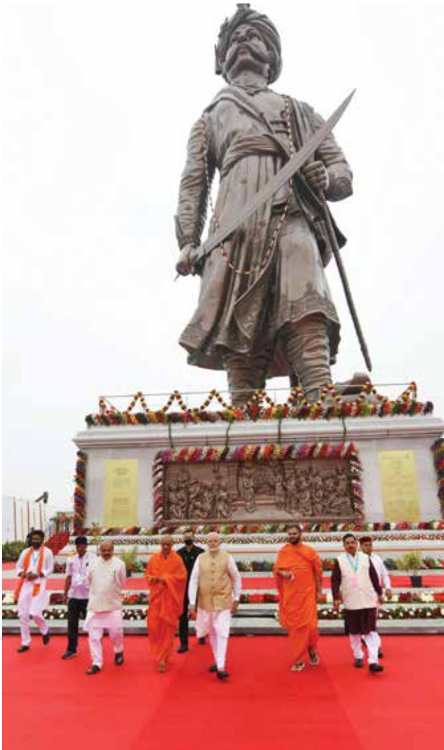
PM Shri Narendra Modi at the unveiling ceremony of the 108 ft bronze statue of Kempegowda in Bengaluru on November 11, 2022