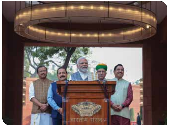
PM Shri Narendra Modi addressing the media before the start of winter session of parliament in New Delhi on December 04, 2023