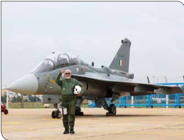
PM Shri Narendra Modi takes sortie on IAF multirole fighter jet Tejas on November 25, 2023