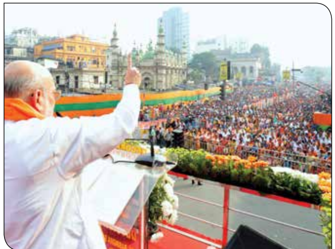
Union Home & Cooperation Minister Shri Amit Shah addressing a huge 'Pratiwad Sabha' at Dharmatala, Kolkata (West Bengal) on 29 November, 2023