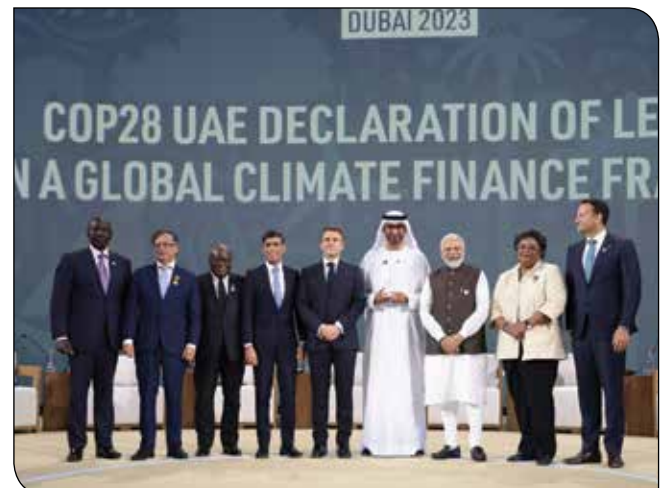
PM Shri Narendra Modi at COP 28 UAE Summit in Dubai on December 01, 2023