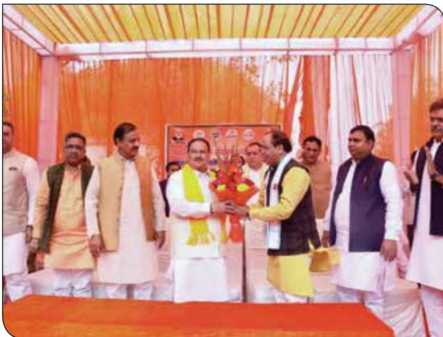
BJP National President Shri JP Nadda at Prime Minister Shri Narendra Modi's interaction with beneficiaries of 'Viksit Bharat Sankalp Yatra' on 30 November, 2023