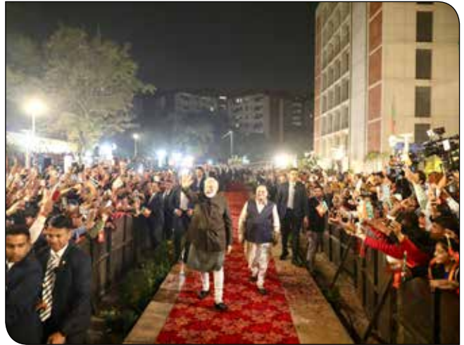
Jubilant BJP Karyakartas welcoming PM Shri Narendra Modi and BJP National President Shri JP Nadda to BJP HQ Ext. in New Delhi after splendid victory of BJP in Madhya Pradesh, Rajasthan & Chhattisgarh on 03 December, 2023