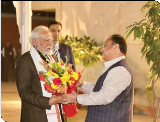
BJP National President Shri JP Nadda welcoming PM Shri Narendra Modi at the Abhinandan Samaroh at BJP HQ Ext. in New Delhi on 03 December, 2023 after splendid victory of BJP in Madhya Pradesh, Rajasthan & Chhattisgarh