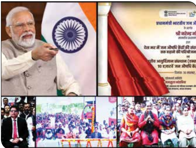
PM Shri Narendra Modi dedicates landmark 10,000th Jan Aushadi Kendra at AIIMS Deoghar on November 30, 2023