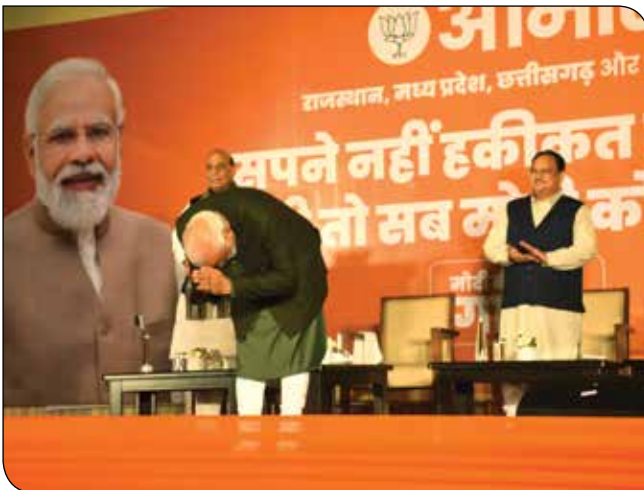
PM Shri Narendra Modi receiving the greetings of BJP Karyakartas at the Abhinandan Samaroh at BJP HQ Ext., New Delhi on 03 December, 2023 after splendid victory in Madhya Pradesh, Rajasthan & Chhattisgarh