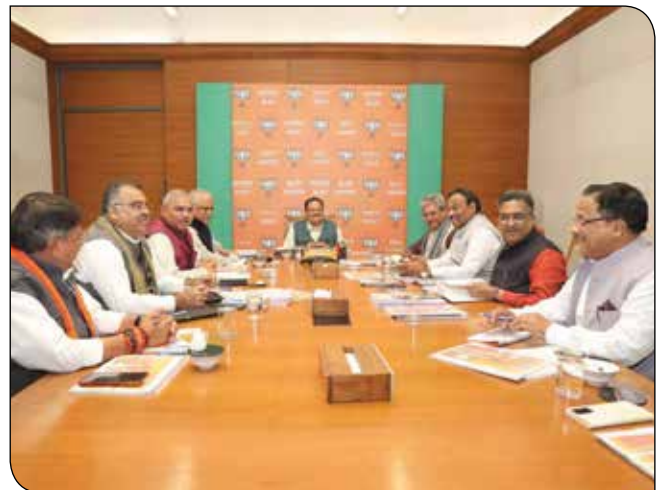
BJP National President Shri JP Nadda presiding over BJP National General Secretaries Meeting at BJP HQ in New Delhi on 06 December, 2023