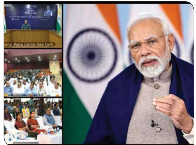
PM Shri Narendra Modi addressing at the National Rozgar Mela on November 30, 2023