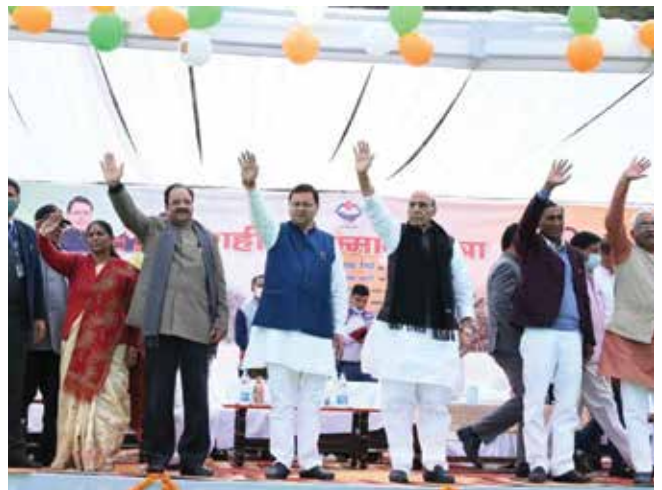
Union Minister Shri Rajnath Singh along with Uttarakhand CM Shri Pushkar Singh Dhama inaugurating the 'Sainik Samman Yatra' in Munakot, Uttarakhand