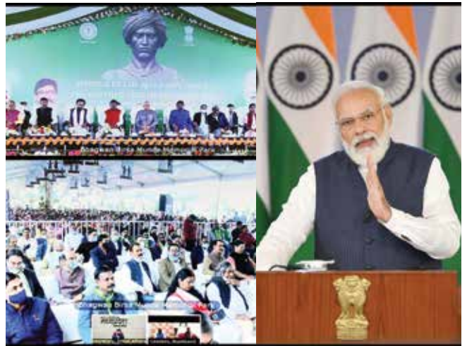
PM Shri Narendra Modi addressing at the inauguration of the Bhagwan Birsa Munda Memorial Udyan cum Freedom Fighter Museum at Ranchi, Jharkhand