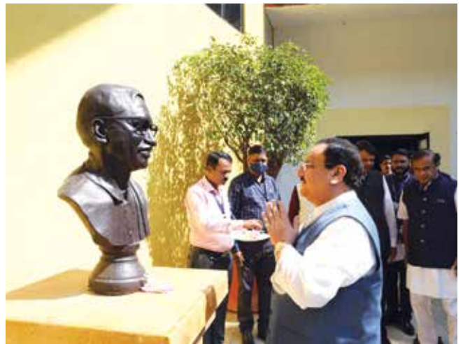
BJP National President Shri Jagat Prakash Nadda visiting Pandit Deendayal Upadhyay Museum at Rambhau Mhalgi Prabodhini, Mumbai