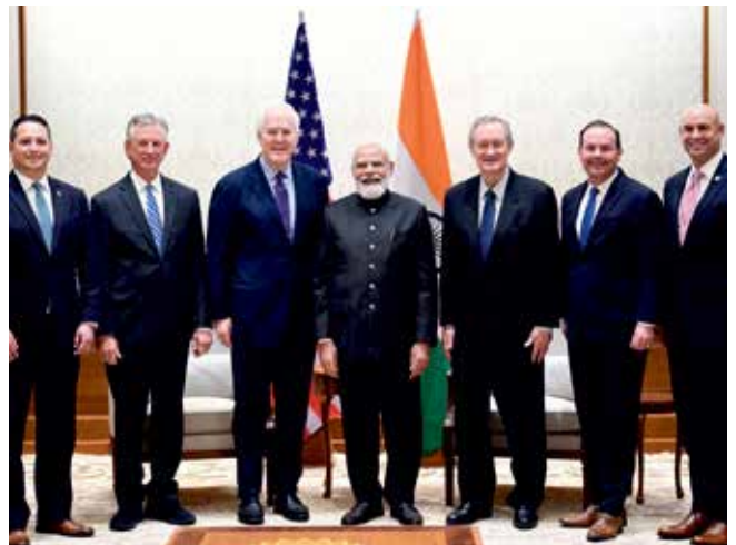
US Congressional delegation led by Senator @JohnCoryn meeting PM Shri Narendra Modi in New Delhi