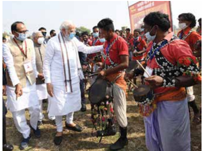
PM Shri Narendra Modi visiting an exhibition on the occasion of 'Janjatiya Gaurav Divas' Maha Sammela in Bhopal, Madhya Pradesh