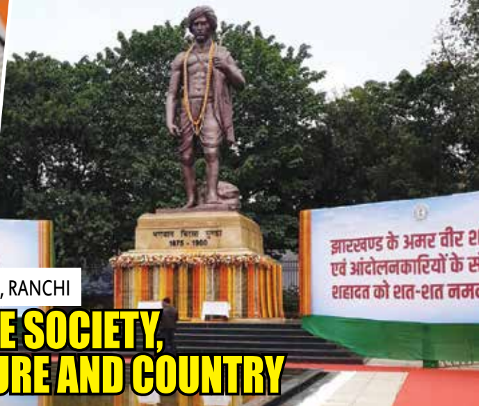
PM INAUGURATES BIRSA MUNDA MEMORIAL PARK & MUSEUM, RANCHI