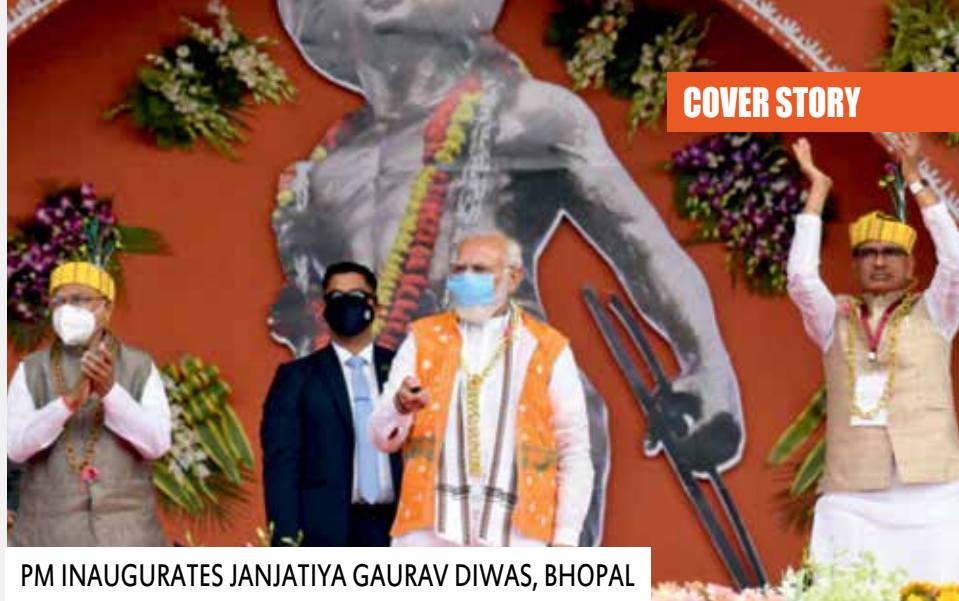
PM INAUGURATES JANJATIYA GAURAV DIWAS, BHOPAL

Recognizing the tribal culture and language of tribal students,