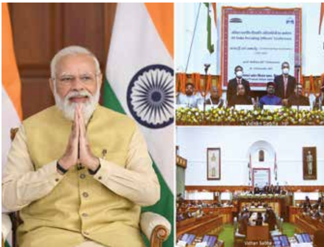
PM Shri Narendra Modi at the inaugural session of 82nd All India Presiding Officers' Conference in New Delhi