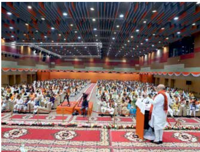
Union Home & Cooperation Minister Shri Amit Shah addressing a meeting of BJP Vidhansabha Prabharis of Uttar Pradesh in Varanasi