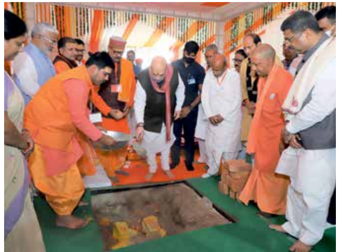
Union Home & Cooperation Minister Shri Amit Shah lays the foundation stone of State University in Azamgarh (Uttar Pradesh)