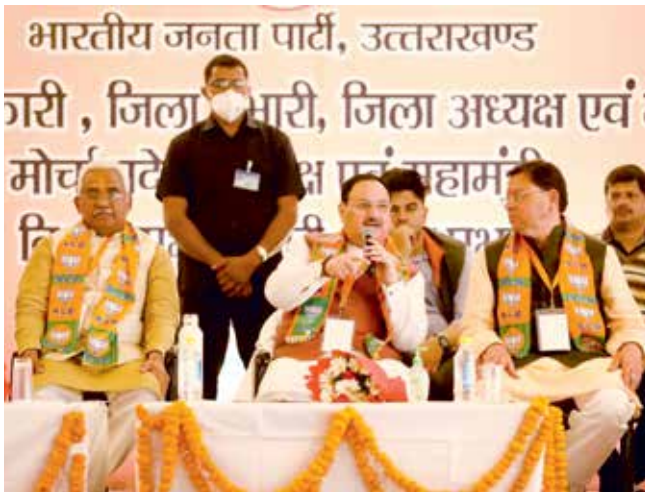
BJP National President Shri JP Nadda addressing a state organisation meeting in Rudrapur, Uttarakhand