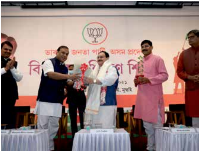
BJP National President Shri JP Nadda along with Assam CM Shri Himanta Biswa Sarma and other senior leaders inaugurating the Training session of BJP Assam MLAs in Mumbai