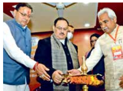
'WHERE THERE IS BJP THERE IS A MISSION'