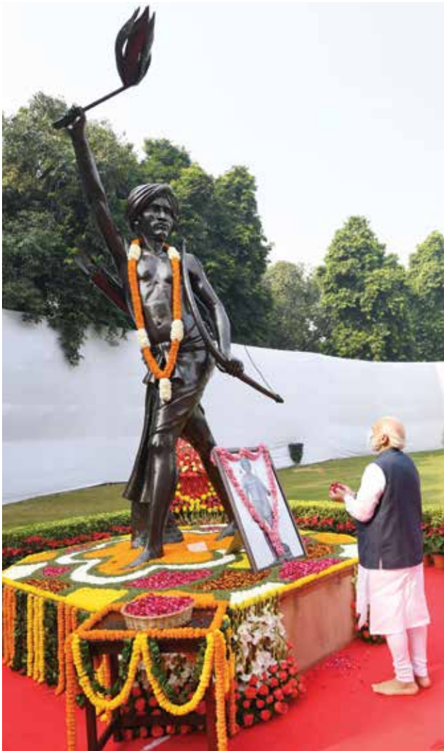
Prime Minister Shri Narendra Modi paying floral tributes at Birsa Munda Statue, on the occasion of 'Janjatiya Gaurav Divas', at Parliament House in New Delhi