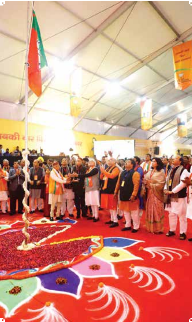
PM Shri Narendra Modi flanked by BJP National President Shri Amit Shah and other senior leaders of the party hoisting the BJP flag before the commencement of BJP National Convention