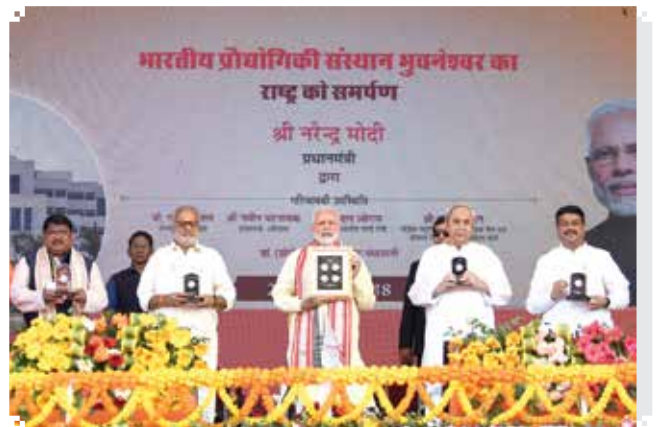
PM Shri Narendra Modi flanked by Odisha CM and other BJP leaders inaugurating the IIT Bhubaneswar campus and releasing a coin on the Paika Rebellion in Bhubaneswar, Odisha