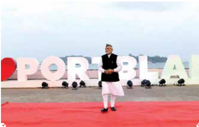
Prime Minister Shri Narendra Modi at the Marina Park at Port Blair in Andaman and Nicobar Islands