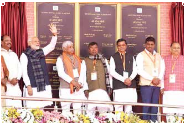
PM Shri Narendra Modi along with other leaders of Jharkhand inaugurates and lays foundation stone of several development projects in Palamu, Jharkhand