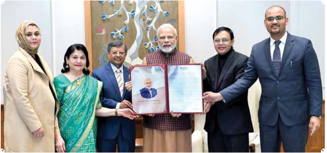
Prime Minister Shri Narendra Modi receiving the first-ever 'PHILIP KOTLER PRESIDENTIAL' award in New Delhi from the Professors of EMORY University, Georgia, USA