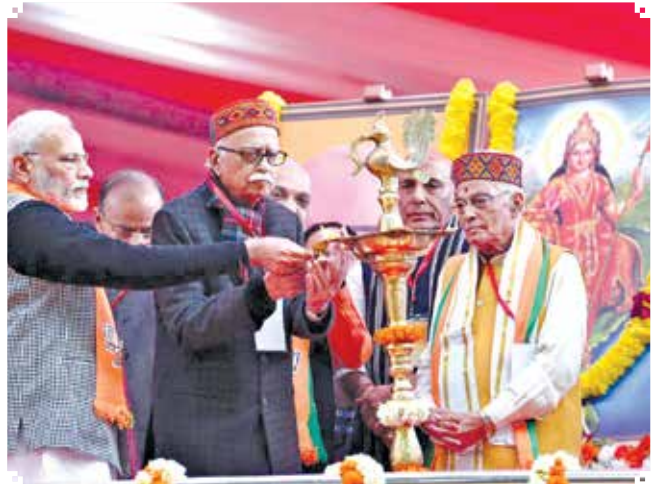
PM Shri Narendra Modi along with BJP National President Shri Amit Shah, Senior leaders Shri L.K. Advani and Dr. Murlu Manohar Joshi and Union Minister Shri Rajnath Singh lighting the lamp to inaugurate the BJP National Convention in New Delhi