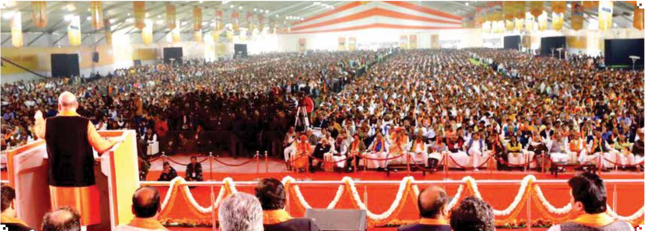
BJP National President Shri Amit Shah addressing the huge gathering of BJP karyakartas at the inaugural session of party National Convention