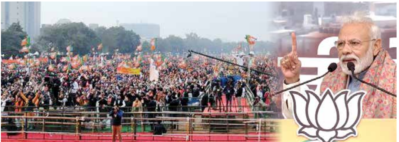
PM Shri Narendra Modi addressing a mega rally at Ramlila Maidan, New Delhi