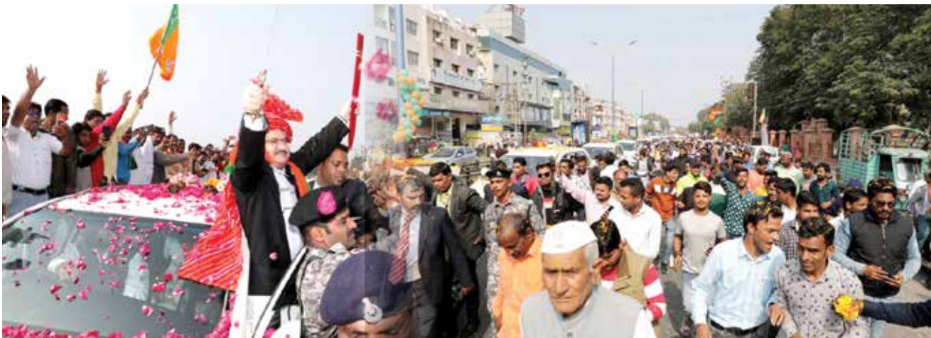
Madhya Pradesh BJP along with refugees from Pakistan welcomes BJP National Working President Shri JP Nadda on his arrival at Indore to participate at the Thanks Giving meeting for enacting CAA