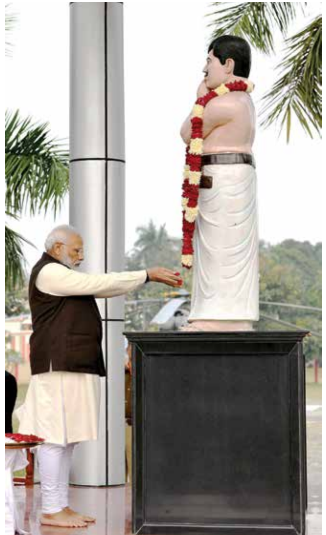
PM Shri Narendra Modi paying floral tributes to the freedom fighter Chandra Shekhar Azad in Kanpur, UP