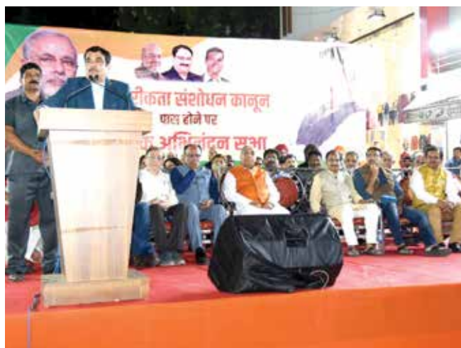
Union Minister Shri Nitin Gadkari addressing a thanks giving meeting for passing the CAA in Nagpur, Maharashtra