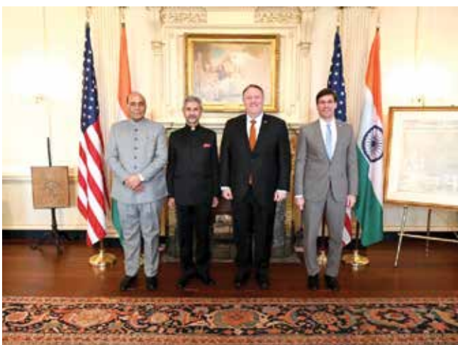
Union Defence Minister Shri Rajnath Singh & Foreign Affairs Minister S. Jaishankar at the '2 Plus 2 Dialogue' between India and the United States in Washington