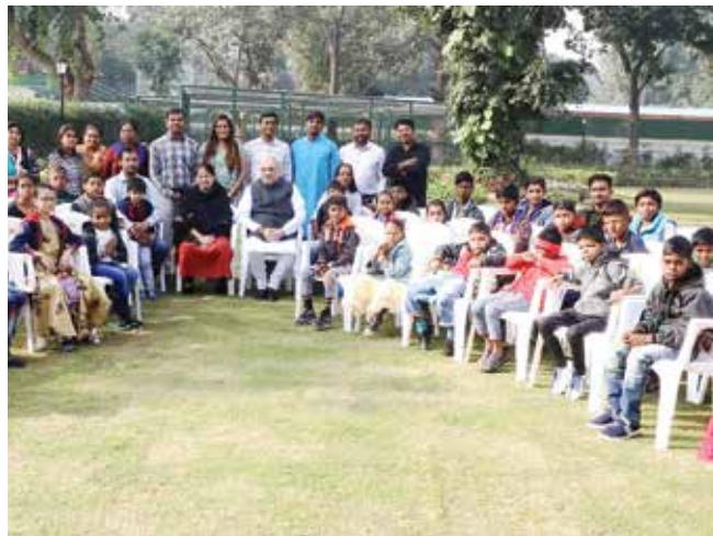
BJP National President & Union Home Minister Shri Amit Shah meets the special children studying under Samagra Siksha Abhiyan at his residence, New Delhi