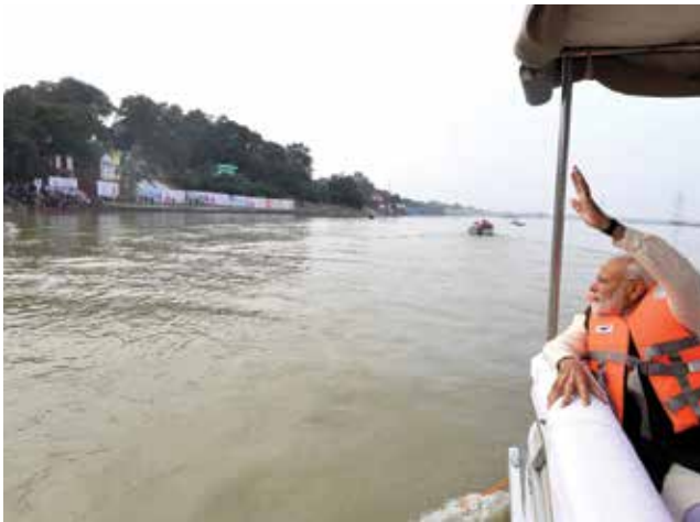
PM Shri Narendra Modi waving at the gathering during a boat ride on the river Ganga after completing the first meeting of National Ganga Council in Kanpur, UP