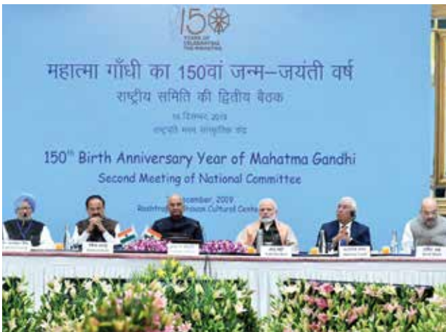
PM Shri Narendra Modi flanked by Hon'ble President Shri Ram Nath Kovind, VP Shri M. Venkaiah Naidu, BJP National President & Home Minister Shri Amit Shah and others attending the second meeting of the National Committee for Commemoration of 150th Birth Anniversary of Mahatma Gandhi, New Delhi