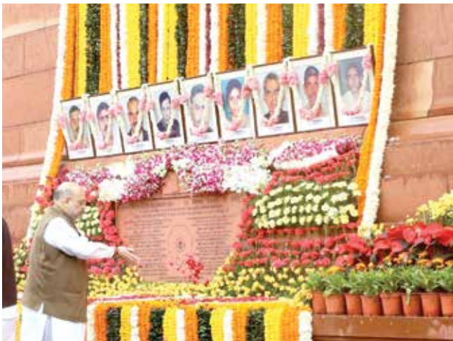
BJP National President & Union Home Minister Shri Amit Shah paying tributes to the martyrs of parliament attack in New Delhi