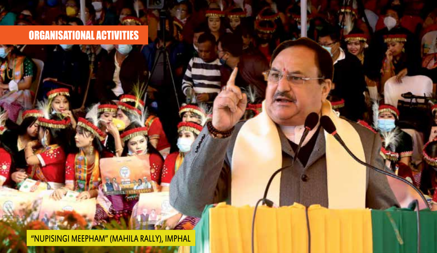
“NUPISINGI MEEPHAM” (MAHILA RALLY), IMPHAL