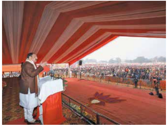
BJP National President Shri JP Nadda addressing Jan-Vishwas Yatra rally in Basti (Uttar Pradesh)