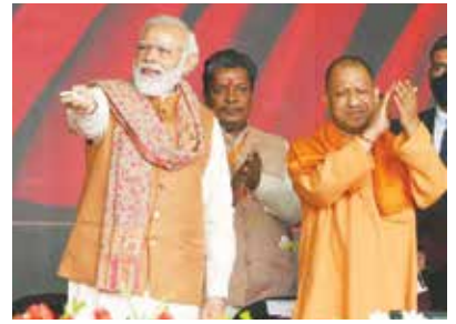
PM LAYS FOUNDATION STONE OF MAJOR DHYAN CHAND SPORTS...