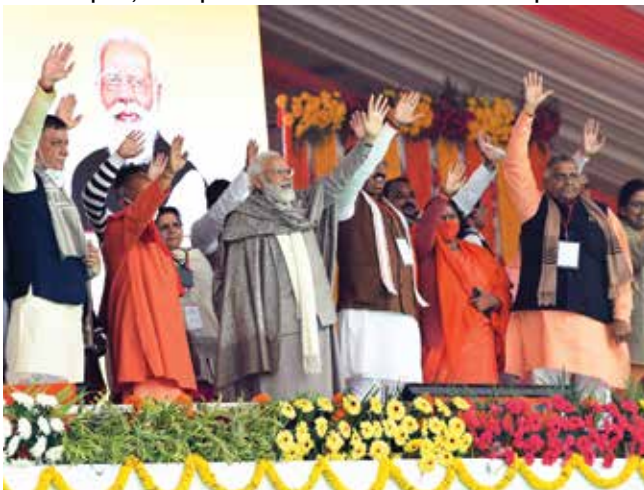
Prime Minister Shri Narendra Modi at the inauguration of the various developmental projects, in Kanpur, Uttar Pradesh