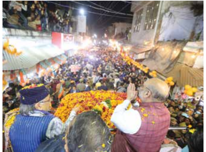
Road show of Union Home & Cooperation Minister Shri Amit Shah in Bareilly (Uttar Pradesh)