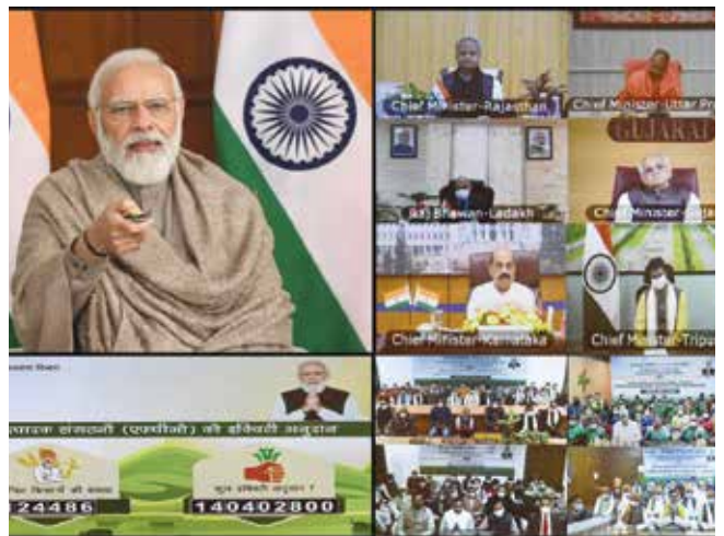
Prime Minister Shri Narendra Modi releases 10th instalment under PM Kisan Samman Nidhi (PM-KISAN) scheme in New Delhi