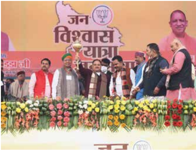
BJP National President Shri JP Nadda addressing Jan Vishwas Yatra rally at Islamia Inter College Ground, Budaun UP