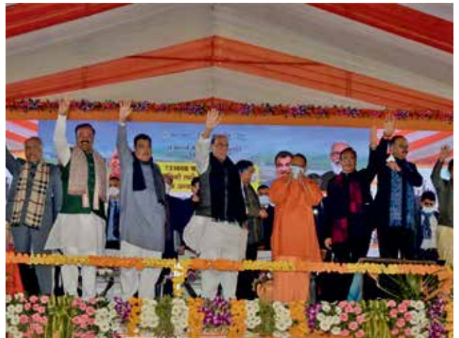
Union Ministers Shri Rajnath Singh, Shri Nitin Gadkari along with UP CM Yogi Aadiyanath and others inaugurating several important infra projects in Lucknow