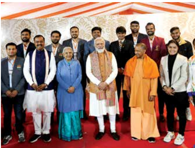
PM Shri Narendra Modi and other leaders are with the sport persons, in Meerut, Uttar Pradesh