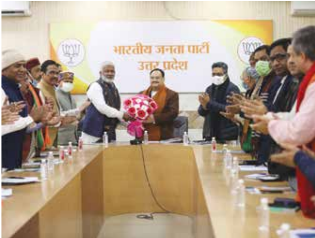
BJP National President Shri JP Nadda at a meeting with BJP UP State Office Bearers at State BJP Office, Lucknow, UP