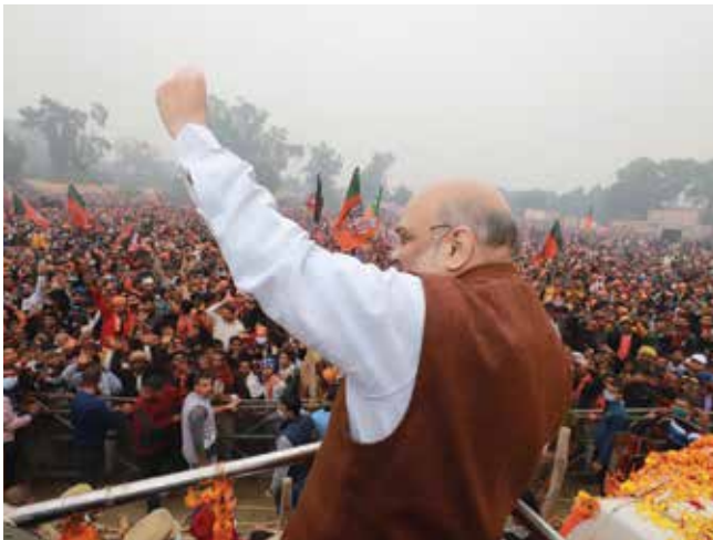
Union Home Minister & Minister for Cooperation Shri Amit Shah addressing a public meeting in Hardoi, UP