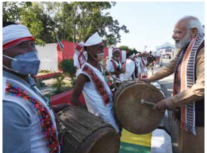
Prime Minister Shri Narendra Modi receives traditional welcome during his visit to Manipur