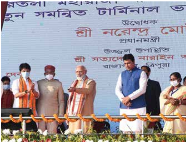
PM Shri Narendra Modi at a Public function in Agartala, Tripura, The Governor of Tripura, Shri Satyadeo Narain Arya, the Union Minister for Civil Aviation, Shri Jyotiraditya M. Scindia and the Chief Minister of Tripura, Shri Biplab Kumar Deb are also seen in the picture.