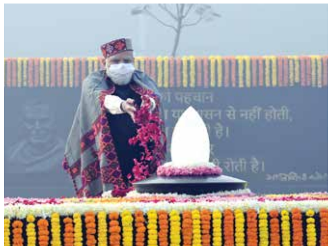
Prime Minister Shri Narendra Modi paying floral tributes to the former Prime Minister Shri Atal Bihari Vajpayee on his birth anniversary, at Sadaiv Atal, in Delhi