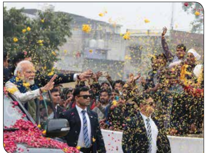
PM Shri Narendra Modi receives warm welcome by people during his arrival at Ayodhya in Uttar Pradesh on December 30, 2023