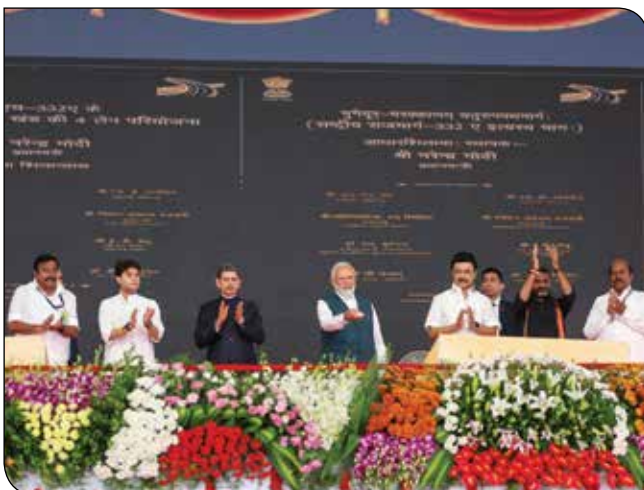
PM Shri Narendra Modi lays foundation stone and dedicates to nation various projects at Tiruchirappalli in Tamil Nadu on January 02, 2024