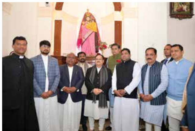
BJP National President Shri JP Nadda visited the Sacred Heart Cathedral Catholic Church in Delhi on the occasion of Christmas

The Prime Minister said, "The nation proudly acknowledges the contribution of the Christian Community". Prime Minister Shri Modi praised the contributions of the Christian Community to the freedom movement and highlighted the various intellectual thinkers and leaders. Prominent persons from the Christian community from across the country participated in the interaction. ■