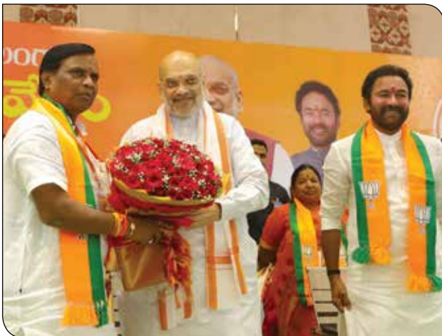
Union Home and Cooperation Minister Shri Amit Shah at the Telengana State BJP Mandal Presidents meeting in Ranga Reddy, Hyderabad on 28 December, 2023