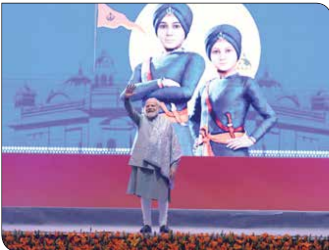
PM Shri Narendra Modi graced the programme marking 'Veer Baal Diwas' at Bharat Mandapam in New Delhi on December 26, 2023