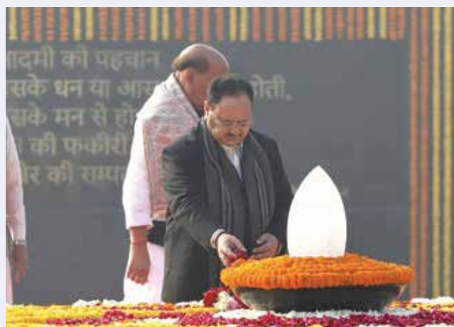
PM Shri Narendra Modi and BJP National President Shri JP Nadda paying floral tributes on the Birth Anniversary of Former Prime Minister Bharat Ratna Shri Atal Bihari Vajpayee ji at 'Sadaiv Atal' in New Delhi on 25 December, 2023