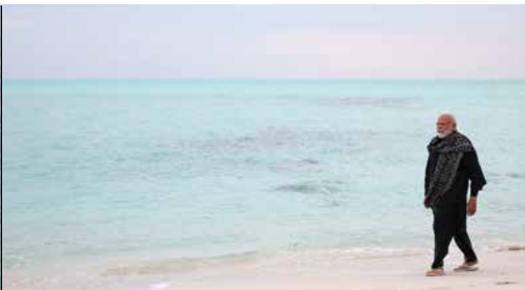
Prime Minister Narendra Modi enjoyed the beautiful beaches at Bangaram, in Lakshadweep on January 03, 2024