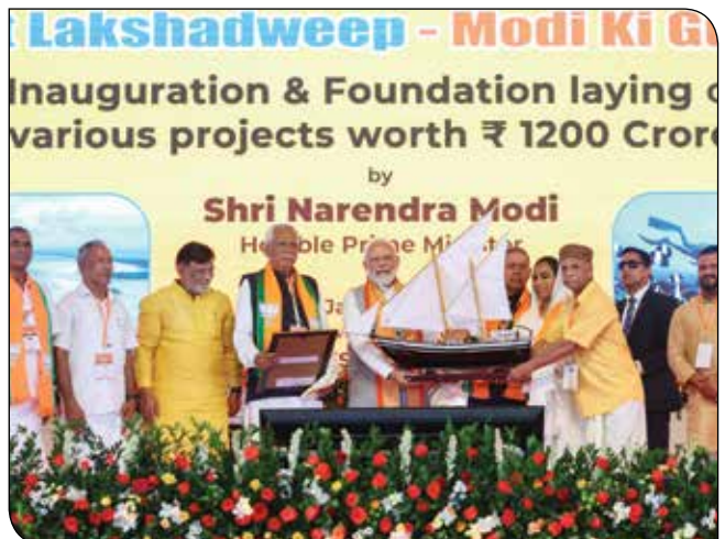
PM Shri Narendra Modi laying foundation stone of various projects at Kavaratti, in Lakshadweep on January 03, 2024