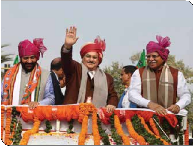
BJP National President Shri JP Nadda along with Haryana CM Shri Manohar Lal Khattar & others at a grand Road show in Panchkula, Haryana on 06 January, 2024