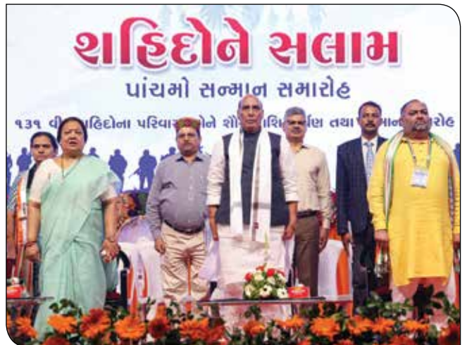
Defence Minister Shri Rajnath Singh attending an event organised to support the families of India's braveheart Jawans in Surat, Gujarat on 30 December, 2023