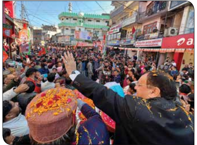
Himachal BJP welcoming BJP National President Shri JP Nadda with a massive Road show in Solan on 05 January, 2024