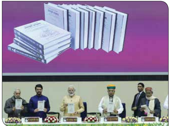
PM Shri Narendra Modi releases the Collected Works of Pandit Madan Mohan Malaviya on his 162nd Birth Anniversary at Vigyan bhawan in New Delhi on December 25, 2023