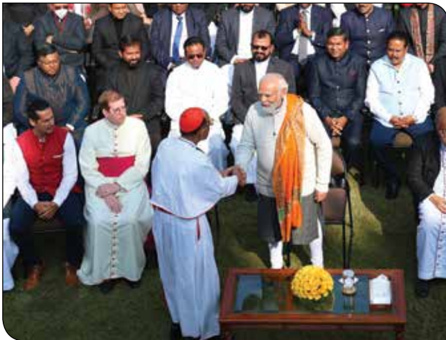
PM Shri Narendra Modi attends a programme with Christian community on the occasion of Christmas, in New Delhi on December 25, 2023