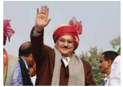
'INDIA WILL BECOME WORLD'S THIRD-LARGEST ECONOMIC POWER BY 2027'