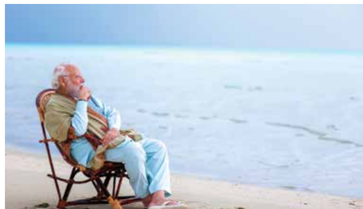
PM Shri Narendra Modi visits pris

PM Modi mentioned steps taken for the Haj Yatris that have benefited the people of Lakshadweep too.