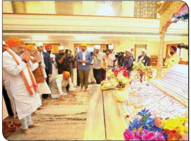
On the occasion of Veer Bal Diwas, BJP National President Shri JP Nadda & Union Home Minister Shri Amit Shah praying at Gurudwara Bara Sikh Sangat, in Kolkata, West Bengal on 26 December, 2023