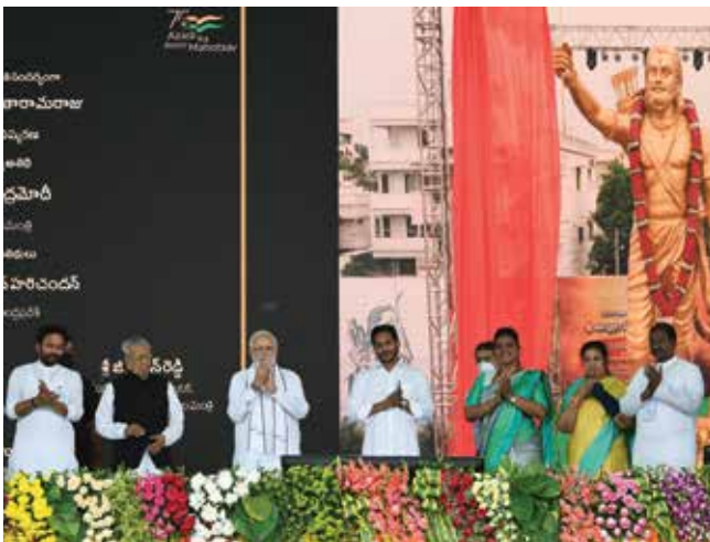
PM Shri Narendra Modi at the celebration of '125th Birth Anniversary' of freedom fighter, Shri Alluri Sitarama Raju, in Bhimavaram, Andhra Pradesh on July 04, 2022