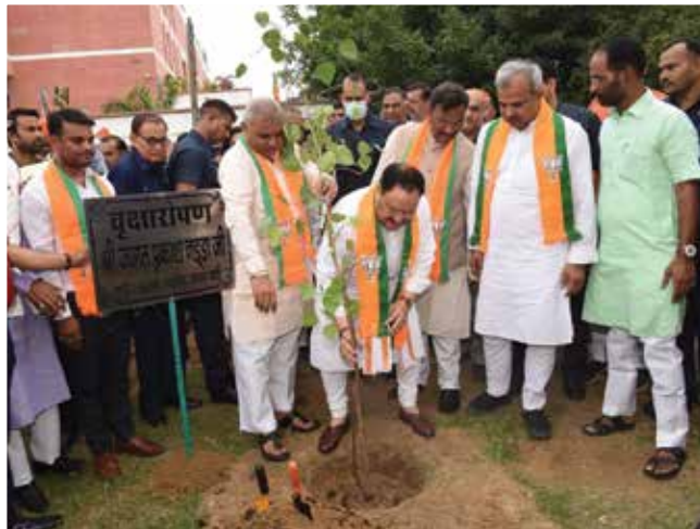
BJP National President Shri JP Nadda planting saplings at BJP HQ in New Delhi on the Jaynti of Dr. Shyama Prasad Mookerjee