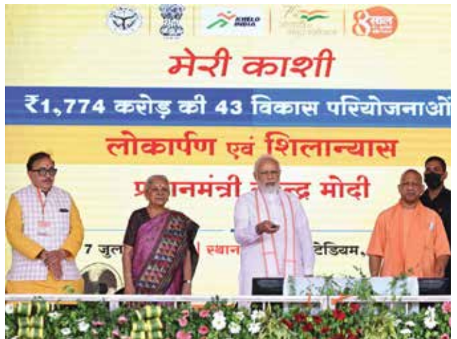
PM Shri Narendra Modi inaugurating various development projects, in Varanasi, Uttar Pradesh on July 07, 2022