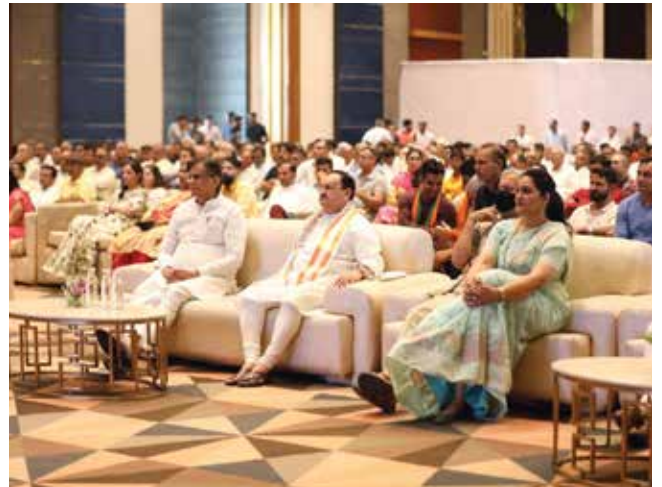
BJP President Shri JP Nadda listening Hon'ble PM Shri Narendra Modiji's "Mann Ki Baat" with party Karyakartas in Gurugram, Haryana