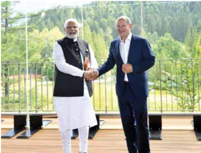
PM Shri Narendra Modi in a bilateral meeting with the Chancellor of the Federal Republic of Germany, Mr. Joko Widodo on the sidelines of G-7 Summit, in Germany on June 27, 2022