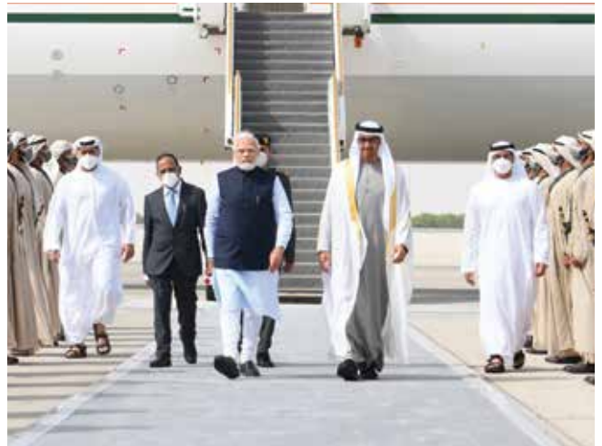
PM Shri Narendra Modi being welcomed by the president of UAE, Mr. Sheikh Mohamed bin Zayed Al Nahyan at Abu Dhabi Airport, in UAE on June 28, 2022