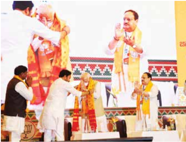
BJP Karyakartas extending a warm welcome to PM Shri Narendra Modi and BJP National President Shri JP Nadda at BJP National Executive Meeting in Hyderabad, Telangana