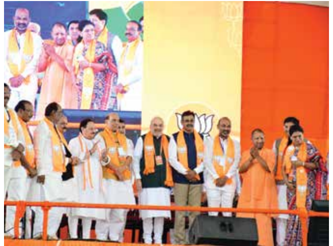
BJP National President Shri JP Nadda and other senior leaders at Vijaya Sankalpa Sabha held at Secunderabad Parade Grounds, Telengana