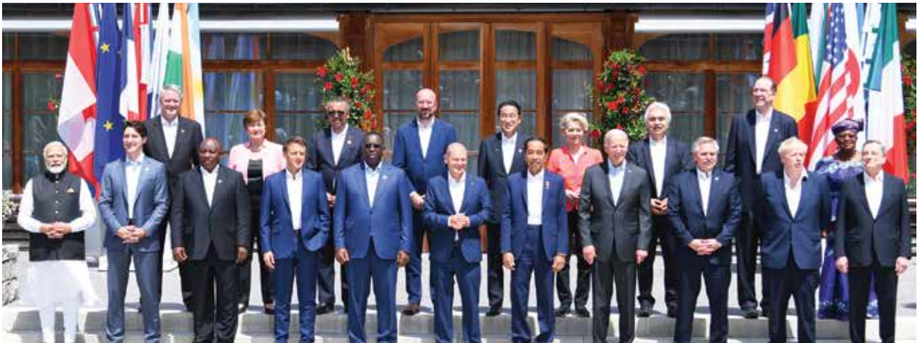
PM Shri Narendra Modi with the other G-7 leaders during a group photo at G-7 Summit, in Germany on June 27, 2022