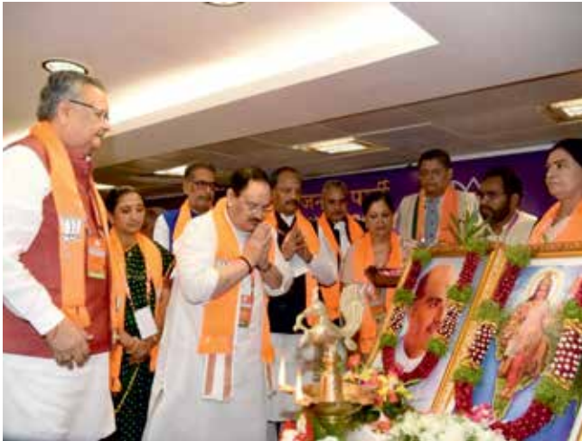
BJP National President Shri JP Nadda inaugurating BJP National Office Bearers Meeting at Hyderabad, Telangana