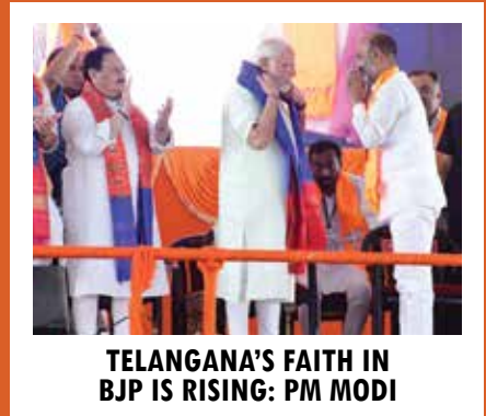
TELANGANA'S FAITH IN BJP IS RISING: PM MODI