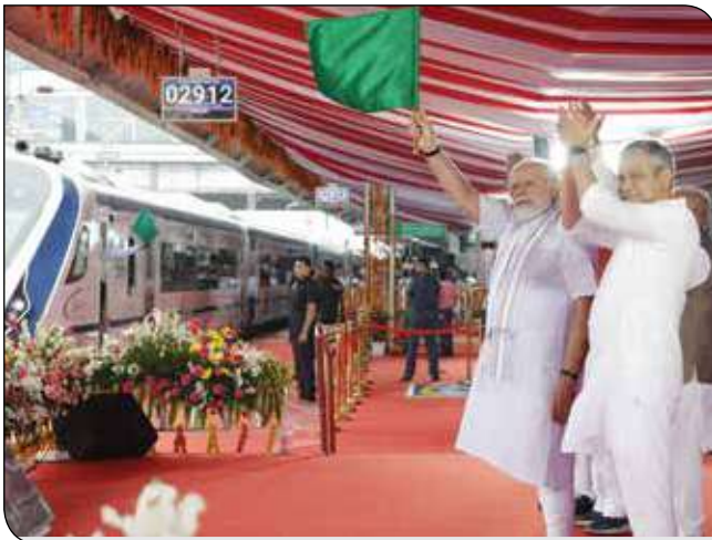
PM Shri Narendra Modi flags off 5 Vande Bharat Express at Rani Kamalapati Railway Station in Bhopal, MP on June 27, 2023