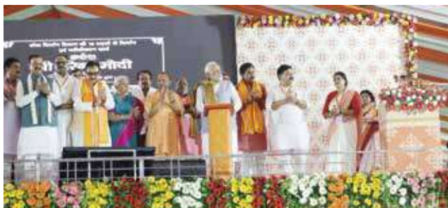
VARANASI, UTTAR PRADESH

The Prime Minister, Shri Narendra Modi inaugurated and laid the foundation stone of multiple development projects worth more than Rs 12,100 crores in Varanasi, Uttar Pradesh on July 7, 2023. The projects include the dedication of Pt. Deendayal Upadhyaya Junction - Son Nagar railway line of Dedicated Freight Corridor, three railway lines whose electrification or doubling has been completed, four-lane widening of Varanasi-Jaunpur section of NH-56, and multiple projects in Varanasi. The Prime Minister also laid the foundation stone for multiple railway projects.