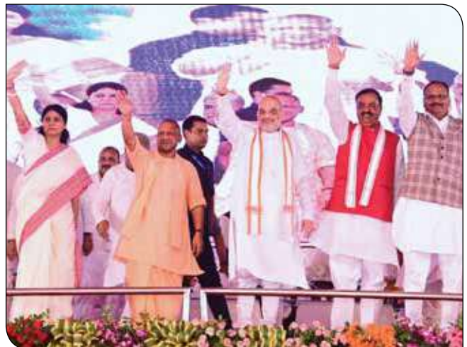
Union Home & Cooperation Minister Shri Amit Shah receiving greetings at "Jan Swabhiman Diwas" programme on the occasion of 74th Jayanti of Dr. Sone Lal Patel ji in Lucknow, UP on 02 July, 2023