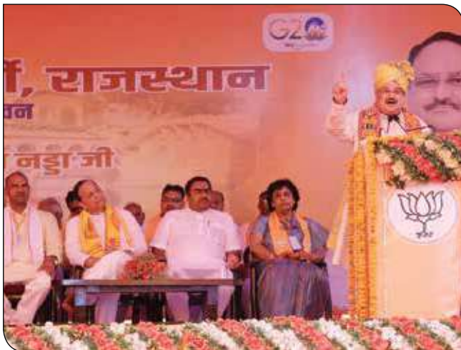
BJP National President Shri JP Nadda addressing a huge meeting after inaugurating BJP Offices at Bharatpur & Jaisalmer in Rajasthan on 29 June, 2023