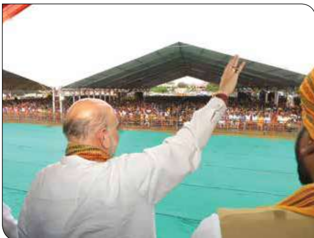
Union Home & Cooperation Minister Shri Amit Shah waving at the people after addressing a huge public meeting in Lakhisarai, Bihar on 29 June, 2023