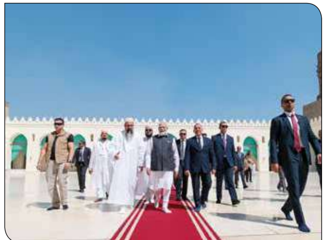
PM Shri Narendra Modi at Al-Hakim Mosque at Cairo in Egypt on June 25, 2023