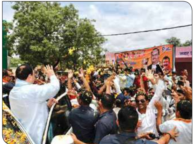
Grand Road Show of BJP National President Shri JP Nadda in Khargone, Madhya Pradesh on 30 June, 2023