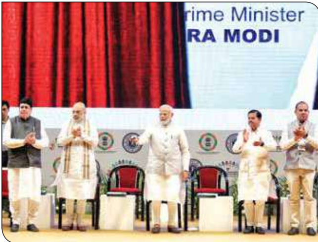
PM Shri Narendra Modi launches E-Portals of e-Commerce website for Cooperative Marketing, Cooperative Extension and Advisory Services Portal at 17th Indian Cooperative Congress in New Delhi on July 1, 2023