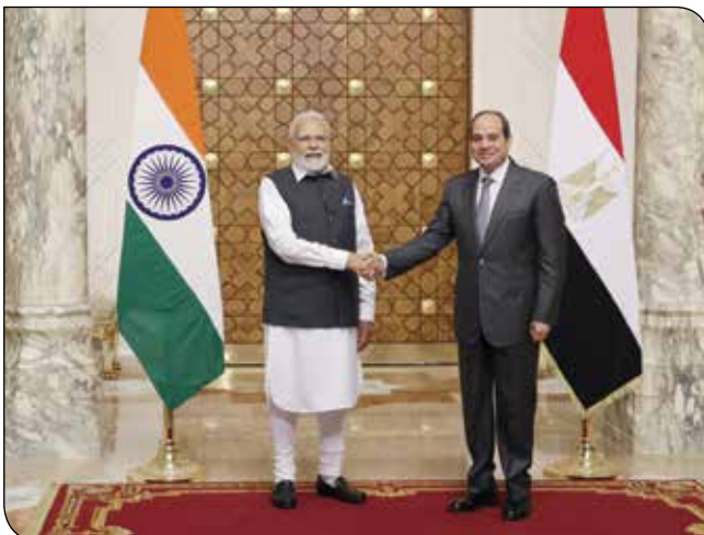
PM Shri Narendra Modi meeting with Egyptian President, Mr. Abdel Fattah El-Sisi, at President House, Cairo in Egypt on June 25, 2023