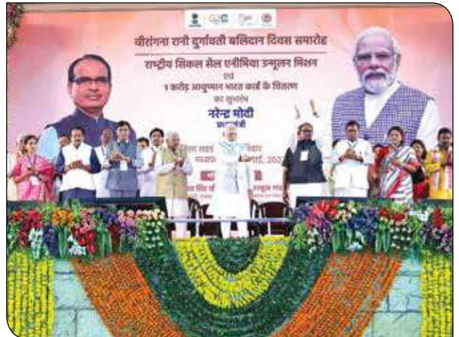
PM Shri Narendra Modi launches National Sickle Cell Anaemia Elimination Mission at Shahdol in Madhya Pradesh on July 1, 2023