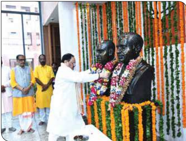
BJP National President Shri JP Nadda paying floral tributes to Dr Shyama Prasad Mookerjee on his jayanti at BJP HQ, New Delhi on 06 July, 2023