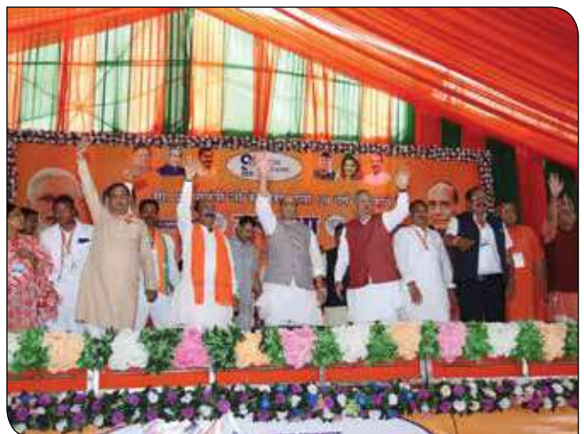
Defence Minister Shri Rajnath Singh receiving greetings at a huge public meeting in Kanker, Chhattisgarh on 01 July, 2023