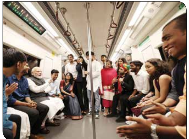
PM Shri Narendra Modi interacting with people in delhi metro on his way to attend the Centenary Celebrations of University of Delhi in New Delhi on June 30, 2023