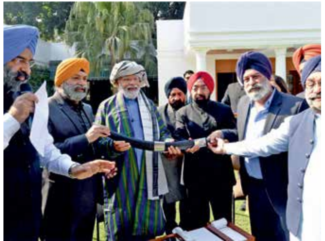
Hindu and Sikh refugees from Afghanistan meeting with PM Shri Narendra Modi at his residence in New Delhi