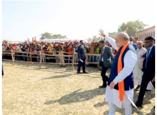
Union Home Minister Shri Amit Shah waving at the gathering during a public meeting in Koraon (Uttar Pradesh)