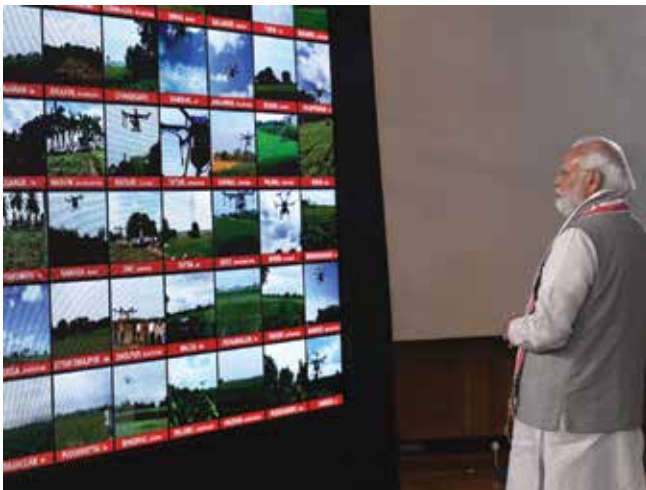
PM Shri Narendra Modi witnessing Kisan Drone in action at 100 places across the country through video conferencing in New Delhi