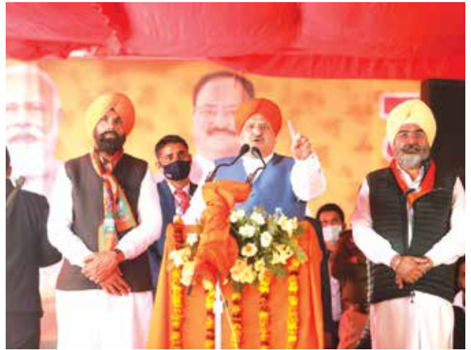
BJP National President Shri JP Nadda addressing a public meeting at Old Grain Market, Maur Mandi (Punjab)