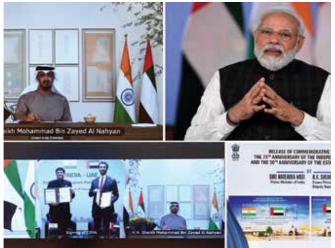
PM Shri Narendra Modi addressing at the India-UAE Virtual Summit in New Delhi