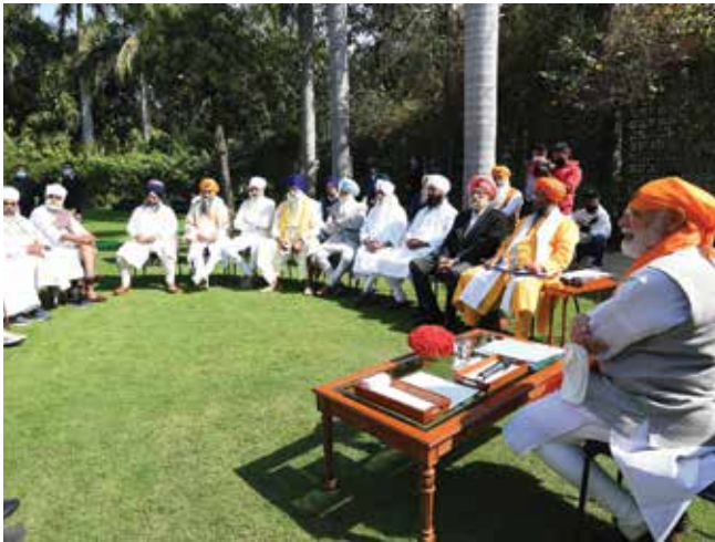
PM Shri Narendra Modi meets with Sikh Delegation, at his residence in New Delhi