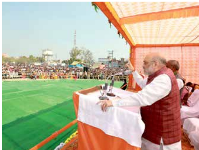
Union Home Minister Shri Amit Shah addressing a massive rally in Auraiya, Uttar Pradesh