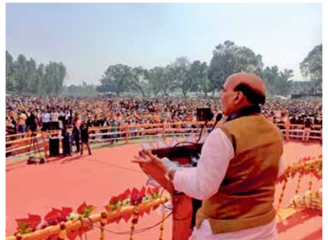
Defence Minister Shri Rajnath Singh addressing a huge public meeting in Gonda, Uttar Pradesh