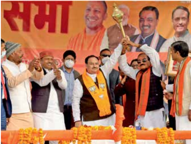
Uttar Pradesh BJP welcomes BJP National President Shri JP Nadda at a public meeting in Kheri