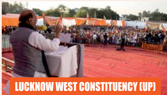
LUCKNOW WEST CONSTITUENCY (UP)