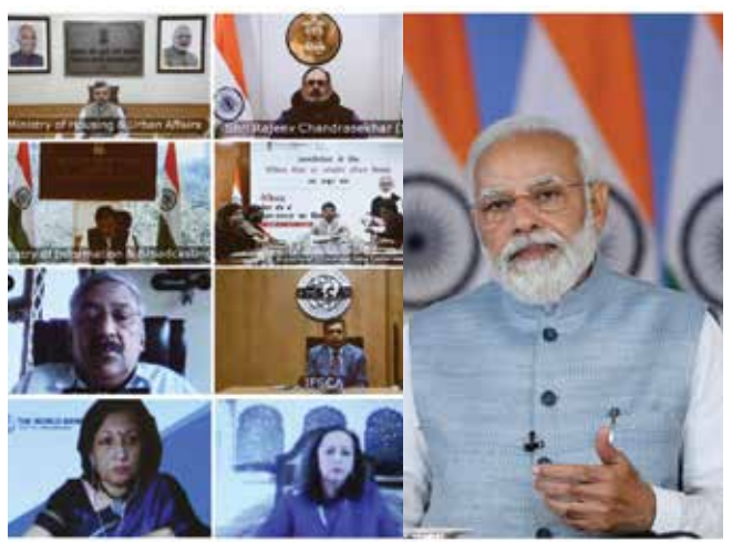
PM Shri Narendra Modi addressing a webinar on positive impact of Union Budget 2022 on the education and skill sector in New Delhi