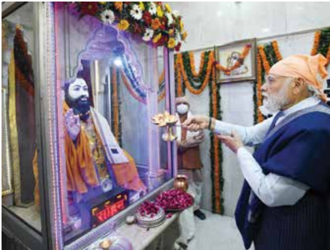
PM Shri Narendra Modi offering prayers at the Shri Guru Ravidas Vishram Dham Mandir in Karol Bagh, on the auspicious occasion of Guru Ravidas Jayanti in Delhi