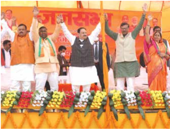
BJP National President Shri JP Nadda receiving the greetings of the people at Rudrapur, U.P.