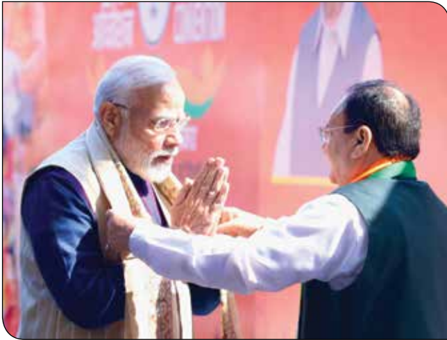
BJP National President Shri JP Nadda welcoming PM Shri Narendra Modi to the BJP National Convention held at Bharat Mandapam, New Delhi on 17 February, 2024