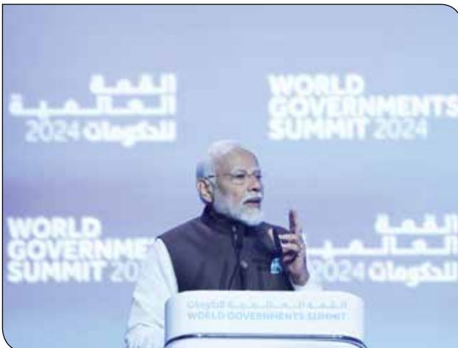
PM Shri Narendra Modi addressing the gathering of world leaders at the World Government Summit in Dubai on February 14, 2024