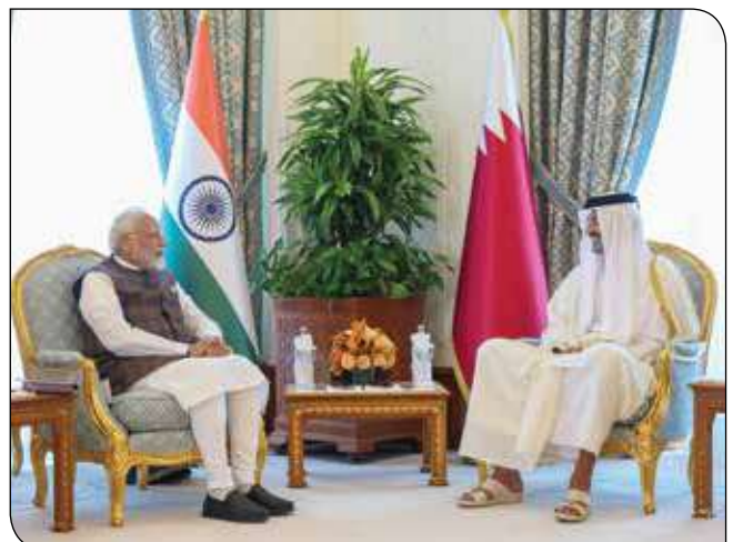
PM Shri Narendra Modi holds a bilateral meeting with the Emir of Qatar, Sheikh Tamim bin Hamad Al Thani in Doha in Qatar on February 15, 2024