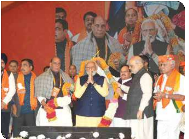
BJP National President Shri JP Nadda, Union Ministers Shri Rajnath Singh, Shri Amit Shah and other leaders welcoming PM Shri Narendra Modi at the BJP National Convention in New Delhi on 17 February, 2024