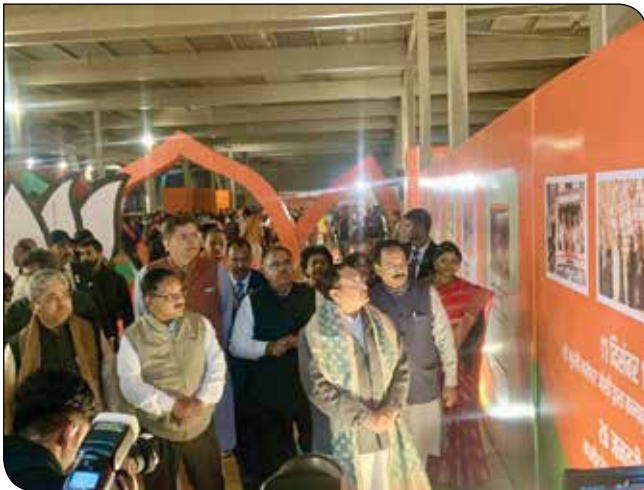
BJP National President Shri JP Nadda along with other senior leaders visiting the exhibition at the BJP National Convention in New Delhi on 17 February, 2024