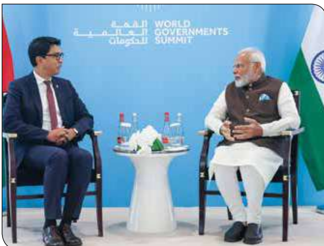
PM Shri Narendra Modi in a bilateral meeting with the President of Madagascar, Mr. Andry Rajoelina in Abu Dhabi on February 14, 2024