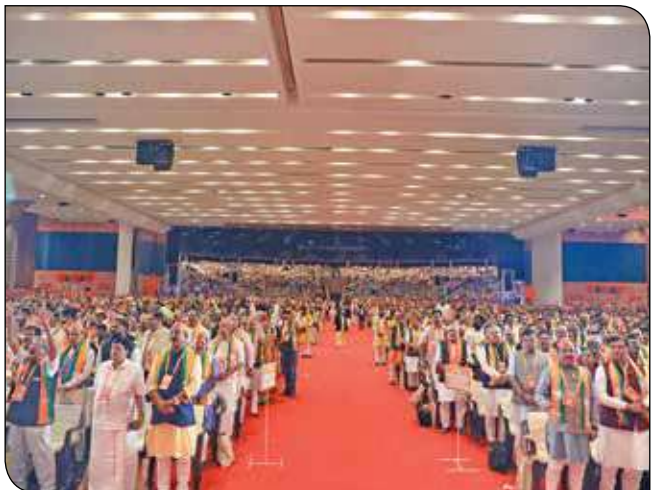
Grand view of the BJP National Convention at Bharat Mandapam, New Delhi on 17 February, 2024