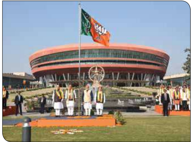
PM Shri Narendra Modi along with BJP National President Shri JP Nadda, Union Ministers Shri Rajnath Singh and Shri Amit Shah unfurling the Party flag at the BJP National Convention, New Delhi on 17 February, 2024