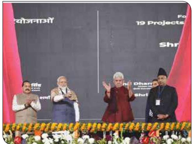
PM Shri Narendra Modi dedicates to the nation and lays the foundation stone of multiple development projects in Jammu, J&K on February 20, 2024