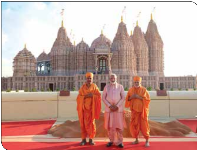
PM Shri Narendra Modi at the inauguration of the BAPS temple in Abu Dhabi, UAE on February 14, 2024