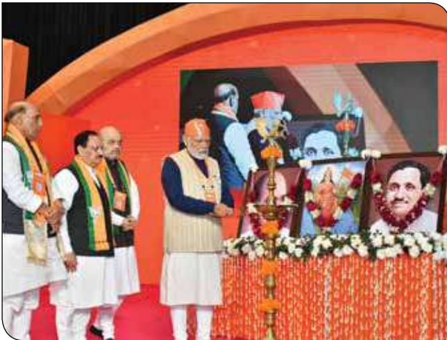
PM Shri Narendra Modi along with BJP National President Shri JP Nadda, Union Ministers Shri Rajnath Singh and Shri Amit Shah lighting the lamp at the inauguration of BJP National Convention in New Delhi on 17 February, 2024