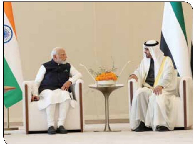
PM Shri Narendra Modi attends the India-UAE delegation level talks with the President of the United Arab Emirates, Sheikh Mohammed bin Zayed Al Nahyan at Abu Dhabi in UAE on February 13, 2024