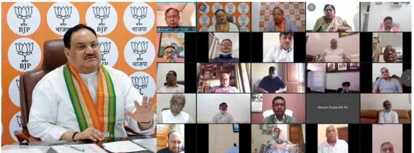
BJP National President Shri JP Nadda chaired a meeting of BJP MPs of Uttarakhand, Himachal Pradesh, Punjab, Chandigarh, Uttar Pradesh, Assam, Tripura, Manipur, Arunachal Pradesh and Daman Diu on Covid pandemic via video conference in New Delhi.