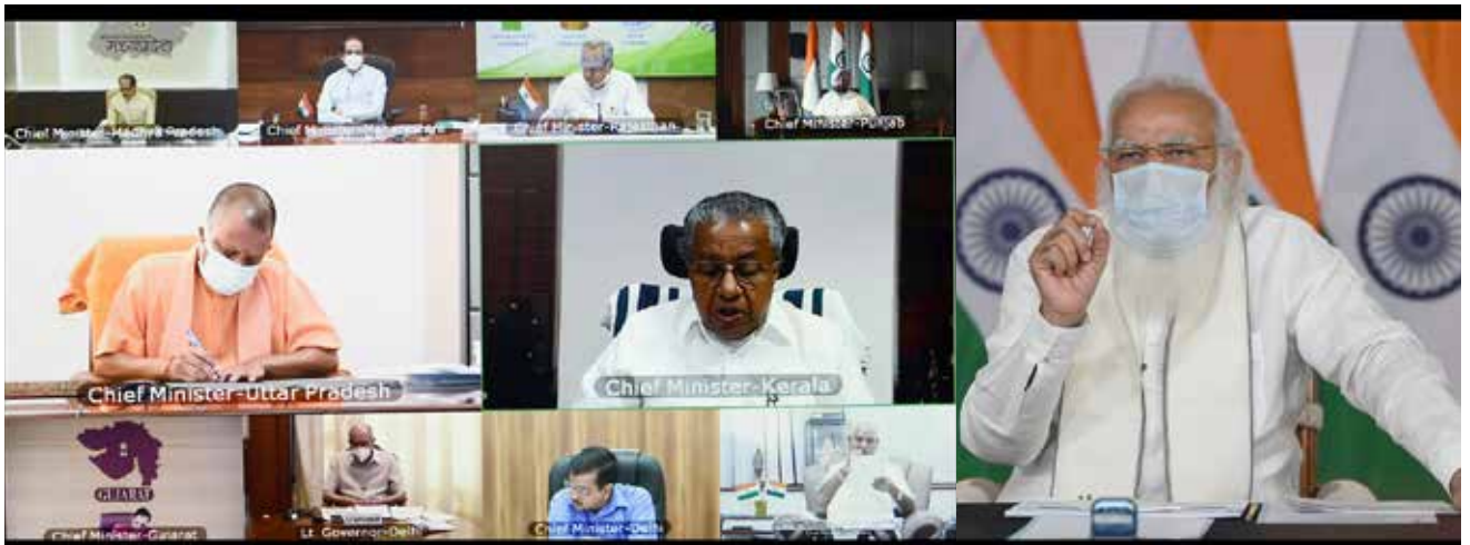
Prime Minister Shri Narendra Modi in a meeting with the Chief Ministers on COVID situation in the country via video conferencing in New Delhi.