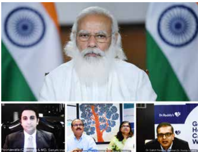
Prime Minister Shri Narendra Modi interacting with the Vaccine manufacturers, through video conferencing in New Delhi.