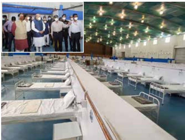
Union Minister Shri Amit Shah reviewing the Covid situation in Gujarat and visits a 950-bed facility coming up for patients at the GMDC ground in Ahmedabad. Gujarat CM Shri Vijay Rupani and others are also present during the visit.