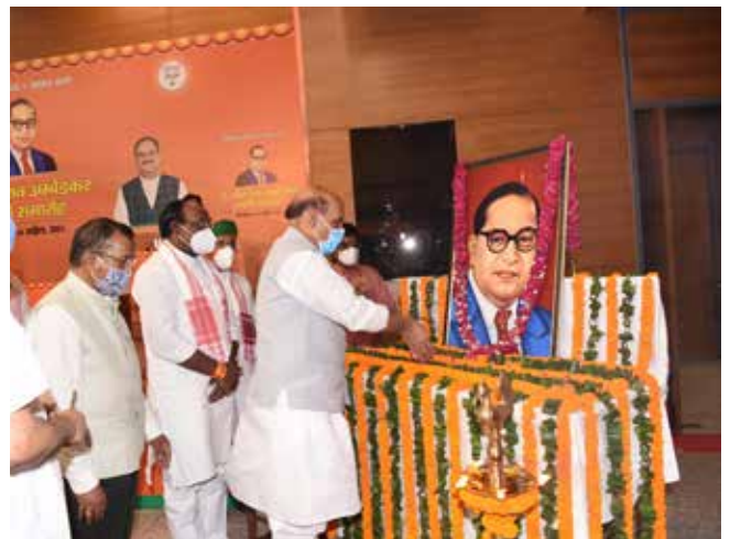
Union Minister Shri Rajnath Singh paying floral tributes before addressing BJP Karyakartas on Bharat Ratna Baba Sahab Bheem Rao Ambedkar ji's Jayanti, New Delhi.