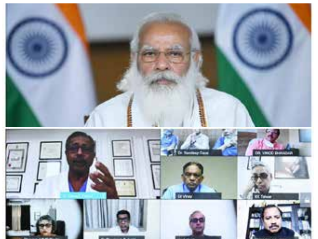
Prime Minister Shri Narendra Modi interacting with the Healthcare Professionals through video conferencing in New Delhi.