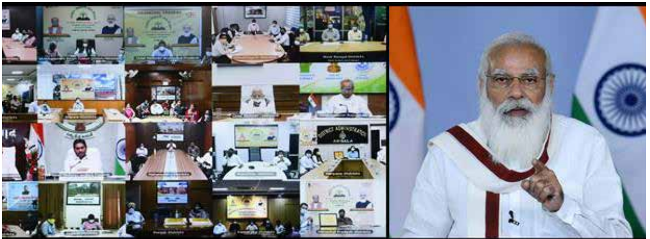
Prime Minister Shri Narendra Modi addresses on the occasion of the National Panchayati Raj Day 2021, through video conferencing in New Delhi.