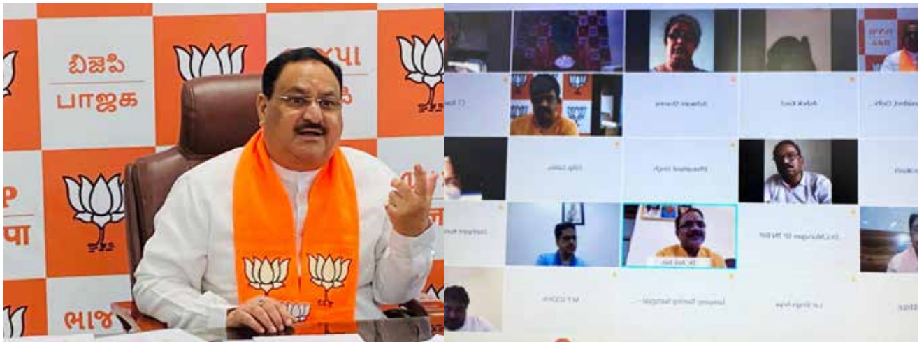
BJP National President Shri JP Nadda addressing a virtual meeting of party National Office Bearers & State Presidents in New Delhi.