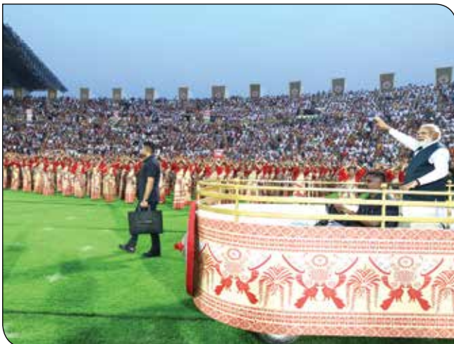
PM Shri Narendra Modi attends the Bihu celebrations in Guwahati, Assam on April 14, 2023