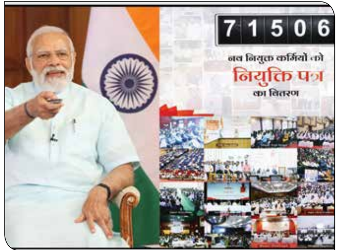
PM Shri Narendra Modi distributes 71,000 appointment letters under National Rozgar Mela via video conferencing on April 13, 2023