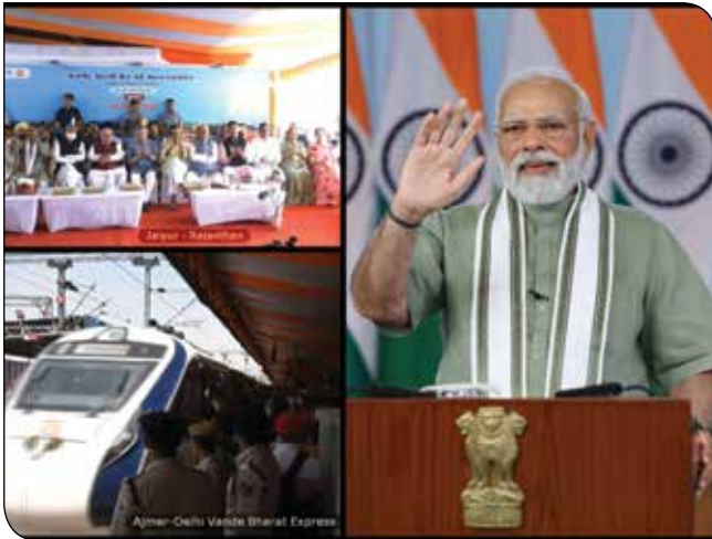
PM Shri Narendra Modi addressing the gathering after flagging off Rajasthan's first Vande Bharat Express train between Jaipur and Delhi Cantt via video conferencing on April 12, 2023