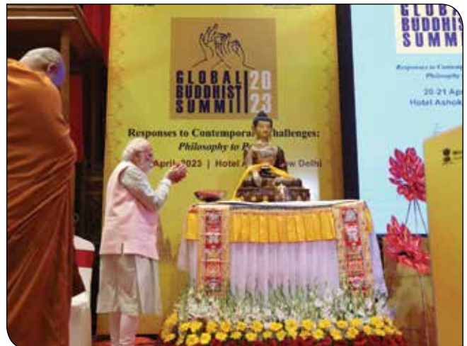
PM Shri Narendra Modi offers floral Tributes to Lord Buddha statue at Global Buddhist Summit 2023 in New Delhi on April 20, 2023