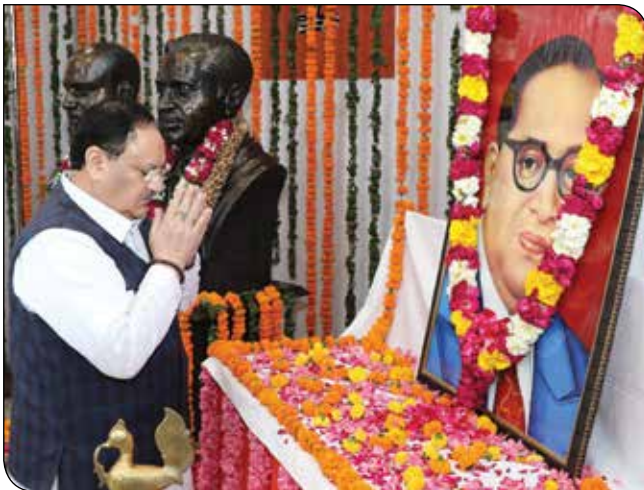
BJP National President Shri JP Nadda paying floral tributes to Bharat Ratna Baba Sahab Dr Bhim Rao Ambedkar on his Jayanti at BJP HQ in Delhi on April 14, 2023