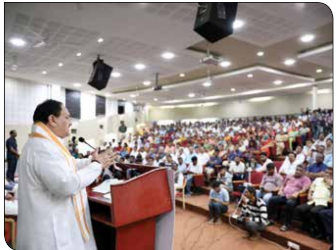
BJP National President Shri JP Nadda addressing an intellectual meeting in Hubli, Karnataka on April 18, 2023