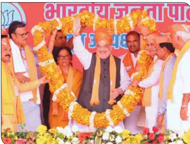
Union Home & Cooperation Minister Shri Amit Shah addressing the 'Booth President Sankalp Maha Sammelan' at Bharatpur, Rajasthan on April 15, 2023