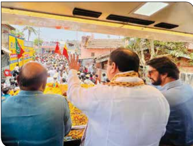
BJP National President Shri JP Nadda along with Karnataka CM Shri Basavaraj Bommai in a massive Road Show at Haveri on April 19, 2023