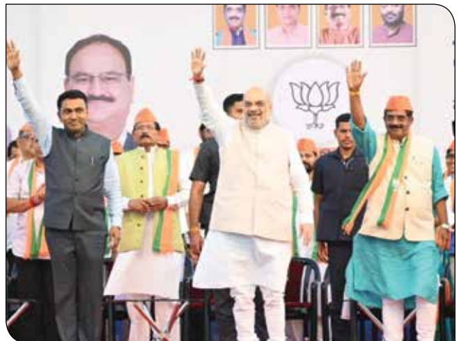
Union Home & Cooperation Minister Shri Amit Shah addressing a huge public meeting in South Goa on April 16, 2023