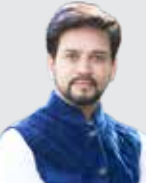
ANURAG SINGH THAKUR

India's vaccine story owes its success in great measure to Mann ki Baat. That alone is tribute enough to its relevance and significance