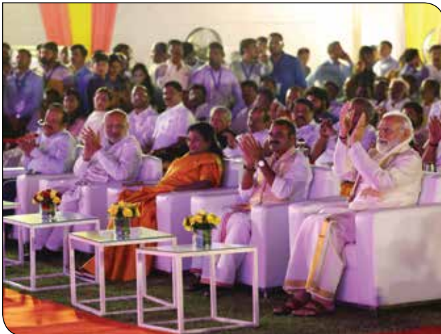
PM Shri Narendra Modi attends Tamil New Year celebrations in New Delhi on April 13, 2023