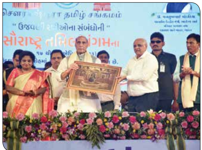
Defence Minister Shri Rajnath Singh inaugurating the 'Saurashtra Tamil Sangamam' at Somnath in Gujarat on April 17, 2023. Governor of Telangana Smt. Tamilisai Soundararajan & Gujarat CM Shri Bhupendra Patel are also seen on the dais.