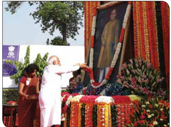
PM Shri Narendra Modi pays tribute to Dr. B R Ambedkar on his Jayanti at Parliament House in New Delhi on April 14, 2023