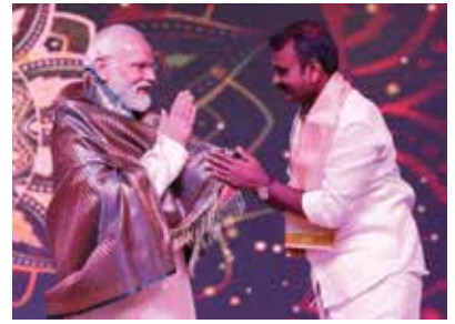
"TAMIL IS THE WORLD'S OLDEST LANGUAGE; EVERY INDIAN IS PROUD OF THIS"