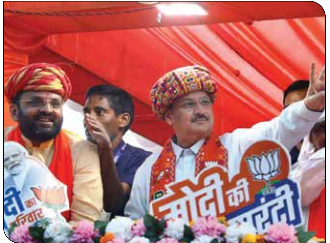
BJP National President Shri JP Nadda along with other BJP leaders during a massive Road Show in Gandhidham, Kutch, Gujarat on 03 May, 2024