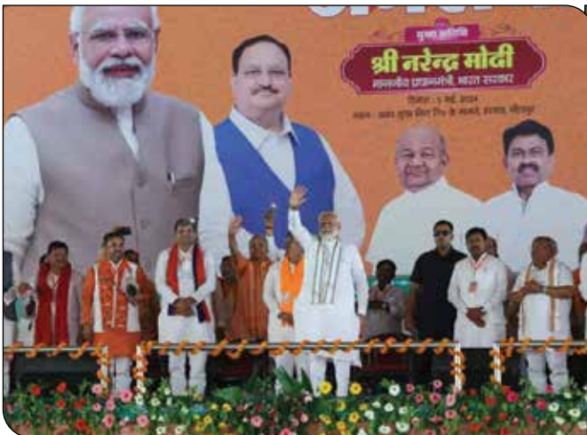
Prime Minister Shri Narendra Modi receiving the greetings of the people at a mammoth rally in Etawah, Uttar Pradesh on 5 May, 2024