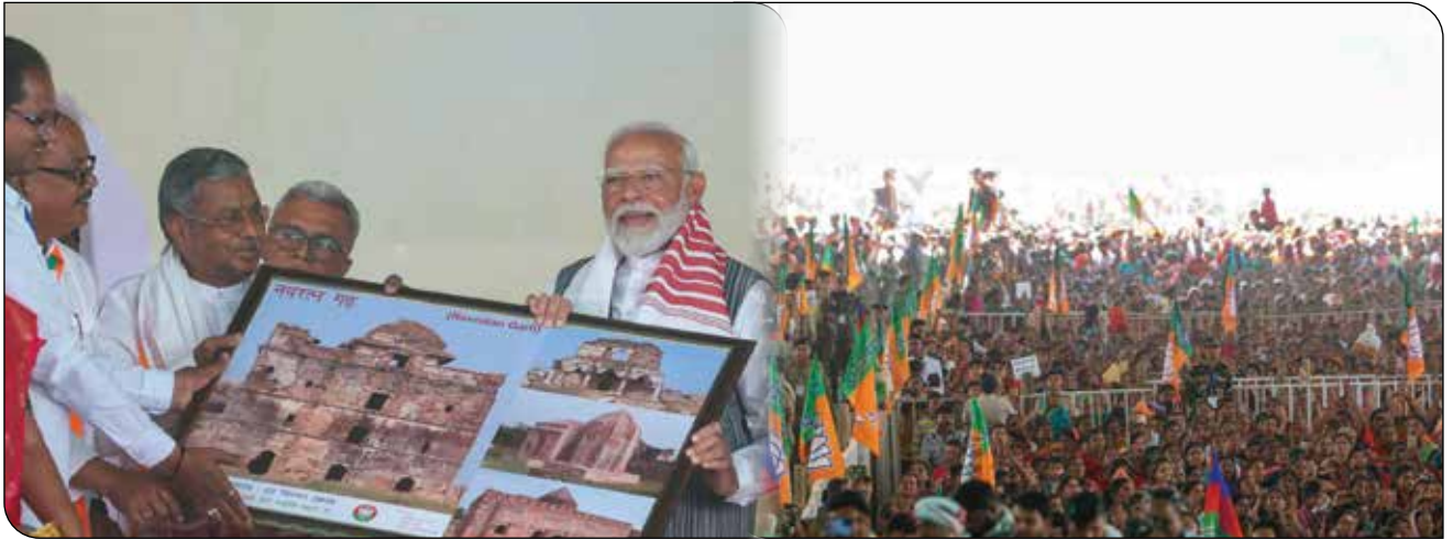
Jharkhand BJP welcomes Prime Minister Shri Narendra Modi before addressing a massive rally at Lohardaga on 4 May, 2024