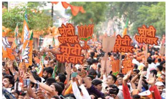
Spectacular view of PM Shri Narendra Modi's Roadshow in Varanasi, UP