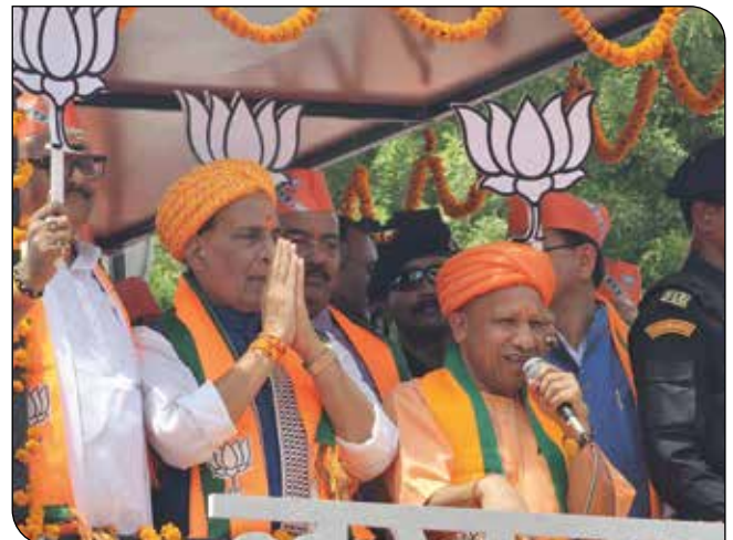
Defence Minister Shri Rajnath Singh and UP Chief Minister Yogi Adityanath during a gigantic Road Show in Lucknow on 29 April, 2024