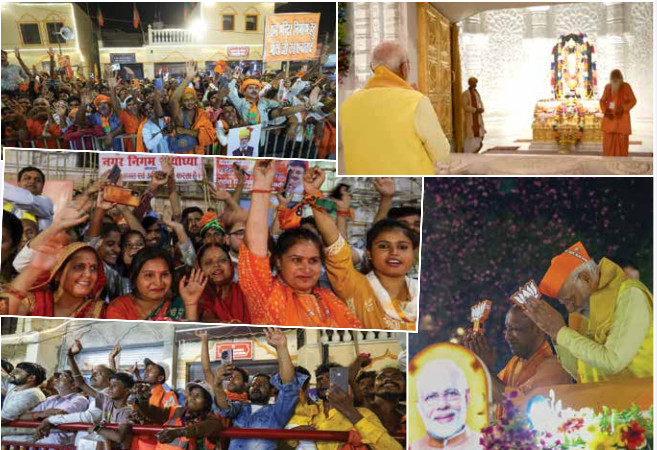
Grand view of PM Shri Narendra Modi's Roadshow in Ayodhya, UP

A record number of people gathered to greet the PM and cheer for the Bharatiya Janata Party. People chanted 'Jai Shri Ram,' 'Modi Modi,' 'Bharat Mata ki Jai' and 'Phir Ek Baar Modi Sarkar.' The atmosphere was electric as supporters showered flower petals, creating a vibrant display of affection and support as the PM's convoy made its way through the city. ■