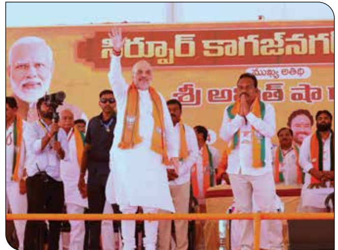
Union Home and Cooperation Minister Shri Amit Shah during a mega public rally in Adilabad, Telangana on 05 May, 2024