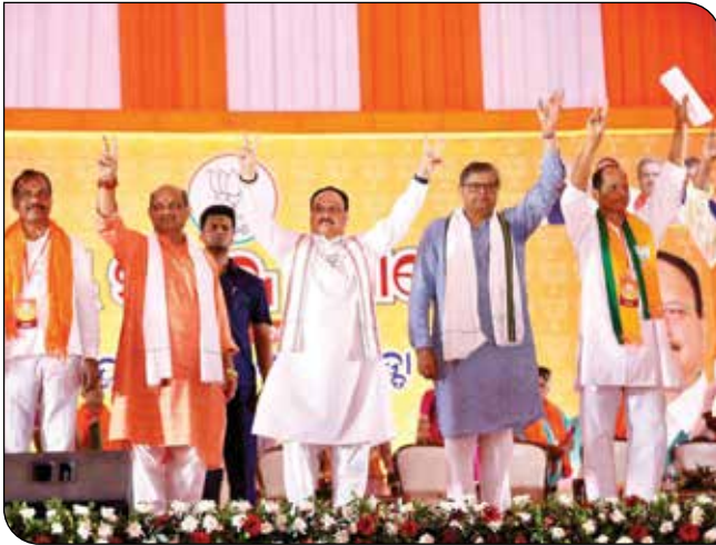
BJP National President Shri JP Nadda along with BJP National Vice-President Shri Bajiyant Jay Panda and other senior leaders during a mega 'Vijay Sankalp Samavesh' in Berhampur, Odisha on 28 April, 2024