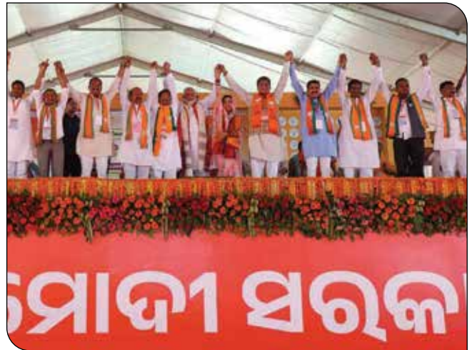
Prime Minister Shri Narendra Modi receiving the greetings of the people at a massive rally in Nawarangpur, Odisha on 6 May, 2024