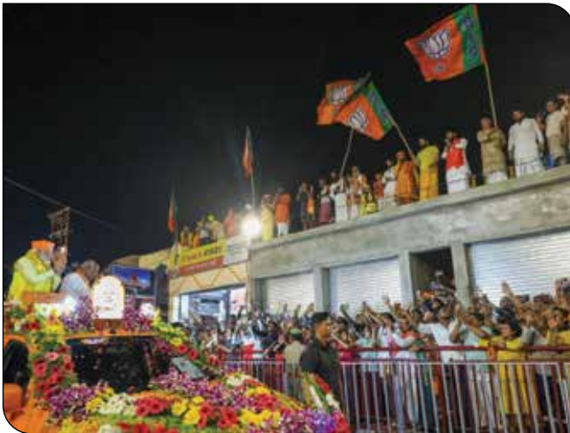
Prime Minister Shri Narendra Modi on a mega Road Show in Ayodhya, Uttar Pradesh on 5 May, 2024