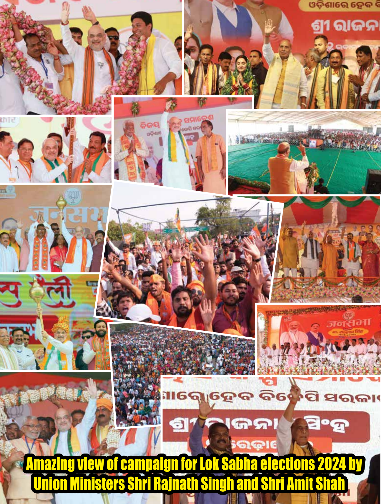
Amazing view of campaign for Lok Sabha elections 2024 by Union Ministers Shri Rajnath Singh and Shri Amit Shah