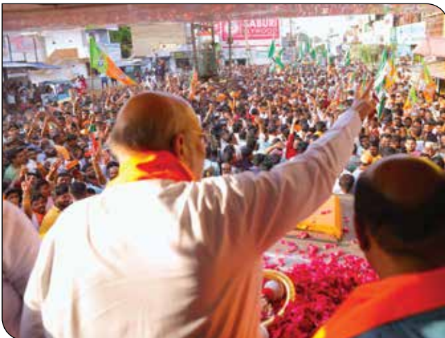
Union Home and Cooperation Minister Shri Amit Shah during a massive public rally in Hubli-Dharwad, Karnataka on 01 May, 2024