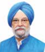
HARDEEP S PURI

One issue in particular is how the poor citizens have fared in the last 10 years in India. Many spurious claims have been made, despite the overwhelming evidence that the last 10 years have witnessed a significant rise in consumption per capita; a drastic reduction in poverty; and decline in inequality. Nearly 25 crore people exited multidimensional poverty in the nine-year period between 2013-14 (29.17%) and 2022-23 (11.28%), according to Niti Aayog