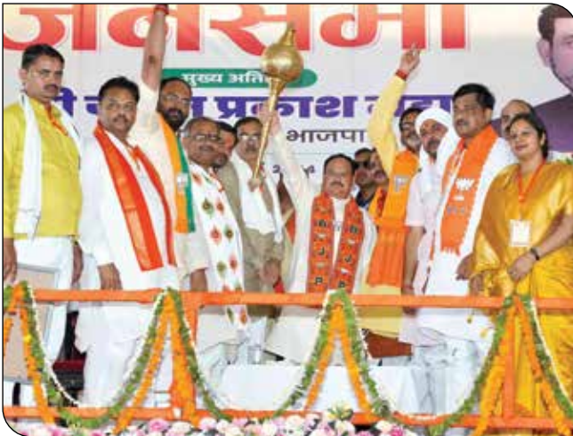
Uttar Pradesh BJP welcomes BJP National President Shri JP Nadda just before addressing a mega public rally at Chitrakoot Dhaam, UP on 09 May, 2024