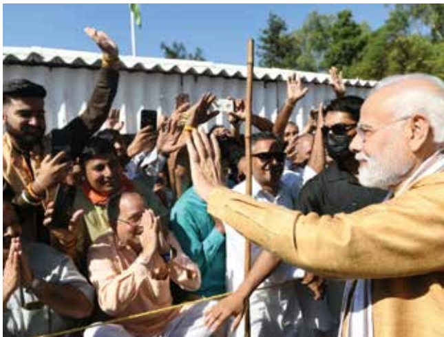
PM Shri Narendra Modi meeting the common public during his visit to Una in Himachal Pradesh on October 13, 2022