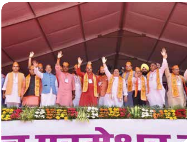
BJP National President Shri JP Nadda receiving the greetings during Panch Parmeshwar Sammelen in Delhi on 16 October, 2022