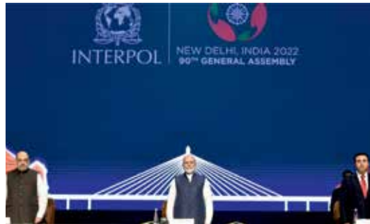
PM ADDRESSES 90TH INTERPOL GENERAL ASSEMBLY IN NEW DELHI

Addressing the gathering, Prime Minister Shri Narendra Modi extended a warm welcome to all the dignitaries on the occasion of the 90th 'Interpol General Assembly' in New Delhi. The Prime Minister also informed that Interpol will be celebrating 100 years of its inception and it is a time for retrospection as well as a time to decide the future.