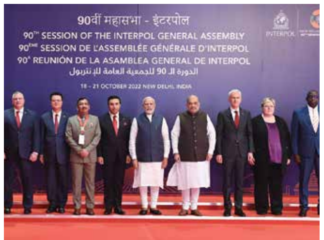
PM Shri Narendra Modi at the 90th Interpol General Assembly in New Delhi on October 18, 2022.