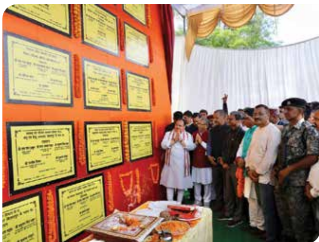
BJP National President Shri JP Nadda inaugurating various development projects in Bilaspur Himachal Pradesh on 11 October, 2022