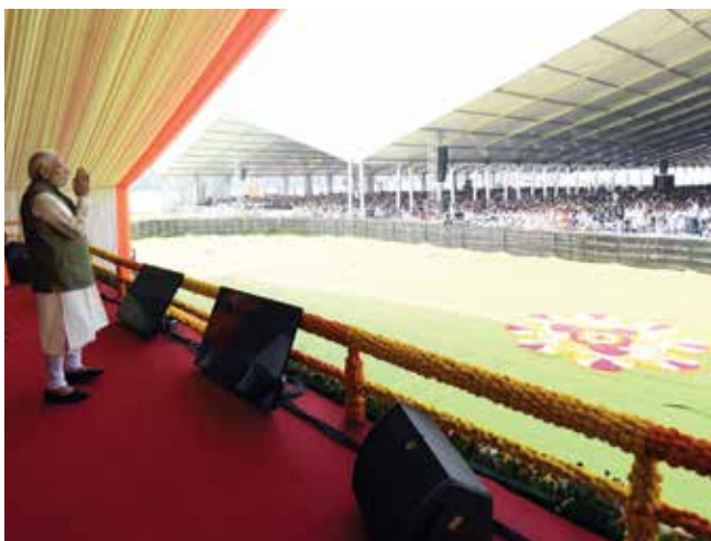
PM Shri Narendra Modi at the inauguration of PM Kisan Samman Sammellan 2022 at Indian Agricultural Research Institute in New Delhi on October 17, 2022.