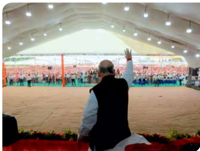
Union Home and Cooperation Minister Shri Amit Shah addressing a huge rally after flagging off 'Gujarat Gaurav Yatra' at Unai, Navsari, Gujarat on 13 October, 2022