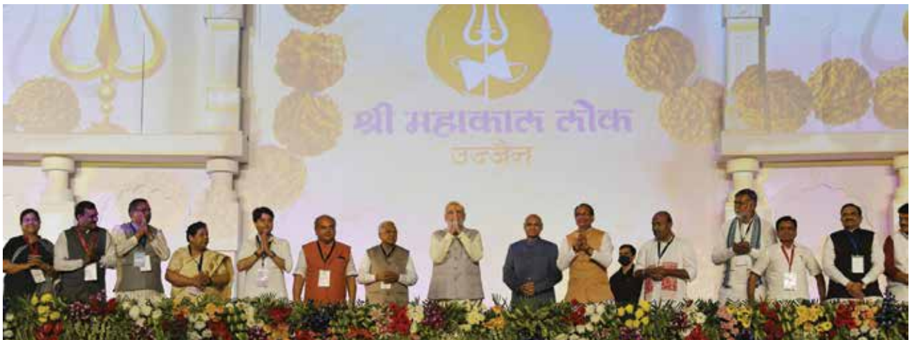
PM Shri Narendra Modi during the dedication of the Phase I of the Mahakal Lok Project to the Nation in Ujjain, Madhya Pradesh on October 11, 2022.