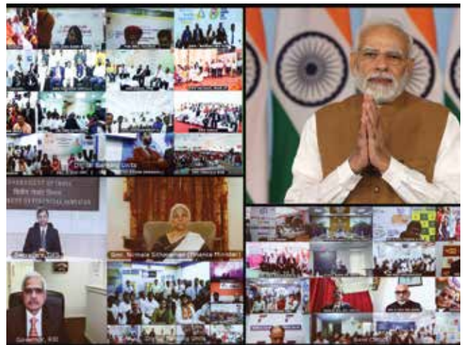
PM Shri Narendra Modi dedicates 75 Digital Banking Units across 75 districts to the Nation in New Delhi on October 16, 2022.