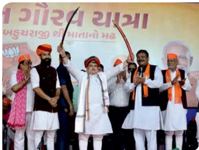
Gujarat BJP welcomes party National President Shri JP Nadda during a public meeting at Bahucharaji, Mehsana, Gujarat on 12 October, 2022