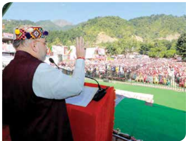
Union Home and Cooperation Minister Shri Amit Shah while addressing a massive public meeting at Sataun, Sirmaur Himachal Pradesh on 15 October, 2022