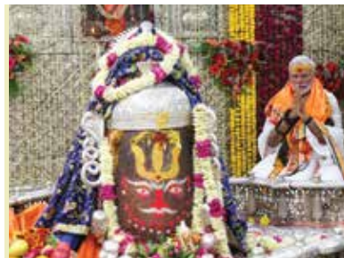
INDIA RESTORING ITS GLORY AND PROSPERITY: PM MODI