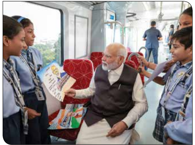
PM Shri Narendra Modi flagging off the RapidX train 'Namo Bharat' between Sahibabad to Duhai Depot in Uttar Pradesh on October 20, 2023. After launching, the PM also interacting with school children and crew of RapidX train onboard.