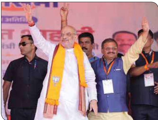
Union Home & Cooperation Minister Shri Amit Shah receiving the greetings at Parivartan Sankalp Mahasabha in Jagdalpur, Chhattisgarh on 19 October, 2023