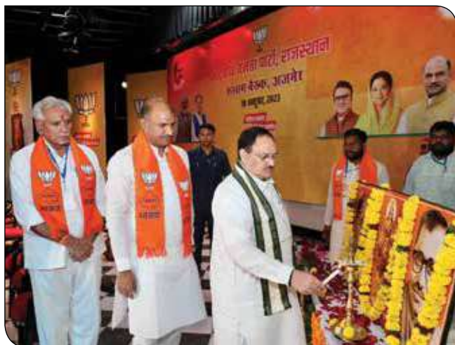
BJP National President Shri Jagat Prakash Nadda at BJP Sambhaag meeting in Ajmer, Rajasthan on 18 October, 2023