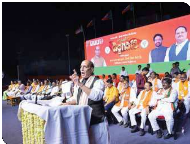
Union Minister Shri Rajnath Singh addressing a huge election meeting in Huzurabad assembly constituencies in Telangana on 16 October, 2023