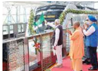
PM FLAGS OFF NAMO BHARAT RAPIDX TRAIN CONNECTING SAHIBABAD TO DUHAI DEPOT