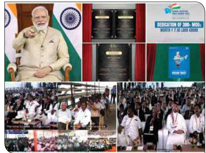
PM Shri Narendra Modi addressing at the launch of 'Pramod Mahajan Grameen Kaushalya Vikas Kendras' in Maharashtra on October 19, 2023