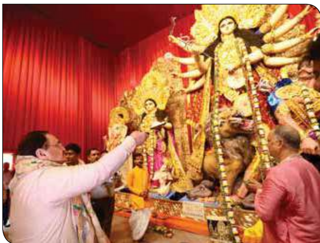
BJP National President Shri JP Nadda visited Puja pandals in Kolkata (West Bengal) & offered prayers on the occasion of Maha Saptami during the Maa Durga Puja Festivals on 21 October, 2023