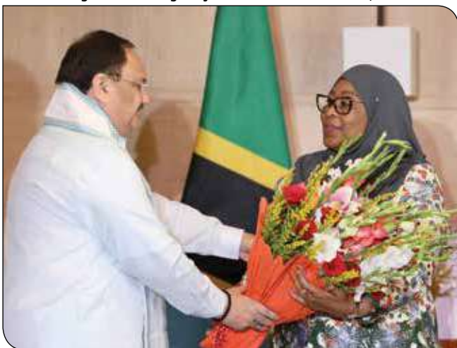
BJP National President Shri Jagat Prakash Nadda meets President of Tanzania Samia Suluhu Hassan in New Delhi on 11 October, 2023