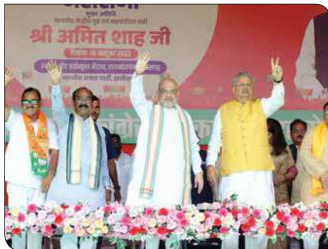
Union Home & Cooperation Minister Shri Amit Shah waving at the gathering at Parivartan Sankalp Mahasabha in Rajnandgaon in Chhattisgarh on 16 October, 2023