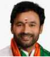
G KISHAN REDDY

Shri Narendra Modi aptly called its passage an Agni Pareeksha for the MPs. An Agni Pareeksha indeed is: an Agni Pareeksha to restore the traditional glory of Bharat, which stood for equality and balance; an Agni Pareeksha to reclaim the highest pedestal that women have enjoyed since time immemorial; and an Agni Pareeksha to rise above political misgivings and stand together for the Naari Shakti.