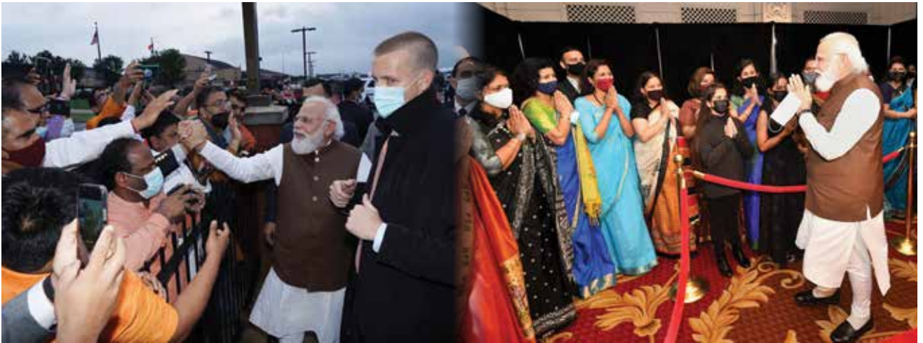
Prime Minister Shri Narendra Modi being greeted by the Indian Community on his arrival in USA