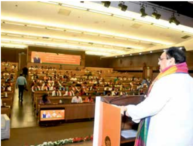
BJP National President Shri JP Nadda addressing BJYM National Executive Meeting in New Delhi