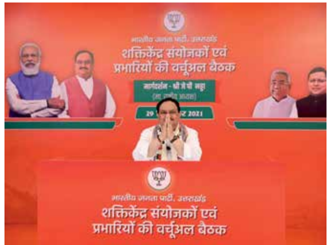
BJP National President Shri JP Nadda addressing Shakti Kendra conveners & Prabharies of Uttarakhand BJP virtually