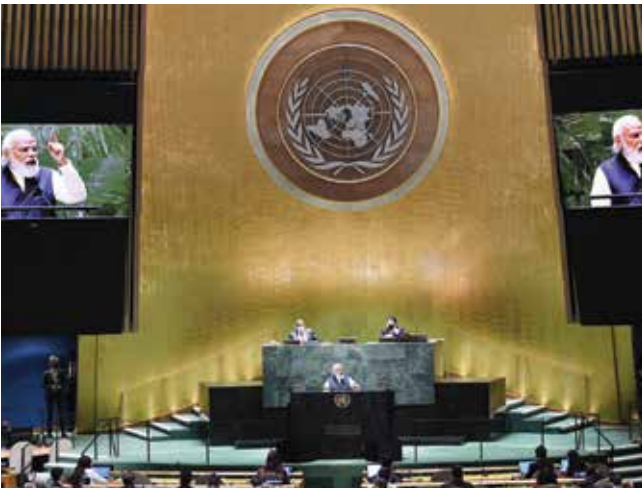
Prime Minister Shri Narendra Modi addressing the 76th session of United Nations General Assembly (UNGA) in New York, USA