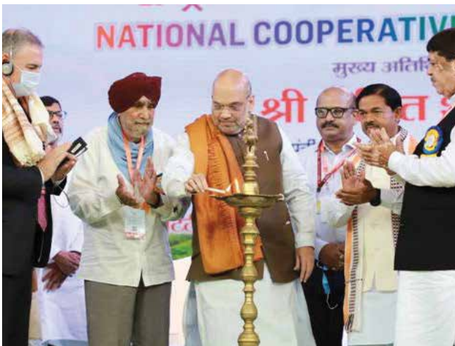
Union Minister of Home and Cooperation Shri Amit Shah inaugurating the National Cooperative Conclave by lighting the lamp in New Delhi