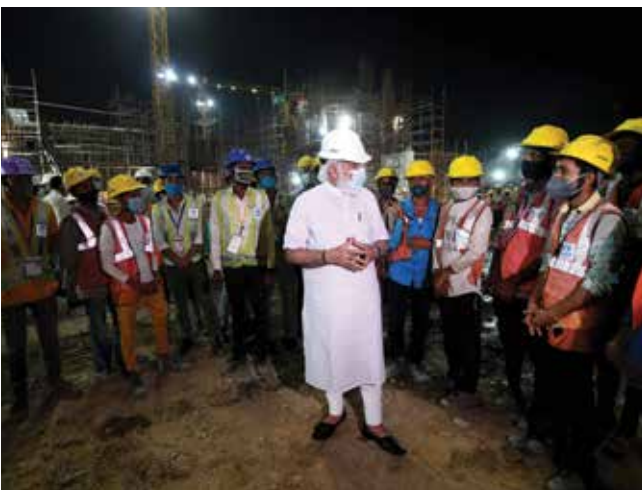
Prime Minister Shri Narendra Modi inspects the construction works of new Parliament building in New Delhi