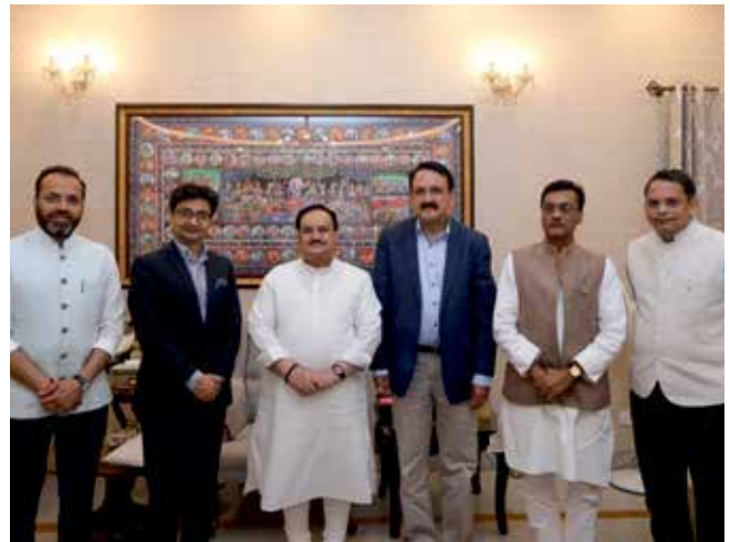
Delegation from Nepali Congress under the leadership of Shri Prakash Sharan Mahat called on BJP President Shri JP Nadda and discussed various avenues of enhancing party to party interactions