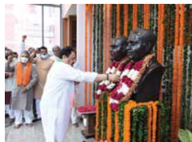
'BJP WORKERS SHOULD TAKE INSPIRATION FROM LIFE OF PANDIT DEENDAYAL UPADHYAYA'