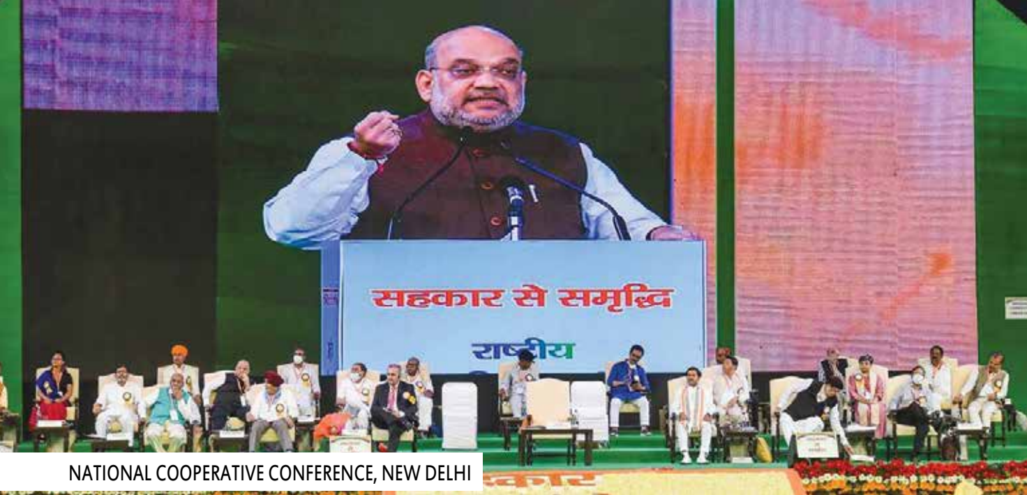
NATIONAL COOPERATIVE CONFERENCE, NEW DELHI