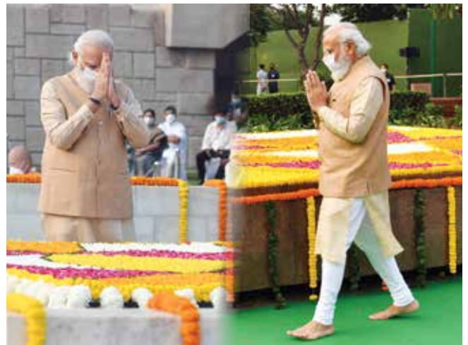
Prime Minister Shri Narendra Modi paying homage at the Samadhi of Mahatma Gandhi at Rajghat and paying tributes to Lal Bahadur Shastri, at Vijay Ghat, on there Jayanti in Delhi