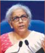
SMT. NIRMALA SITHARAMAN

T HE INDIAN ECONOMY has seen rapid changes, particularly in the last seven years, which are transformational. Time does not give us the luxury of gentle, incremental changes that are less disruptive. Moving India away from debilitating socialism to a free-market economy suffused with Indian ethos is an enormous task. Socialism, aggravated by a licence quota raj, had chained down India's entrepreneurs, withered away her assets and resources and brought in hopelessness.