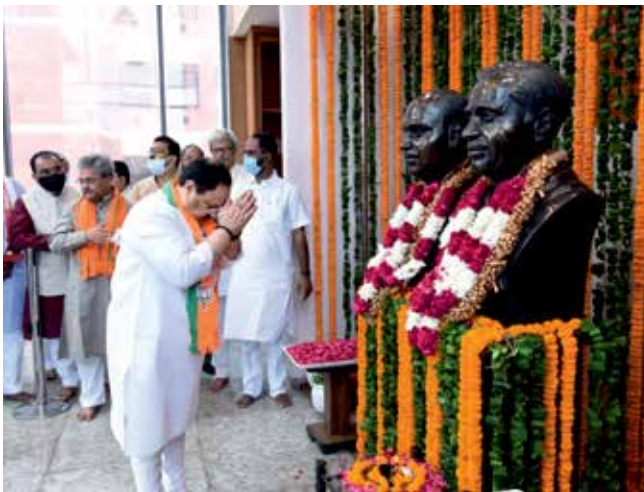
BJP National President Shri JP Nadda paying floral tributes to Pt. Deendayal Upadhyay on his jayanti at BJP central office in New Delhi