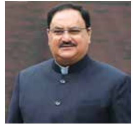
JAGAT PRAKASH NADDA