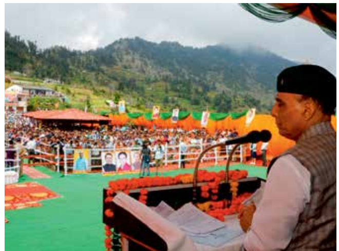
Union Defence Minister Shri Rajnath Singh addressing a gathering after unveiling the statue of Great Freedom Fighter Veer Chandra Singh Garhwali at Peethsain in Uttarakhand