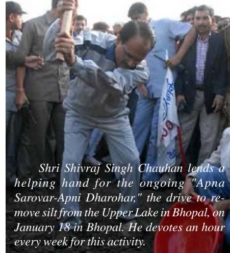
Shri Shivraj Singh Chouhan lends a helping hand for the ongoing "Apna Sarovar-Apni Dharohar," the drive to remove silt from the Upper Lake in Bhopal, on January 18 in Bhopal. He devotes an hour every week for this activity.

Madhya Pradesh Chief Minister and the leader of the masses, Shri Shivraj Singh Chouhan has ensured that people consider him as a common man instead of a Chief Minister. During a function while celebrating Makar Sankranti in Bhopal on 14 January he took serious note of the folk dancers who presented a song highlighting him as a king of Madhya Pradesh. He openly declared that he was simply a common man and Sevak (server) to the common people. He said the song should be repeated by making necessary changes in it. The Kala Pathak troupe which has presented the folk song terming the Chief Minister as Raja Hai Shivraj , later, on the objection of the Chief Minister, immediately changed the song and once again sung it with workings - Raja Nahin Sevak Hai Shivraj . Shri Chouhan likes people call him Shivraj Bhaiya , Sevak or Mama . Whenever he addresses any public meeting in rural areas, he publicly announces that he was Bhaiya for the villagers and Mama for the girls. For this amiable character he has now become as a role model for many of his ministerial colleagues and common people of the state.