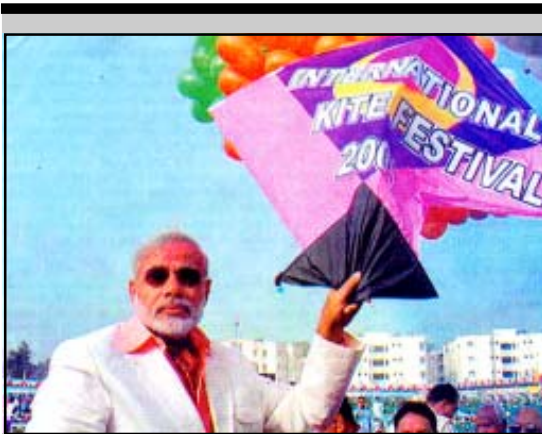
Shri Narendra Modi participating in the International Kite Festival 2009 held in Ahmedabad (Gujarat).

It is important to note that the agitation of the BJP, which was launched on January 1, entered its third phase on 12 January with several senior leaders of the party courting arrest in different parts of Uttar Pradesh. ■