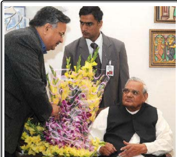
Courtesy call: Chhattisgarh Chief Minister Shri Raman Singh meets the former Prime Minister, Shri A.B. Vajpayee, at his residence in New Delhi.

"People vote for development and the behaviour of the Chief Minister, the Ministers and all other elected representatives towards the people is equally important. No one can afford to be arrogant to his voter. This is the spirit of democracy," he added. ■ (FOC)