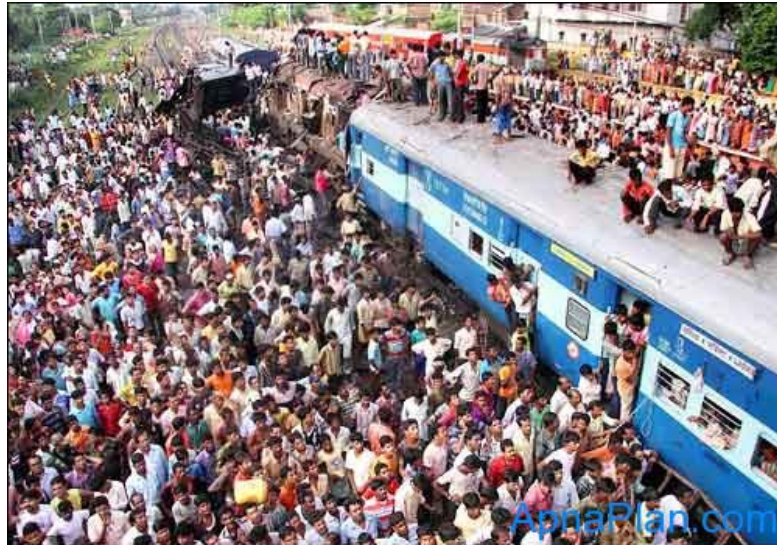
Number of Causalities in Train Accidents

surprise to large majority of Indians who have witnessed the milking of railways for petty gains at the cost of passenger safety and amenities under the Congress led UPA rule. Recently, the committee headed by Anil Kakodkar, chairman, Atomic Energy Commission said in its report, "The financial position of the railways is at the brink of collapse unless some concrete measures are taken". Besides, another panel set for modernization of the railways, led by Sam Pitroda, chairman of the National Knowledge Commission, said, "India suffers from a severe and chronic under-investment in railway infrastructure". In this backdrop the recent Railway Budget has