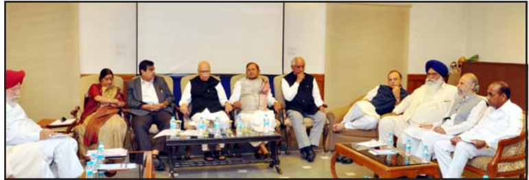
NDA floor leaders meeting at Shri L.K. Advani's residence at 30, Prithviraj Road on March 11, 2012