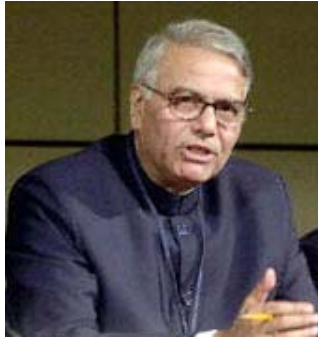
Statement issued on March 16, 2012 by Former Union minister of Finance and Lok Sabha MP Shri Yashwant Sinha on Union budget 2012-13

The Fiscal Deficit for the FY 2011-12 has been put at 5.9 percent. There is an underestimation of the subsidy figure. The final figures may even be more disturbing. He had an opportunity to take steps to enhance economic activity, increase the size and volume of Indian economy, raise higher revenues from higher economic activities and correct the fiscal deficit. He has chosen a retrograde method. He has presented a Budget with a high dose of taxation. Never in recent history have taxes been increased on the tax payer to the level as this Budget has increased them. Excise duties have been increased by 2 percent across the board. All services except the exempted ones have been brought in the Service Tax. Service Tax has been increased from 10 to 12 percent. The rebate in the Direct Taxes is most minimal. Eventually, after the Direct Tax Code, when the changed structure of taxation comes into force, even these may disappear.