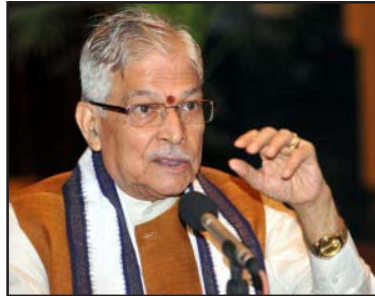
Synopsis of the speech delivered by Dr. Murli Manohar Joshi in Lok Sabha on March 13 on General Budget 2013-14.

The Government want to show that its GDP is improving. The growth in GDP itself does not signal the betterment of the standard of life. It may be merely an index. It is not the indication of inclusive and sustainable development. The growth should not be confined to the growth of the GDP. There are some other indicator and monitor of the growth which have not been mentioned here. Here the growth is without jobs, growth without health, growth without education. It is just an eyewash where figures have been fudged. Nowhere in the budget we find any reference to the culture or values. If the Government really wants the progress of the country, it should not go for a hackneyed model. Here no Washington consensus or a G-formula or a G-8 formula will work.