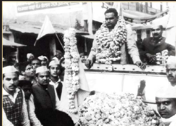
Shri Atal Bihari Vajpayee leading a grand procession during Jansangh days