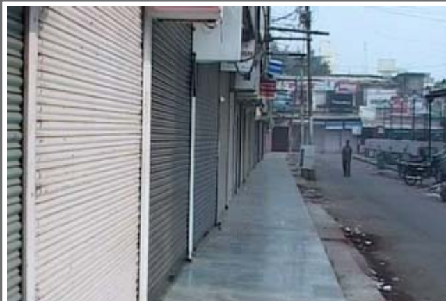
BJP supported nationwide 'Bharat Bandh' against FDI in retail