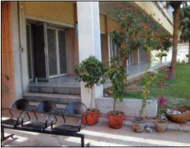
Dr. Bhimrao Ambedkar's residence in New Delhi