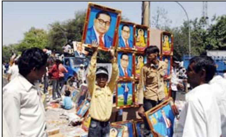
A vender selling photo frames of Dr. Bhimrao Ambedkar

Dalit activists have identified four pilgrimage centres related to Ambedkar. The first is at Mhow, his birthplace, and the second at Chaityabhoomi on Dadar beach where he was cremated. The third is the famous Deekshabhoomi in Nagpur where Ambedkar