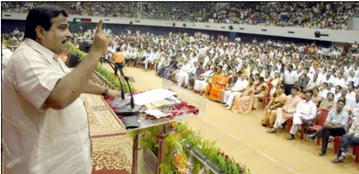
BJP National President Shri Nitin Gadkari addressing a huge gathering at Netaji Indoor Stadium, Kolkata

The BJP president blamed the Centre for allowing import of "rotten wheat at Rs 19.50 a kg, whereas local wheat was sold for