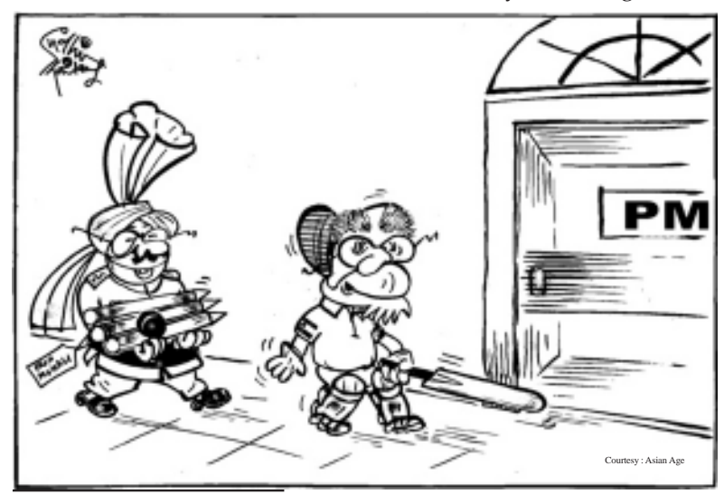
April 16-30, 2011 O 14

In fact, by taking the initiative to invite both Pakistan President Asif Zardari and Prime Minister Sved Yousuf Raza Gilani to witness the semifinal Dr. Manmohan Singh tried to hit two birds with one stone: to make yet another attempt to engage Pakistan in unending dialogue process and, as some reports suggest and some people feel, to divert the attention of the people from the perennial embarrassment UPA was encountering because of innumerable scams government is neck deep and the uncharitable comments it had to swallow in different courts on its acts of commission and omission in dealing with various cases of corruption.