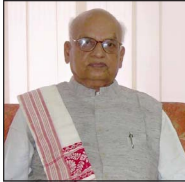
27 May 1928 - 06 June 2015