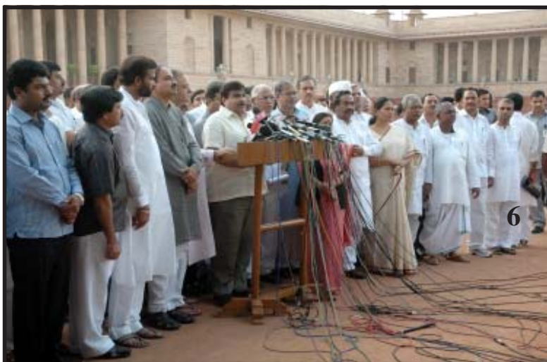
BJP submits Memo to President