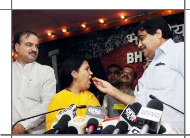
Uma Bharti reinducted in BJP