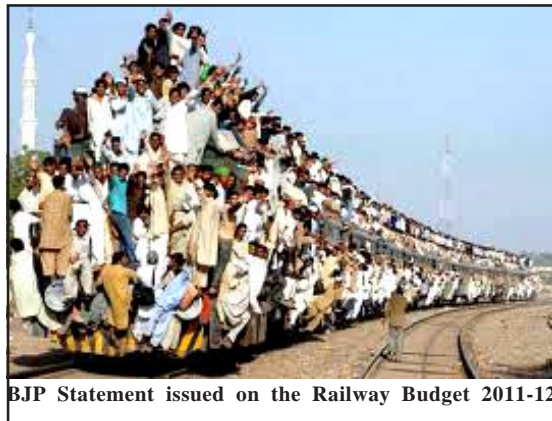
BJP Statement issued on the Railway Budget 2011-12

The Railway Budget presented by the Railway Minister is symptomatic of the dismal state of this government. Its larger approach is to do nothing. It has run out of ideas. The Railway finances and performance are in a mess. No significant steps have been taken to strengthen the tracks and improve the security apparatus of the Indian Railways. These steps taken by the Union Railway Ministry during the NDA government, had helped the turnaround story of the Railways. It could strengthen the tracks, load higher freights and longer trains. The cash surplus of the Indian Railways, which was Rs. 25,000 crores in 2007-08 is just Rs. 1,328 crores. The Railway is depending upon extensive