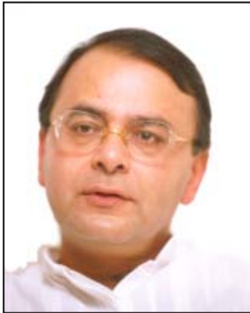
Synopsis of the speech made by Shri Arun Jaitley, Leader of Opposition in Rajya Sabha on February 22, 2011 on the Motion of Thanks on the President's Address.

Post-liberalization India has success stories. The areas like telecom and highways have great success. But we find that we have outsourced it in those hands where integrity quotient was lacking. These are two sectors which have precisely got discredited the most, notwithstanding their success. The inflation affects the common man,