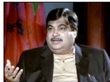
Press statement by BJP National President Shri Nitin Gadkari on Union Budget 2011-12 on 28 February 2011

The budget is silent on the rampant corruption and menace of black money. The personal income tax relief is cosmetic and has ignored the plight of working women. The budget is unrealistic for trade and industry and is insensitive to the farmers and unemployed youth as well as the under developed states