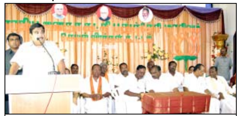
BJP National President, Shri Nitin Gadkari's press conference in Pondicherry on April 12, 2010

ndia's population is over 100 crores. This is likely to Lincrease to 150-180 crores in 2050. The need of food grain and water will be tremendous. It is becoming necessary to develop projects, which will help to increase food production & the flow of water.