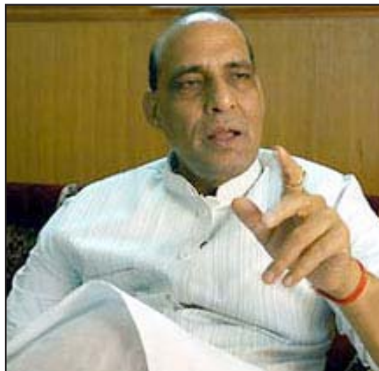
Press statement issued on April 8, 2011 by former BJP President, Shri Rajnath Singh at Kannur.

made its intentions clear by working towards a consensus to legislate Lokpal Bill during its tenure whereas the UPA is keen to dilute the entire Bill than to work towards a consensus. The BJP demands the Government to incorporate necessary changes to give the Jan Lokpal Bill more teeth before it is introduced in Parliament. The