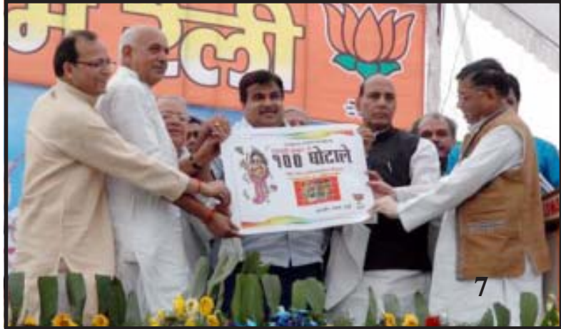
BJP Mahasangram rally in Meerut (Uttar Pradesh)