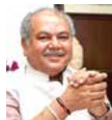
Narendra Singh Tomar