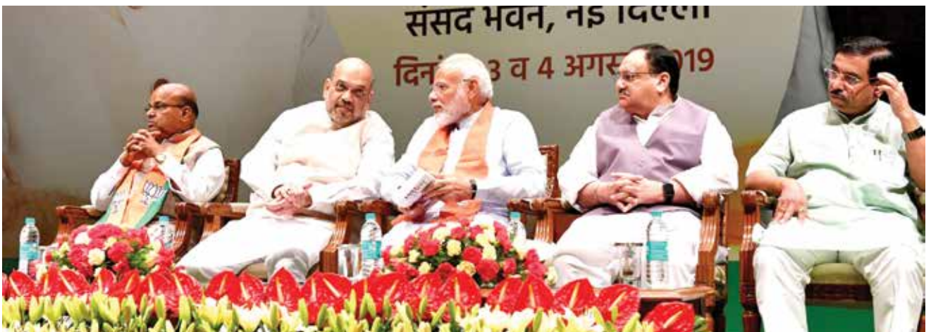
PM Shri Narendra Modi along with BJP President Shri Amit Shah, Working President Shri JP Nadda and others at 'Sansad Karyashala' in Parliament House, New Delhi. This is a great forum for Party MPs to extensively engage on issues pertaining to the nation and our organisation said PM Shri Modi.