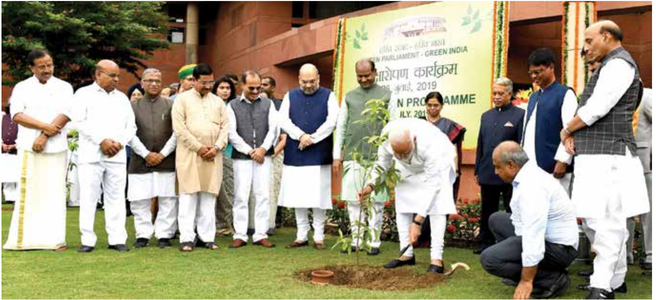
Prime Minister Shri Narendra Modi planting the sapling with other dignitaries at the tree plantation drive organised by the Lok Sabha Secretariat at Parliament House Premises in New Delhi