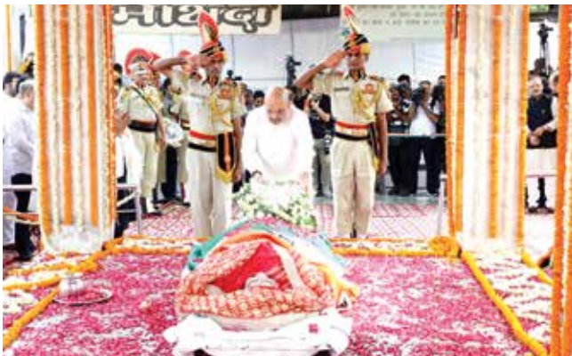
BJP National President & Union Home Minister Shri Amit Shah paying his last respects to Smt. Sushma Swaraj at the funeral ceremony in New Delhi