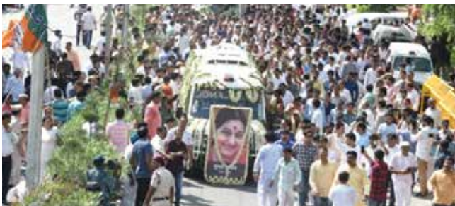
Huge crowd at Smt. Sushma Swaraj's last journey in New Delhi