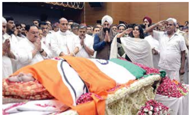
BJP Working President Shri JP Nadda, Union Minister Shri Rajnath Singh and others paying last respects to Smt. Sushma Swaraj at Party Headquarters in New Delhi