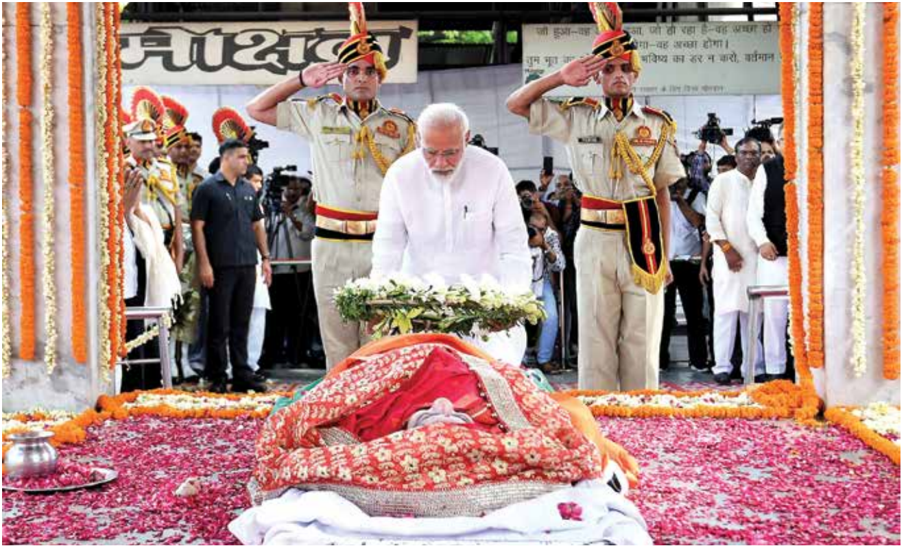
Prime Minister Shri Narendra Modi paying his last respects to the former Union Minister Smt. Sushma Swaraj at the funeral ceremony in New Delhi