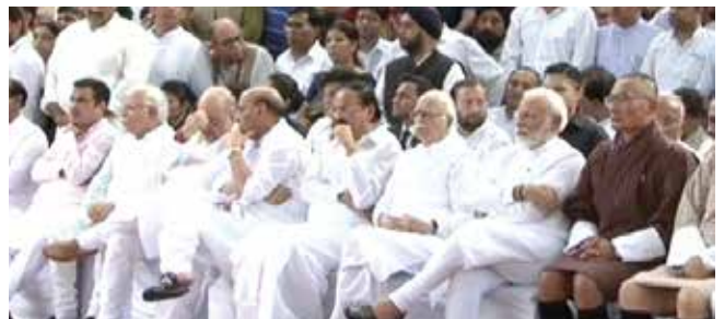
PM Shri Narendra Modi flanked by BJP President Shri Amit Shah, Senior Leader Shri LK Advani and others at funeral ground in New Delhi