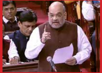
PARLIAMENT IS FULLY ENTITLED TO TAKE ANY DECISION WITHIN THE INDIAN TERRITORY