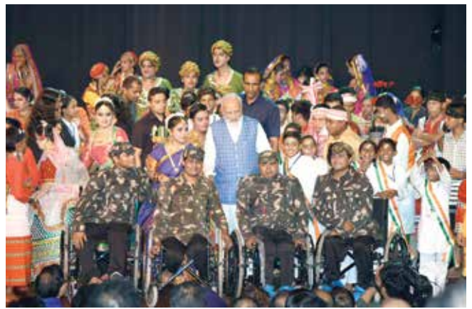
PM Shri Narendra Modi at the Cultural Event "Divya Kala Shakti" Witnessing Ability in Disability organised by the DEPwD, Ministry of Social Justice & Empowerment, New Delhi