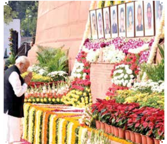
Prime Minister Shri Narendra Modi paying homage to the martyrs of the 2001 Parliament attack, at Parliament building in New Delhi