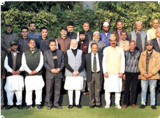
Prime Minister Shri Narendra Modi with the newly elected Sarpanches of Panchayats from Jammu and Kashmir in New Delhi