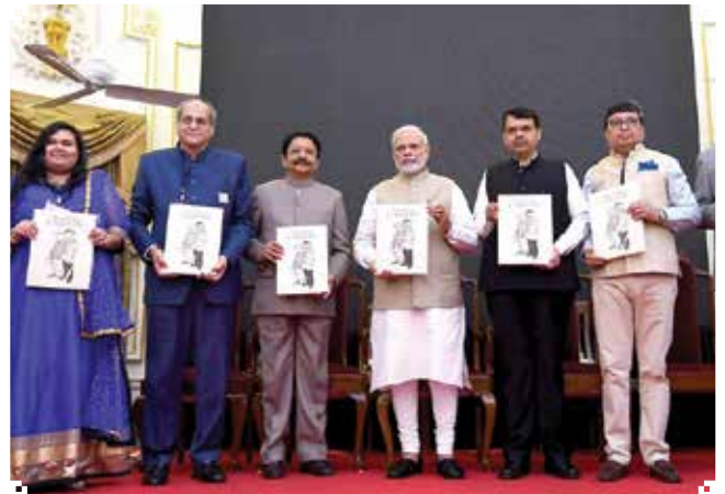
PM Shri Narendra Modi along with Maharashtra Governor Shri C. Vidyasagar Rao, CM Shri Devendra Fadnavis and others releasing a book titled 'Timeless LAXMAN' in Mumbai, Maharashtra