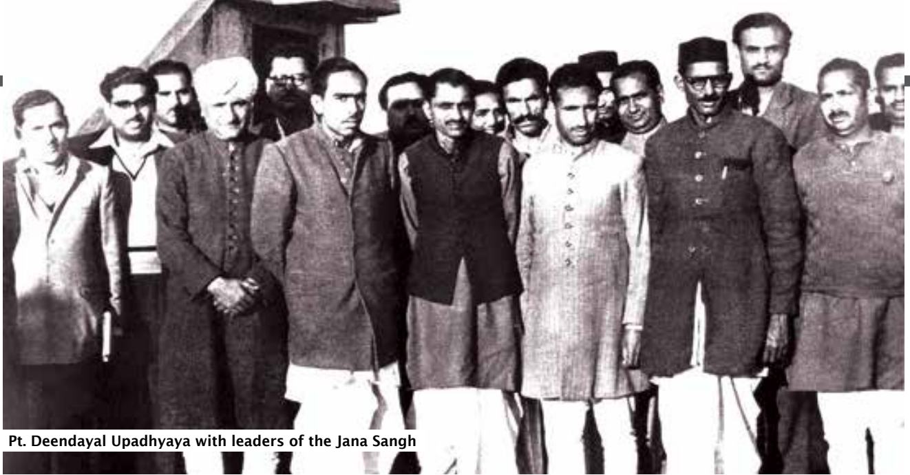
Pt. Deendayal Upadhyaya with leaders of the Jana Sangh

methodology has made socialism an anathema to many people, and has made it incompatible both with nationalism and democracy.