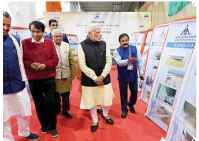
Prime Minister Shri Narendra Modi at the inauguration of the new Airport Complex at Bamrauli Airport in Prayagraj, Uttar Pradesh