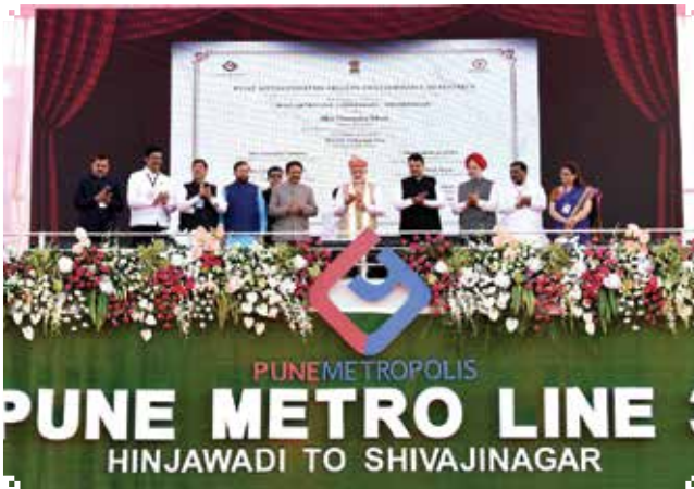
Prime Minister Shri Narendra Modi flanked by Maharashtra Governor Shri C. Vidyasagar Rao, CM Shri Devendra Fadnavis and others lays the foundation stone of Metro Phase 3 in Pune, Maharashtra