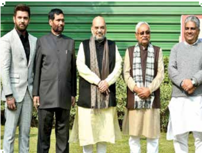
BJP National President Shri Amit Shah flanked by Bihar CM Shri Nitish Kumar, BJP National General Secretary Shri Bhupendra Yadav, Union Minister Shri Ramvilas Paswan and others after a meeting to strengthen the NDA in Bihar