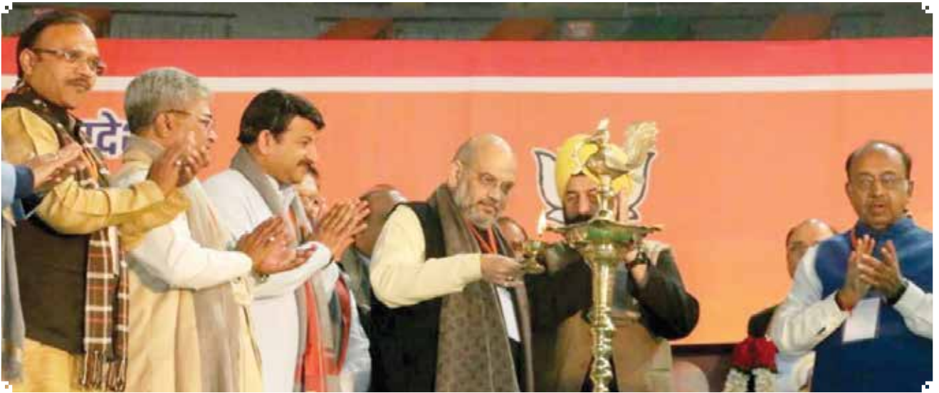
BJP National President Shri Amit Shah flanked by other senior leaders of Delhi BJP lighting the lamp at the massive Booth Sammelan organised by Delhi State BJP at IG Stadium, New Delhi