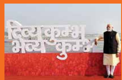
PM INAUGURATES DEVELOPMENT PROJECTS IN PRAYAGRAJ