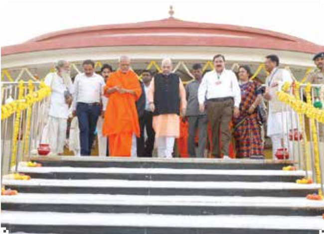
BJP National President Shri Amit Shah visiting Arsha Vidya Mandir in Rajkot, Gujarat