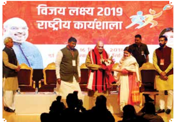
BJP National President Shri Amit Shah being welcomed by BJYM National President Smt. Poonam Mahajan at the National Workshop 'Vijay Lakshya-2019' in New Delhi. BJP National General Secretary (Org.) Shri Ram Lal, BJP National General Secretary Shri Muralidhar Rao and others also seen at the dais.