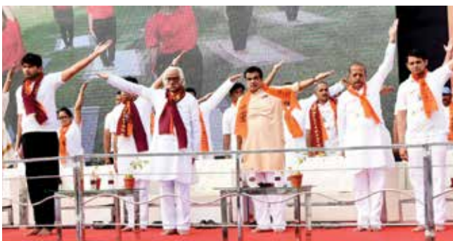
Union Transport Minister Shri Nitin Gadkari along with others celebrating the International Yoga Day in Nagpur, Maharashtra