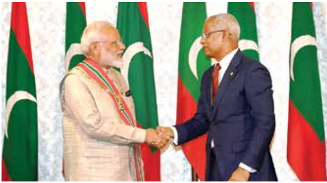
President of Maldives Mr. Ibrahim Mohamed Solih presenting Maldives Highest Honour Order of the Distinguished Rule of Nishan Izzuddeen to PM Shri Narendra Modi in Male, Maldives