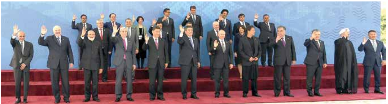
PM Shri Narendra Modi with other SCO leaders in a group photograph at the Shanghai Cooperation Organization (SCO) Summit in Bishkek, Kyrgyz Republic