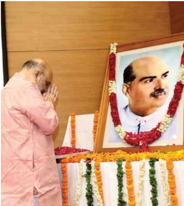
BJP National President Shri Amit Shah paying tributes to Dr. Shyama Prasad Mookerjee on his Balidan Divas at BJP Headquarters in New Delhi