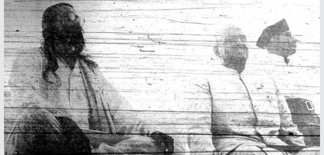
Dr. Mookerjee with Shri Guruji at the RSS Annual Function in Calcutta, 1952. Also seen in the picture is Shri Eknath Ranade

After this occasion (May, 1940) I had many opportunities of meeting him and exchanging views on the various