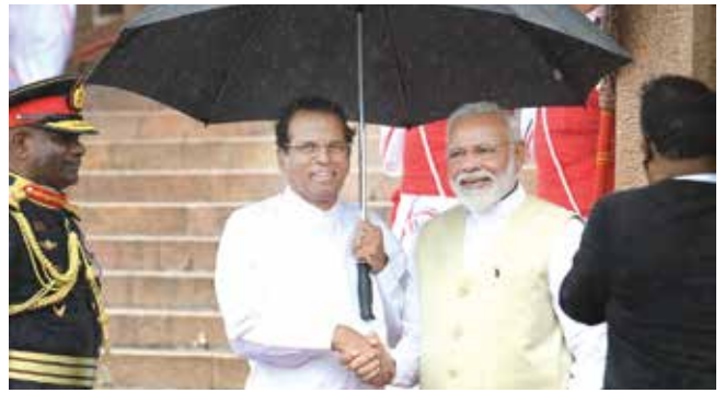
PM Shri Narendra Modi and the President of Sri Lanka Mr. Maithripala Sirisena at the ceremonial reception in Colombo, Sri Lanka