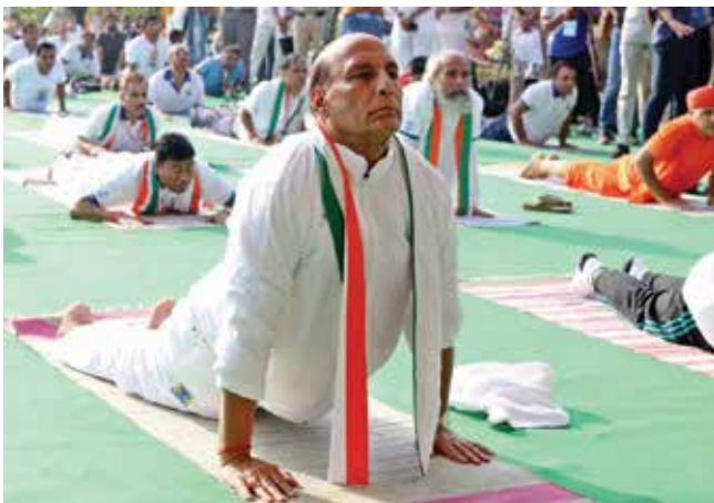
Union Defence Minister Shri Rajnath Singh performing Yoga on International Yoga Day in New Delhi