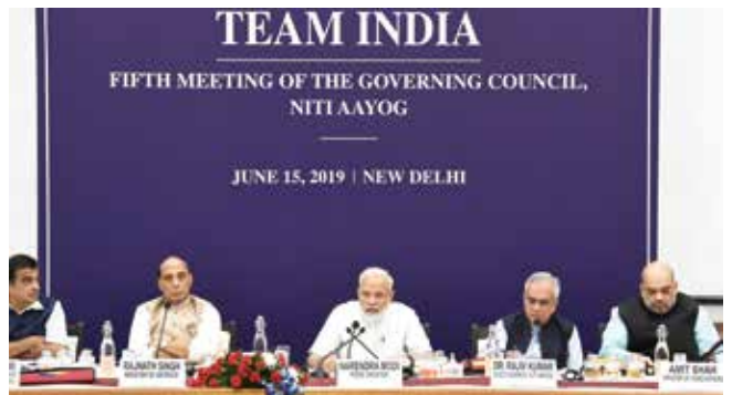
PM Shri Narendra Modi chairing the fifth meeting of the Governing Council of NITI Aayog in New Delhi