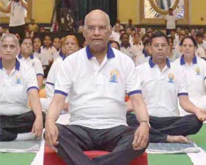
President Shri Ram Nath Kovind said, "I'm happy that like previous years, we are celebrating Yoga Day this year too. It's not just an event, but a way to make yoga an integral part of our life".