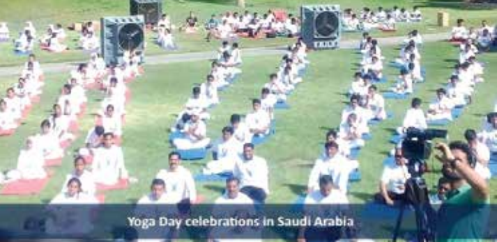
Yoga Day celebrations in Saudi Arabia