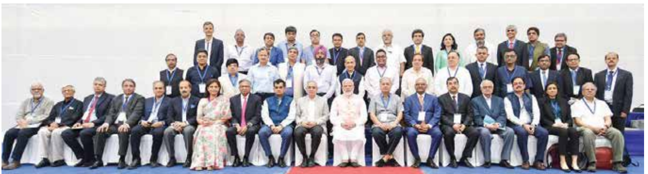
PM Shri Narendra Modi along with other experts in a group photograph after a fruitful interaction with economists and experts on the themes of macro-economy and employment, agriculture and water resources, exports, education, and health in New Delhi