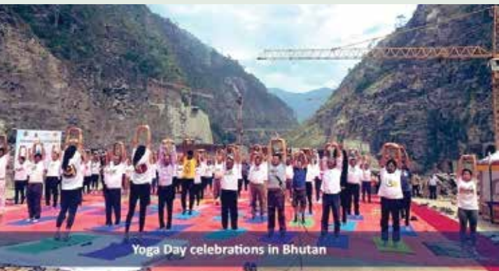
Yoga Day celebrations in Bhutan