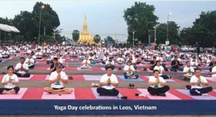
Yoga Day celebrations in Laos, Vietnam