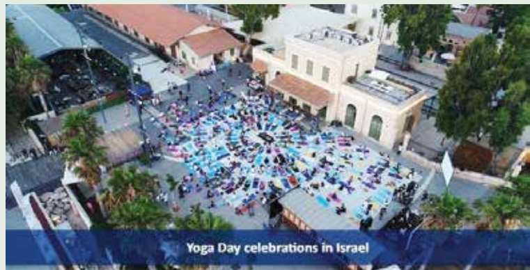
Yoga Day celebrations in Israel