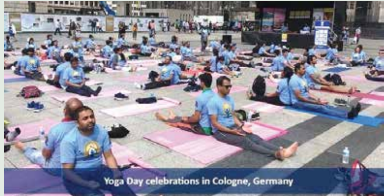
Yoga Day celebrations in Cologne, Germany