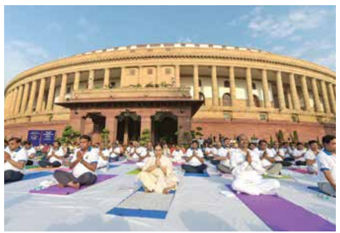
Lok Sabha Speaker Shri Om Birla along with other members of parliaments performing Yoga in front of Parliament Building in New Delhi on International Yoga Day