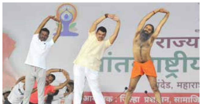
Maharashtra CM Shri Devendra Fadnavis along with Yoga guru Baba Ramdev performed yoga in Nanded, Maharashtra