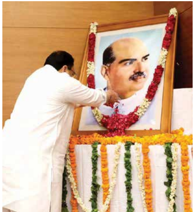
BJP National Working President Shri JP Nadda paying floral tributes to Dr. Shyama Prasad Mookerjee on his Balidan Divas at BJP Headquarters in New Delhi