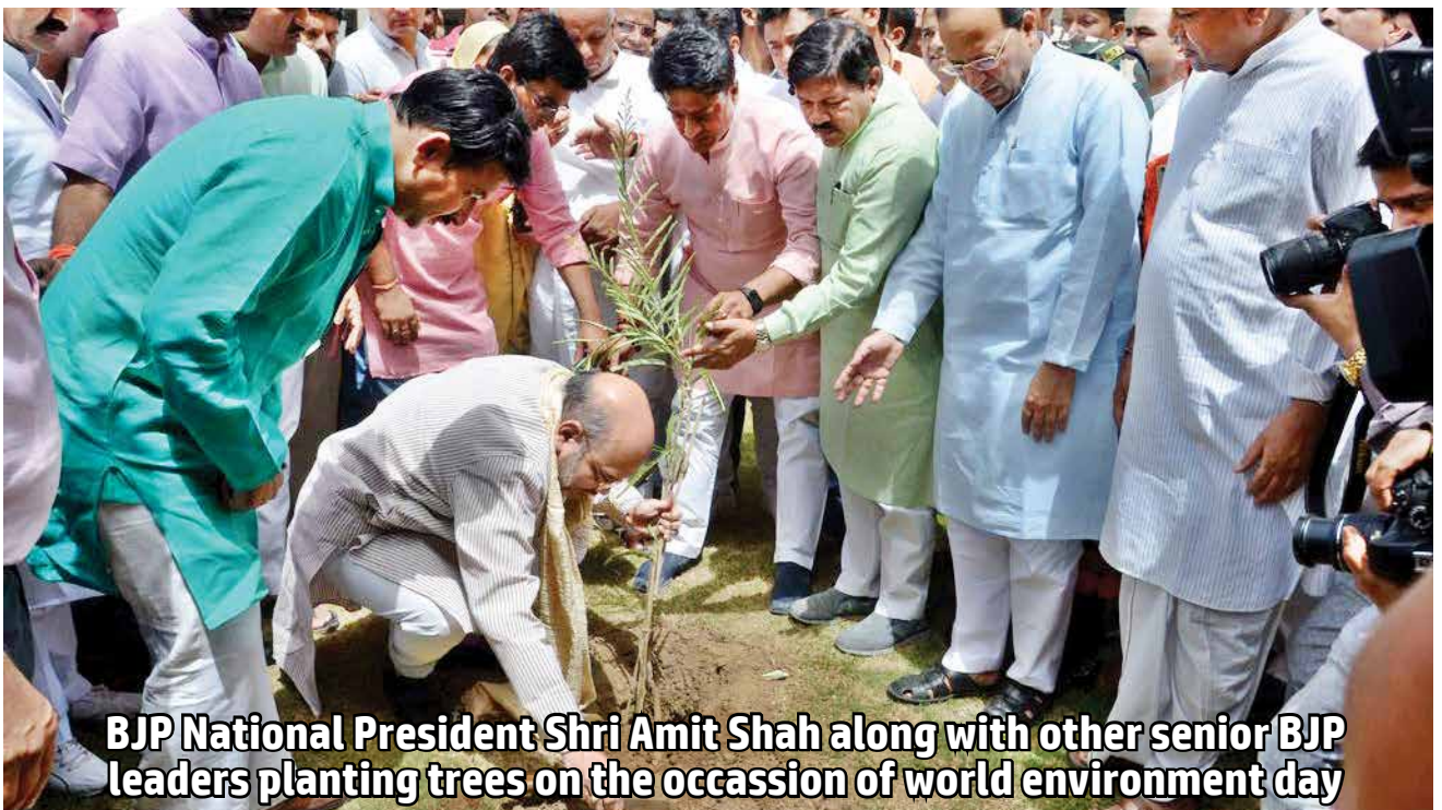
BJP National President Shri Amit Shah along with other senior BJP leaders planting trees on the occasion of world environment day