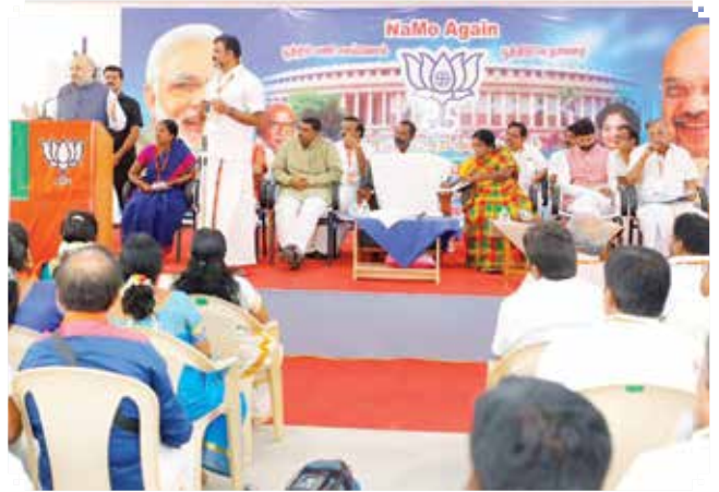
BJP National President Shri Amit Shah addressing a review meeting along with other BJP leaders at Madurai, Tamil Nadu