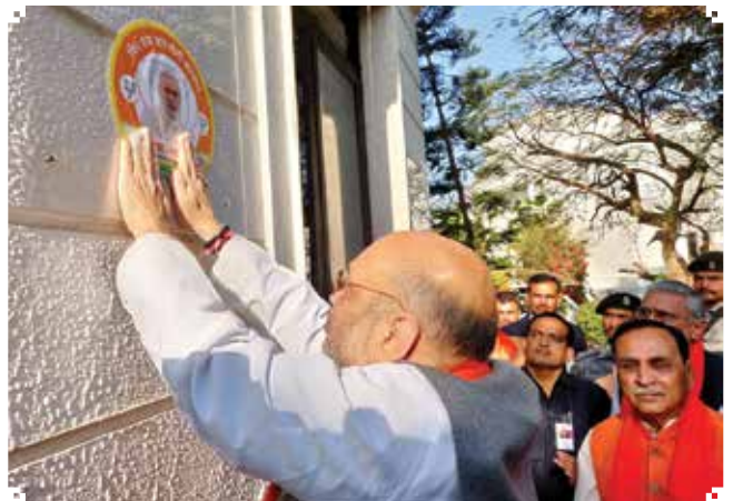
BJP National President Shri Amit Shah flanked by Gujarat CM Shri Vijay Rupani and others launching 'Mera Parivar Bhajapa Parivar' campaign by pasting a sticker on the wall of his residence in Ahmedabad, Gujarat