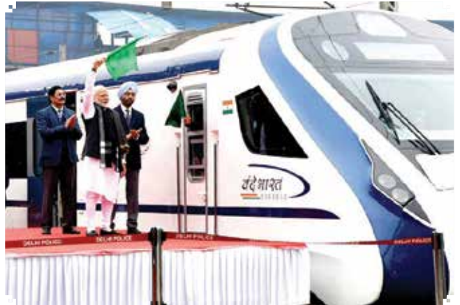
PM Shri Narendra Modi flagging off the first Semi High Speed Train "Vande Bharat Express" at New Delhi Railway Station