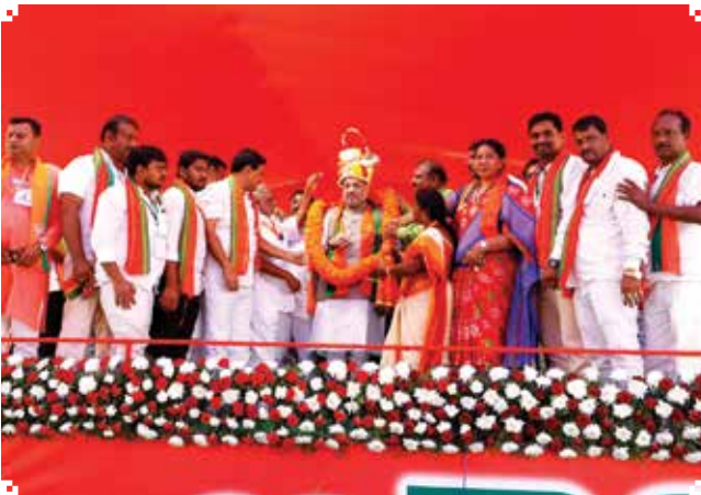
The Andhra Pradesh BJP welcomes BJP National President Shri Amit Shah at the Shakti Kendra Pramukh Sammelan in Rajahmundry, Andhra Pradesh