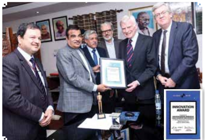
Union Minister of Road Transport & Highways, Shipping and Water Resources, River Development & Ganga Rejuvenation Shri Nitin Gadkari was presented with the innovation award by Global NCAP for Indian Government's legislative action for improving vehicle safety in New Delhi