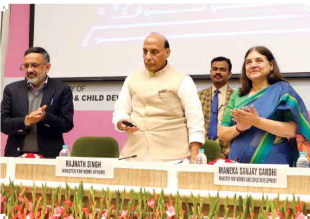
Union Home Minister Shri Rajnath Singh flanked by Union Minister Smt. Maneka Gandhi and others launching the Emergency Response Support System (ERSS) in New Delhi. Now persons in distress can dial a pan-India number: 112. Under this system, all the states are setting up a dedicated Emergency Response Centre, ERC