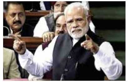
TODAY, INDIA'S VOICE IS HEARD ON GLOBAL FORA: MODI