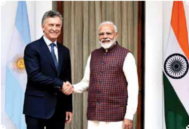
PM Shri Narendra Modi with the President of the Argentine Republic Mr. Mauricio Macri at Hyderabad House in New Delhi