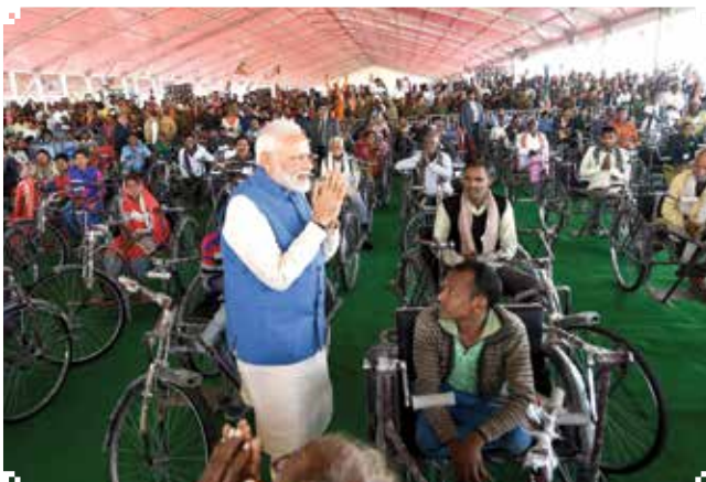
PM Shri Narendra Modi interacting with the Divyangans at an event in Varanasi, Uttar Pradesh