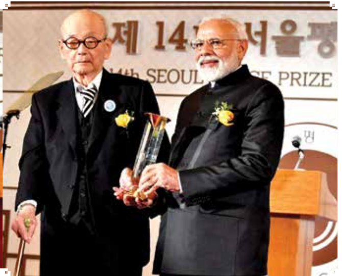
PM Shri Narendra Modi receives Seoul Peace Prize 2018 for his contribution to international cooperation and fostering global economic growth