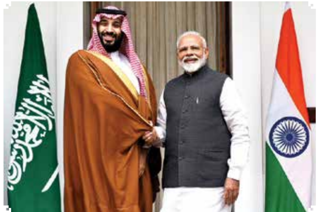
PM Shri Narendra Modi with the Crown Prince, Vice President of the Council of Ministers of Defence of the Kingdom of Saudi Arabia Prince Mohammed Bin Salman Bin Abdulaziz Al-Saud at Hyderabad House in New Delhi