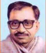
PT. DEENDAYAL UPADHYAYA

T he Political Development of the modern world has been influenced and shaped by the three concepts of nationalism, democracy and socialism. Chronologically, nationalism is the earliest, and socialism the latest. Taking Europe to be of representative character in this respect, we find that right from the thirteenth to the nineteenth century, its map was drawn and re-drawn according to national urges. Nationalism united the people and forced different united people and forced different principalities to forgo their autonomy in favour of a national government. It also differentiated one set of people from another, and slowly we find that national interests, rather than whims or wishes of an individual, increasingly guided the conduct of war and peace. As nations came to acquire a distinctive character, the form of government also became a matter of interest and controversy. When Alexander pope tried to summarily reject all controversies regarding form of government, he only exhibited his subconscious interest in the matter. He wrote :