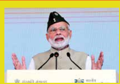
75TH ANNIVERSARY OF AZAD HIND GOVERNMENT