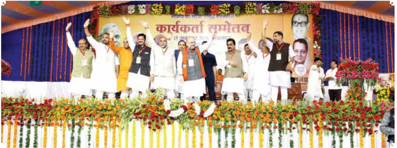
BJP National President Shri Amit Shah and other leaders waving at the gathering at the Booth Level Karyakarta Sammelan in Jabalpur, Madhya Pradesh