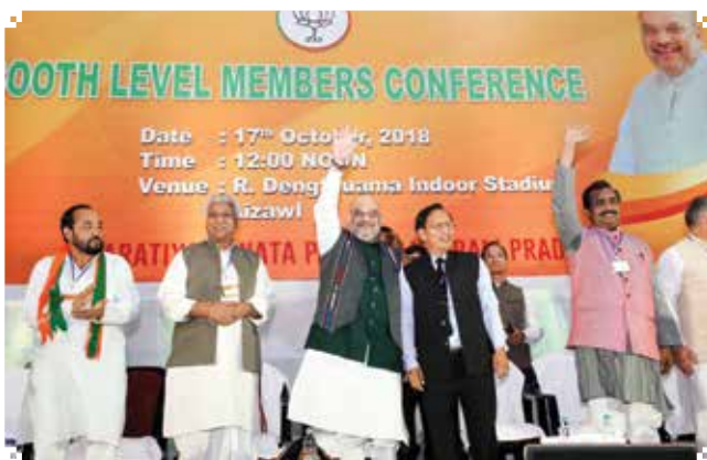
BJP National President Shri Amit Shah flanked by BJP National General Secretary (Org.) Shri Ramlal, National General Secretary Shri Ram Madhav and others receiving the greetings of karyakartas at the Booth Level Karyakarta Sammelan in Aizawl, Mizoram