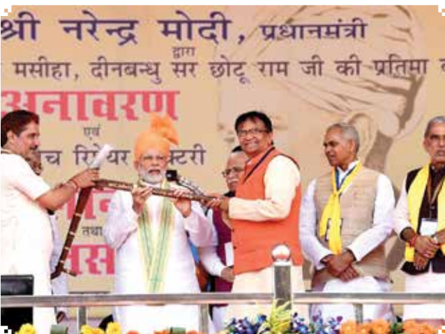
Haryana BJP welcomes PM Shri Narendra Modi with a plough at Sampla in Rohtak, Haryana