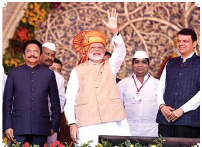
PM Shri Narendra Modi flanked by Maharashtra Governor Shri C. Vidyasagar Rao and CM Shri Devendra Fadanvis waving at the gathering in Shirdi, Maharashtra