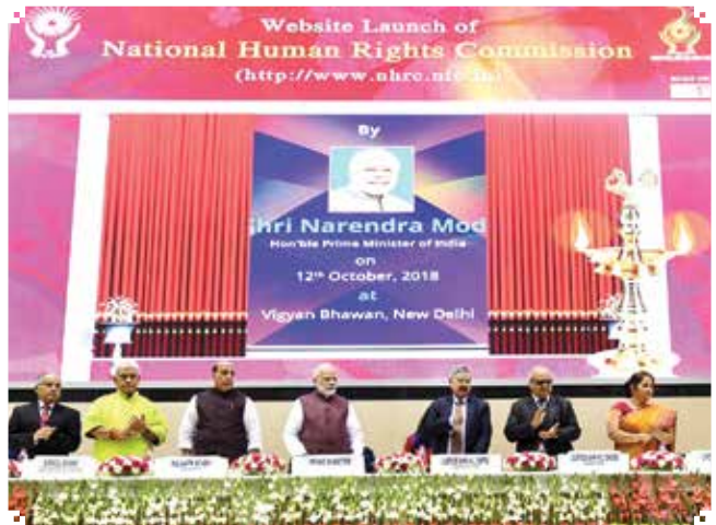
PM Shri Narendra Modi flanked by Union Ministers Shri Rajnath Singh, Shri Manoj Sinha and others inaugurating the Silver Jubilee Foundation Day function of the National Human Rights Commission in New Delhi