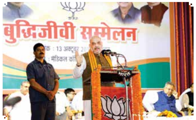
BJP National President Shri Amit Shah addressing an intellectual's meet in Raipur, Chhattisgarh. CM Dr. Raman Singh also seen on the dais