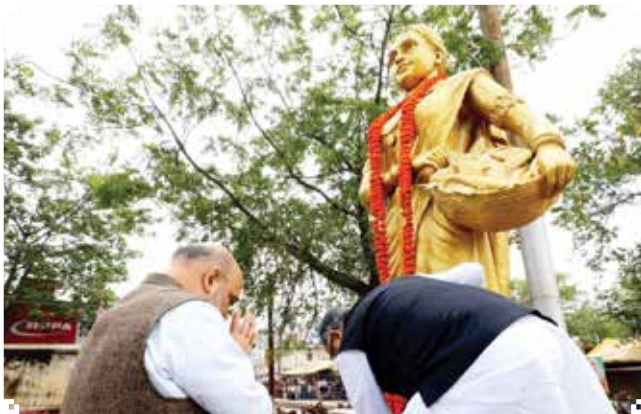
BJP National President Shri Amit Shah paying floral tributes to Bilasa Devi in Bilaspur, Chhattisgarh