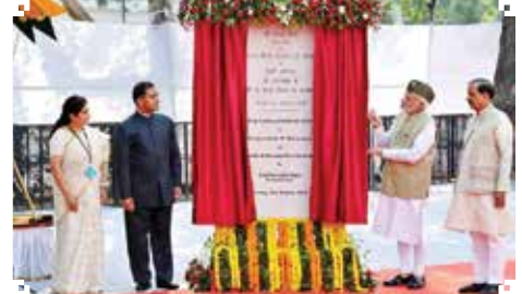
PM Shri Narendra Modi hoisting the National Flag to commemorate the 75th anniversary of formation of the Azad Hind Government and honouring the veterans at Red Fort, Delhi