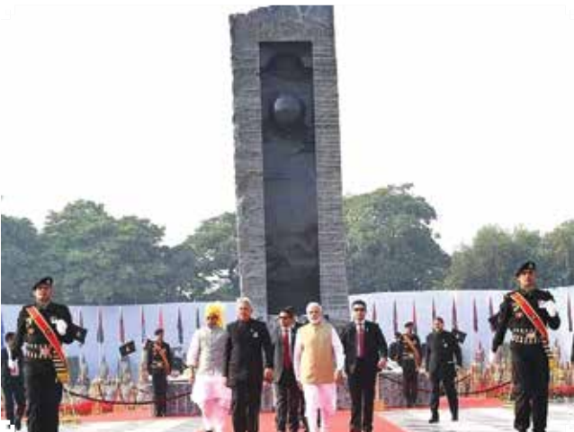
Prime Minister Shri Narendra Modi along with Union Home Minister Shri Rajnath Singh and others dedicates the National Police Memorial at Chanakypuri, New Delhi