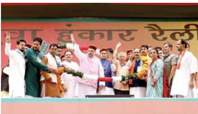
Senior BJP leaders of Himachal welcoming BJP National President Shri Amit Shah at Yuva Hunkar Rally, Kangra