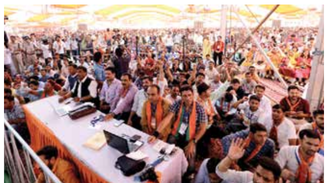
View of massive crowd at the Yuva Hunkar Rally in Kangra