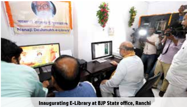
Inaugurating E-Library at BJP State office, Ranchi