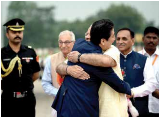
PM Shri Narendra Modi receiving Japan PM Mr. Shinzo Abe at Ahmedabad airport, Gujarat