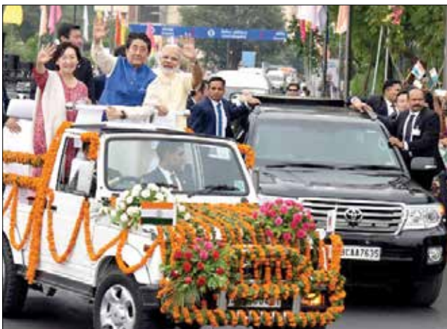
Prime Minister Shri Narendra Modi during the India Cultural Road Show organised in honour of the Prime Minister of Japan Mr. Shinzo Abe in Ahmedabad, Gujarat