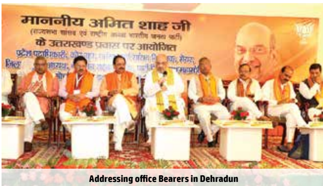
Addressing office Bearers in Dehradun