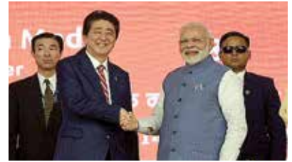
PM MODI AND JAPANESE PM ABE LAY FOUNDATION STONE FOR INDIA'S FIRST HIGH SPEED RAIL PROJECT