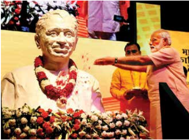
PM Shri Narendra Modi paying floral tributes to Pt. Deendayal Upadhyaya Ji on his birth anniversary in New Delhi