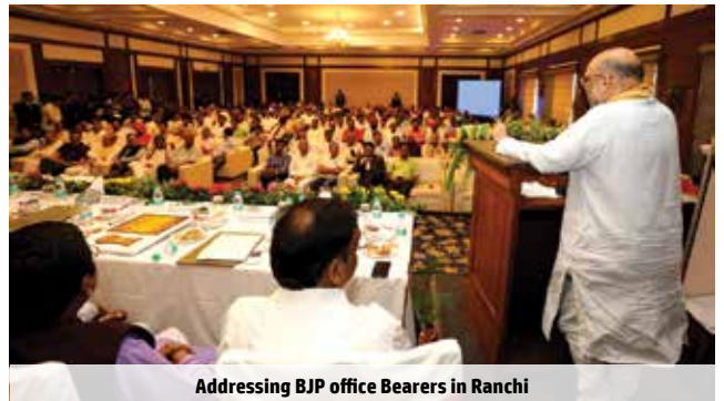
Addressing BJP office Bearers in Ranchi