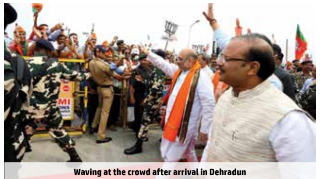
Waving at the crowd after arrival in Dehradun