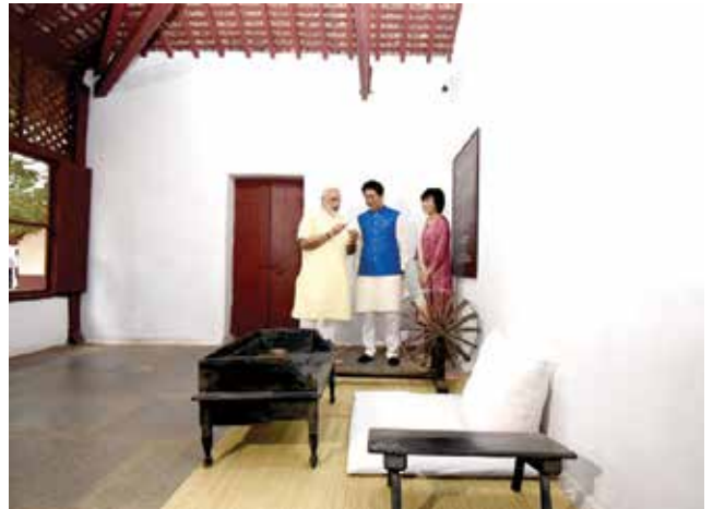
PM Shri Narendra Modi and the PM of Japan Mr. Shinzo Abe at Sabarmati Ashram, in Ahmedabad, Gujarat