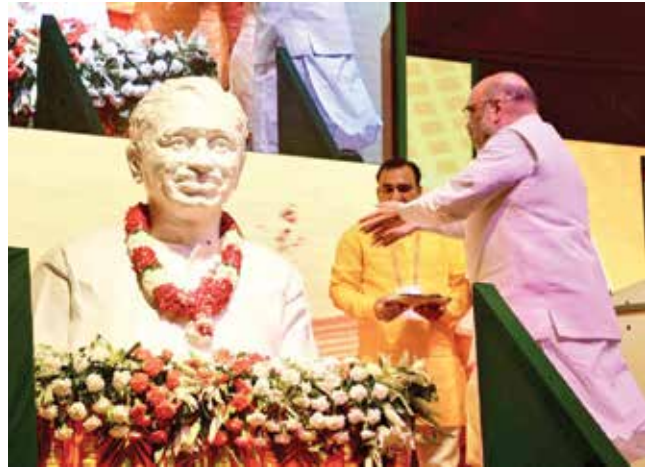
BJP National President Shri Amit Shah paying floral tributes to Pt. Deendayal Upadhyaya Ji on his birth anniversary in New Delhi