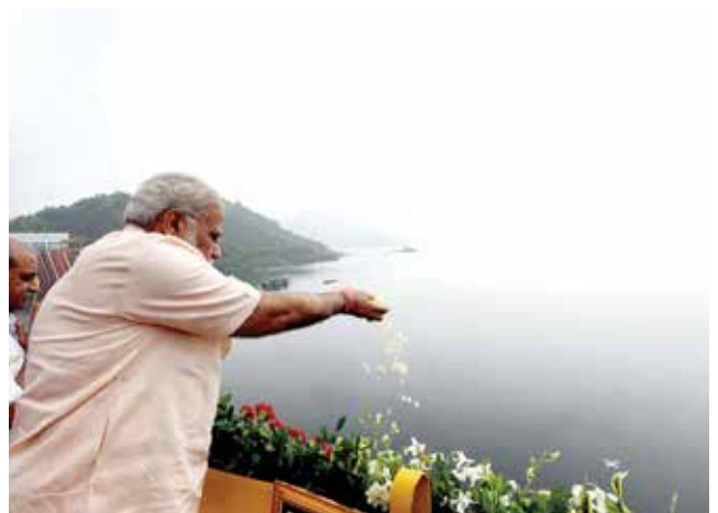
Prime Minister Shri Narendra Modi at the Sardar Sarovar Dam in Gujarat