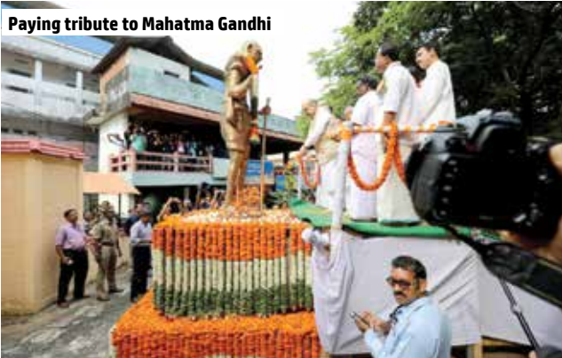
Paying tribute to Mahatma Gandhi