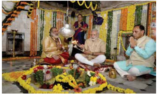
AT HATKESHWAR MAHADEV TEMPLE IN VADNAGAR