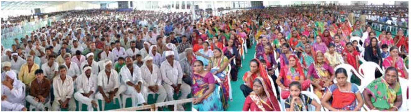
VIEW OF THE FARMERS RALLY IN DWARKA, WHERE PM SHRI NARENDRA MODI DEDICATED IMPORTANT DEVELOPMENT PROJECTS TO THE NATION