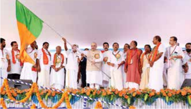
Flagging the Yatra