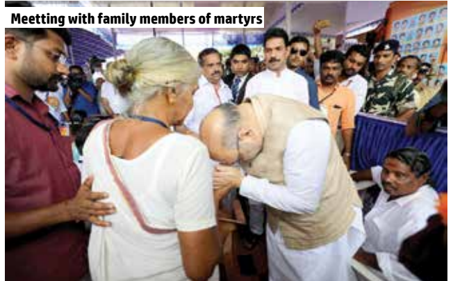
Meeting with family members of martyrs