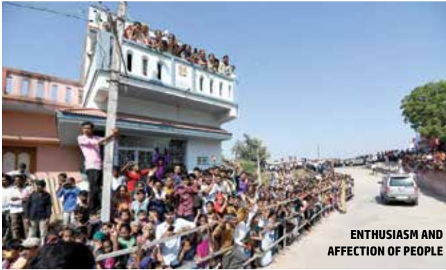
ENTHUSIASM AND AFFECTION OF PEOPLE