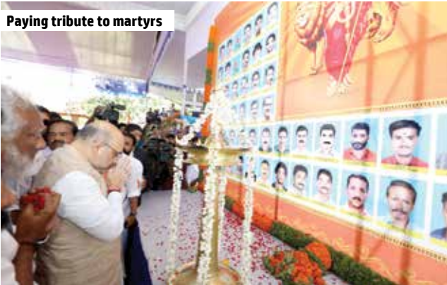
Paying tribute to martyrs