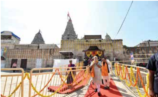
AT DWARKADHISH TEMPLE