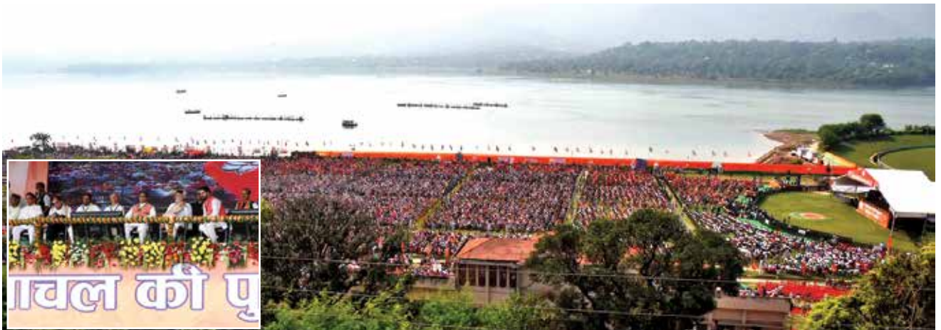
AFTER DEDICATING SEVERAL DEVELOPMENTAL PROJECTS PM SHRI NARENDRA MODI ADDRESSING A HUGE RALLY IN BILASPUR, H.P.