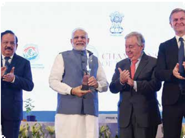
Prime Minister Shri Narendra Modi being presented the "Champions of The Earth" award by the Secretary General of the United Nations Mr. Antonio Guterres at a function in New Delhi