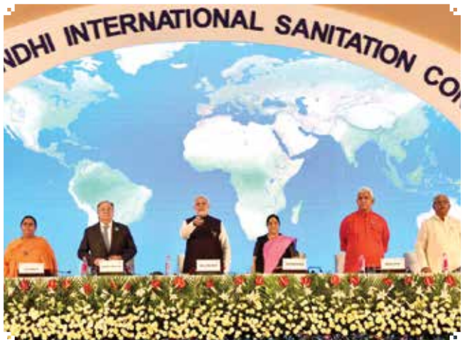
PM Shri Narendra Modi flanked by Union Ministers Smt. Sushma Swaraj, Shri Manoj Sinha, Sushri Uma Bharti and others inaugurating the Mahatma Gandhi International Sanitation Convention at Rashtrapati Bhavan, Delhi