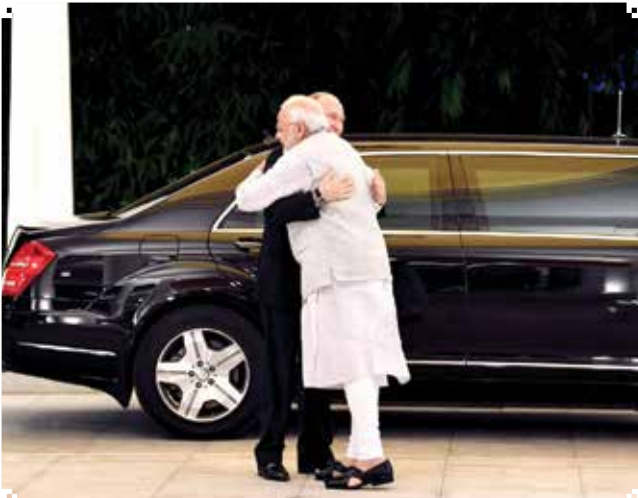
Prime Minister Shri Narendra Modi welcomes the President of Russian Federation Mr. Vladimir Putin in New Delhi