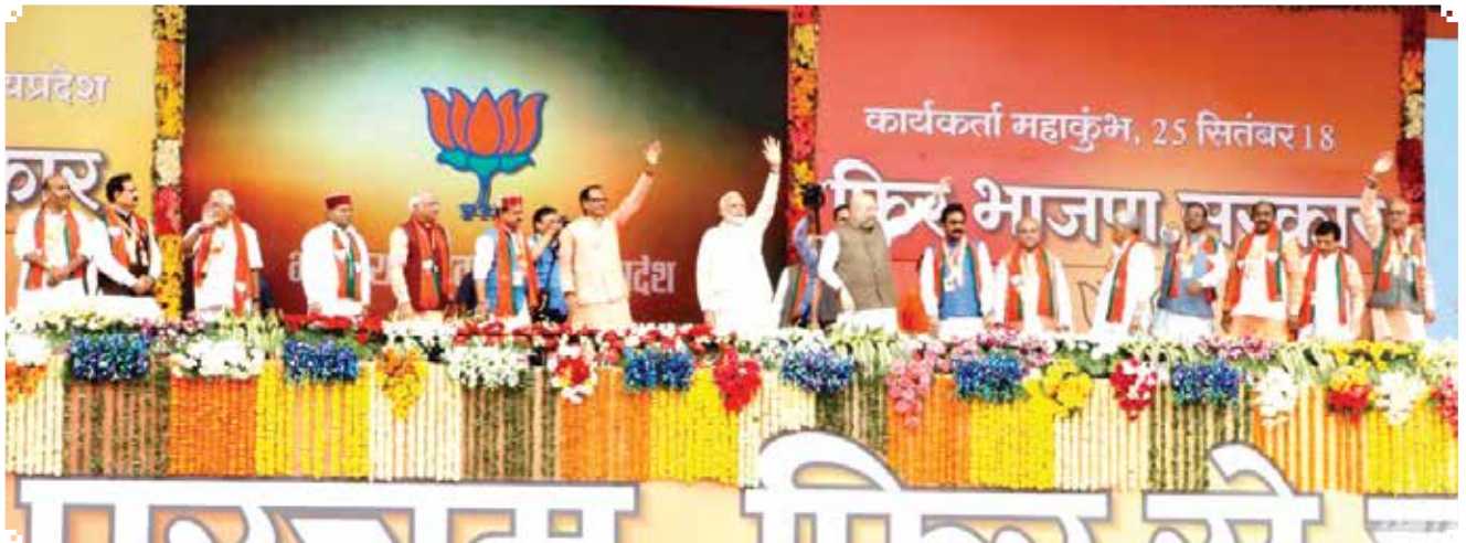
PM Shri Narendra Modi flanked by BJP National President Shri Amit Shah, MP CM Shri Shivraj Singh Chouhan and other senior leaders waving at the gathering in Karyakarta Mahakumbh held in Bhopal, Madhya Pradesh