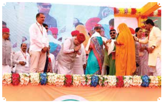
BJP National President Shri Amit Shah receiving the greetings of BJP karyakartas at the Ex-Servicemen Sammellan in Sikar, Rajasthan