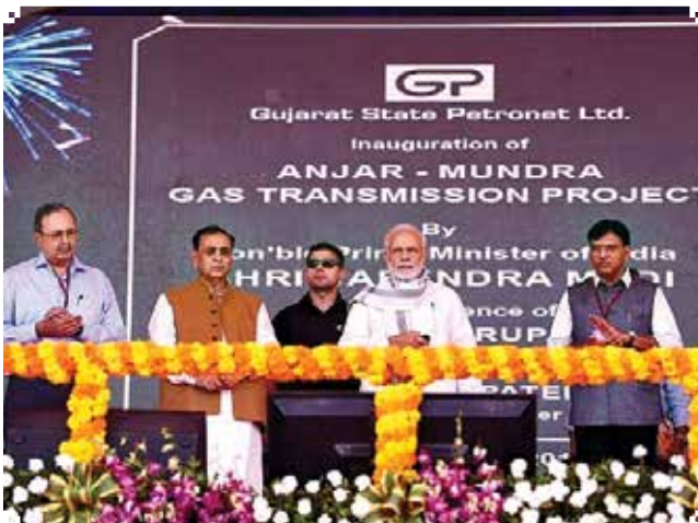
PM Shri Narendra Modi along with the Gujarat CM Shri Vijay Rupani and others inaugurating the Mundra LNG Terminal & Anjar - Mundra Gas Transmission Project in Anjar, Gujarat