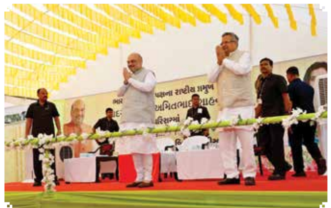
BJP National President Shri Amit Shah and Chhattisgarh CM Dr. Raman Singh during Gujarati Samaj Sammellan in Bhilai, Chhattisgarh