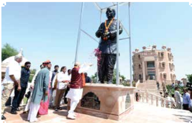
BJP National President Shri Amit Shah paying floral tribute to Pandit Deendayal Upadhyay after Inaugurating the Pt. Deendayal Upadhyay Memorial in Dhanakya, Jaipur (Rajasthan)