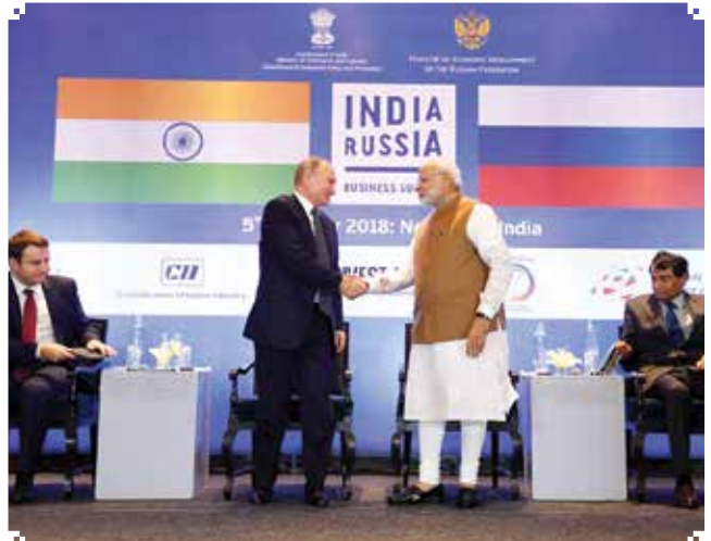
Prime Minister Shri Narendra Modi and the President of Russian Federation Mr. Vladimir Putin at the India-Russia Business Summit in New Delhi