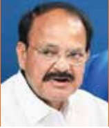
M VENKAIAH NAIDU

Lal Bahadur Shastri's stress on character and moral strength acquire special significance