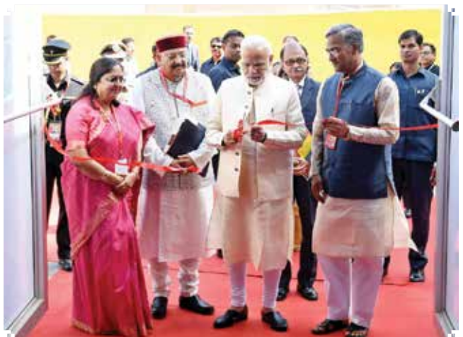
Prime Minister Shri Narendra Modi along with the Uttarakhand CM Shri Trivendra Singh Rawat and others inaugurating the 1st Uttarakhand Investors Summit at Dehradun