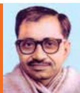
PT. DEENDAYAL UPADHYAYA