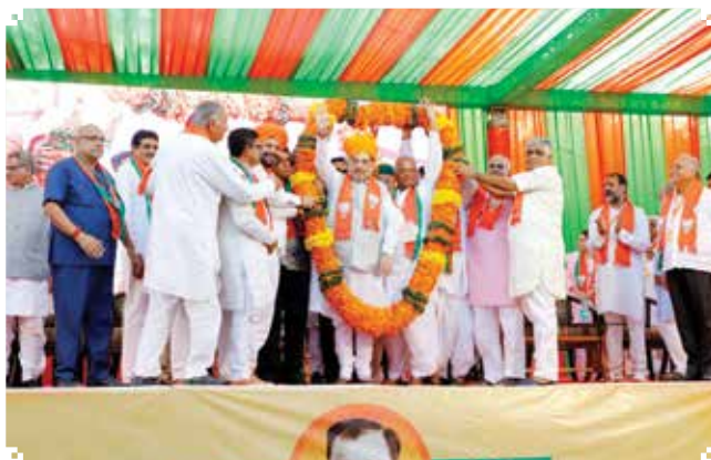
Rajasthan BJP welcomes BJP National President Shri Amit Shah during a Shakti Kendra Sammellan in Bikaner, Rajasthan