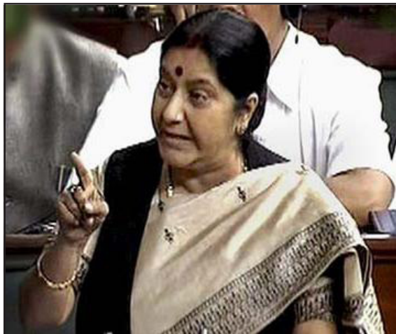
Synopsis of the speech on inflation on December 8, 2011 delivered by Leader of Opposition in Lok Sabha Smt. Sushma Swaraj.

However, on ground level the situation is that in Maharashtra cotton farmers are committing suicide, the farmers in Andhra are on a crop holiday and the paddy farmers in the entire country are desperately in search of help. Even the farmers of my home State, Haryana, who are producing basmati are crying. The farmers are on a crop holiday because the cost of inputs is so much that it will not be possible for the farmers to break even by selling their