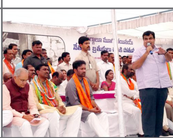
BJP National President Shri Nitin Gadkari addressing the people during 3 days hunger strike by BJP in Hyderabad