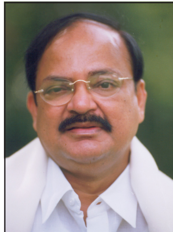
Synopsis of the speech delivered by Shri M. Venkaiah Naidu on December 7, 2011 in Rajya Sabha.

Farmers are leaving agriculture. Forty-three per cent of the farming community want to leave agriculture because it is not remunerative. Is it not time for us to address the problems of the farming community and set things right? If you are not capable of controlling the prices, if you have run out of ideas, if you have become politically bankrupt with regard to ideas, better quit, and then, let the people decide. ■