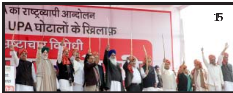
Bhrastachar Virodhi Mahasangram Rally at Ramlila ground, Delhi