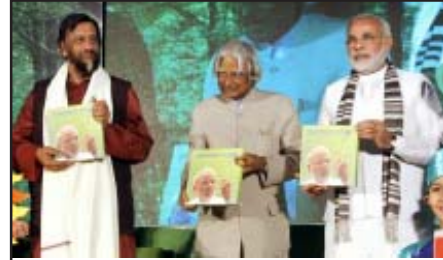
Convenient Action: Gujarat's Response to Climate Change released

'Convenient Action: Gujarat's Response to Climate Change' a book, which details the steps taken in Gujarat to meet the challenge, written by Gujarat Chief Minister Shri Narendra Modi was released in Ahmedabad on December 21 by former President Shri A P J Abdul Kalam and TERI director-general Shri R K Pachauri.