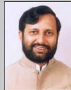
Press statement issued by BJP National Spokesperson Shri Prakash Javadekar MP on price hike in petrol on December 15, 2010

BJP demands that Government should immediately switch over to CPI regime. ■