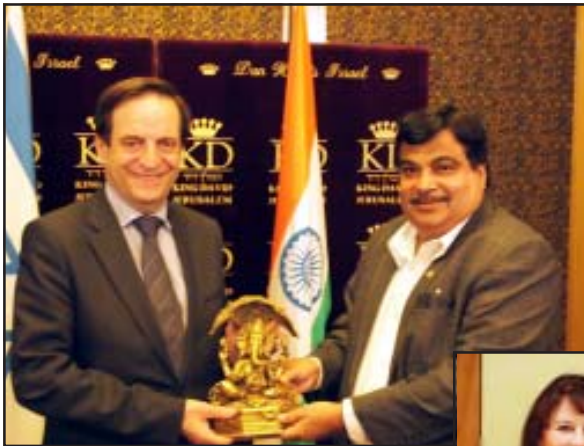
Shri Nitin Gadkari presenting Ganesh Idol to Deputy Prime Minister of Israel Mr Dan Meridor

While meeting with Israeli Deputy Prime Minister Mr. Dan Meridor MK, Shri Gadkari conveyed his sympathies for the bereaved families whose member lost lives in the devastating fire in northern Israel in last week.