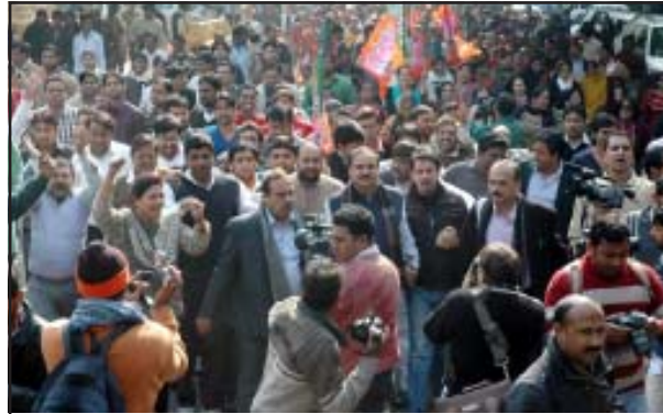
BJYM protests against petrol price hike in New Delhi

Addressing thousands of participants and supporters present in the march BJP National General Secretary Shri Ananth Kumar said that the 6th time increase in petroleum products announced by the Central Government is anti-people and BJP opposes this increase. Shri Kumar said the Central Government is full of corrupt persons and has nothing to do with the problems